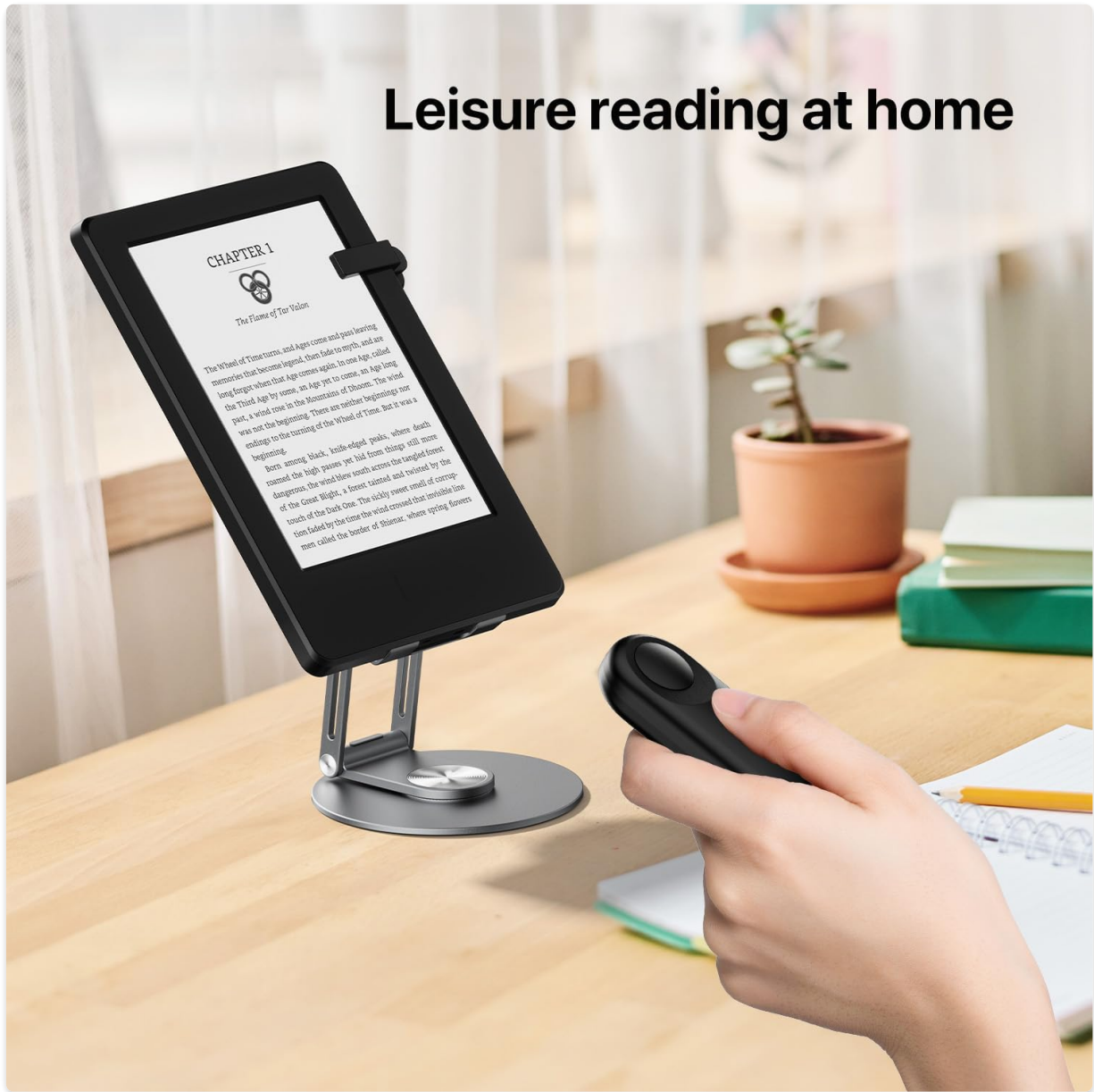
Figure 3: Enjoying leisure reading at home with the remote page turner.