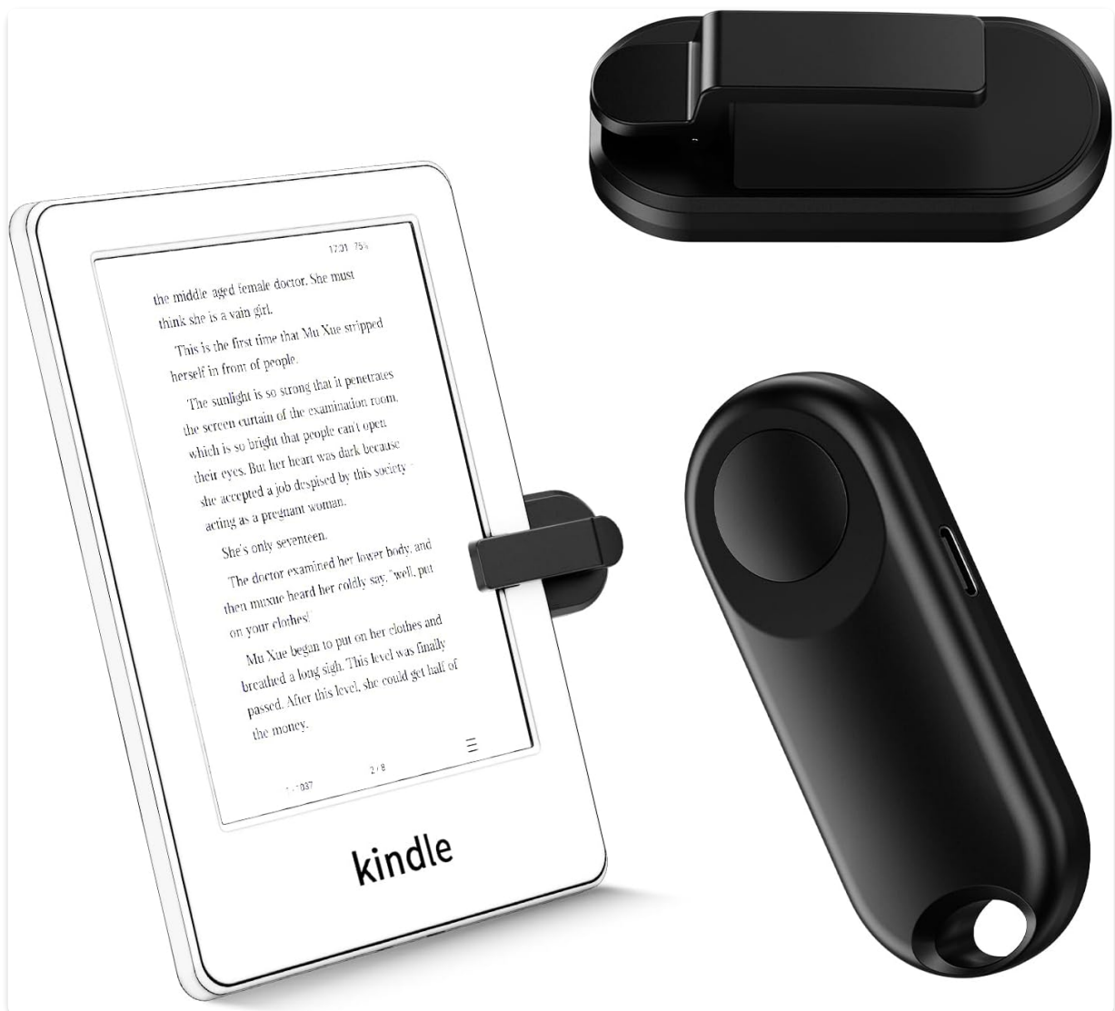
Figure 1: Remote control and page turner clip with an e-reader.