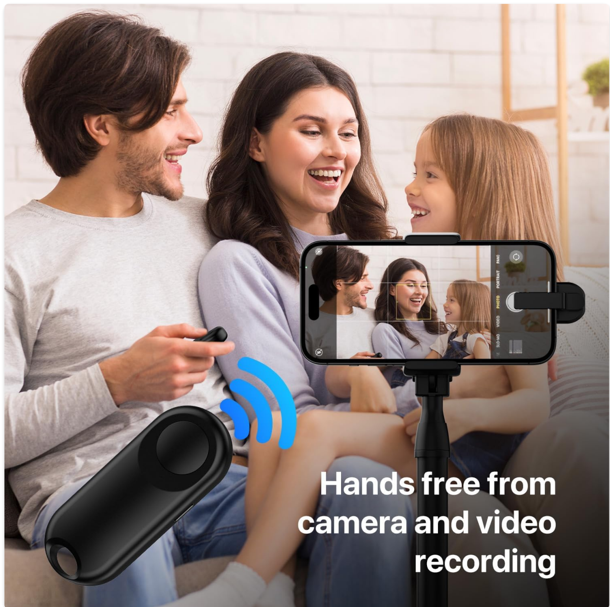
Figure 4: The remote can also be used for hands-free camera and video recording.