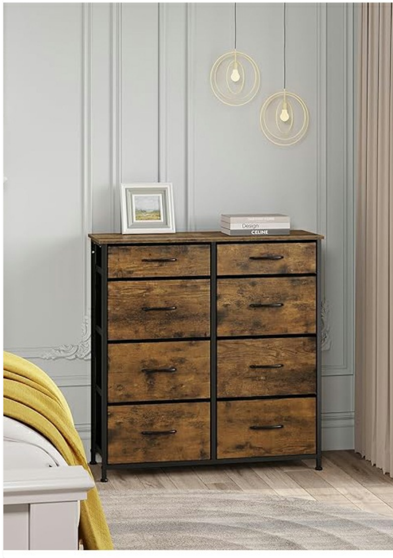
Image 6.1: The water-resistant surface is easy to clean with a damp cloth.