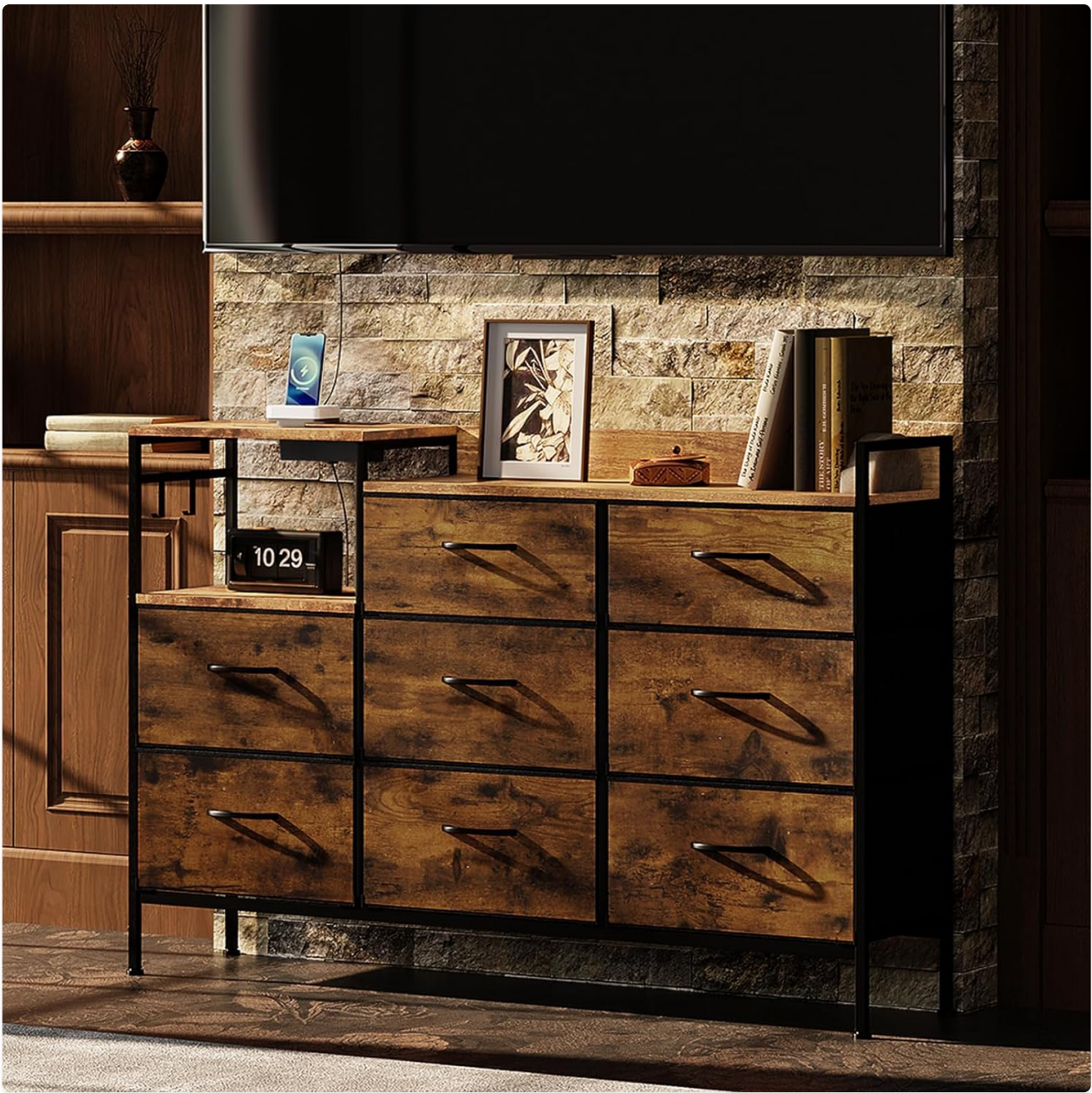
Image 1.1: The WOLTU SSK007hov 8-Drawer Dresser with Charging Station, featuring a rustic brown and black design, suitable for various room settings.