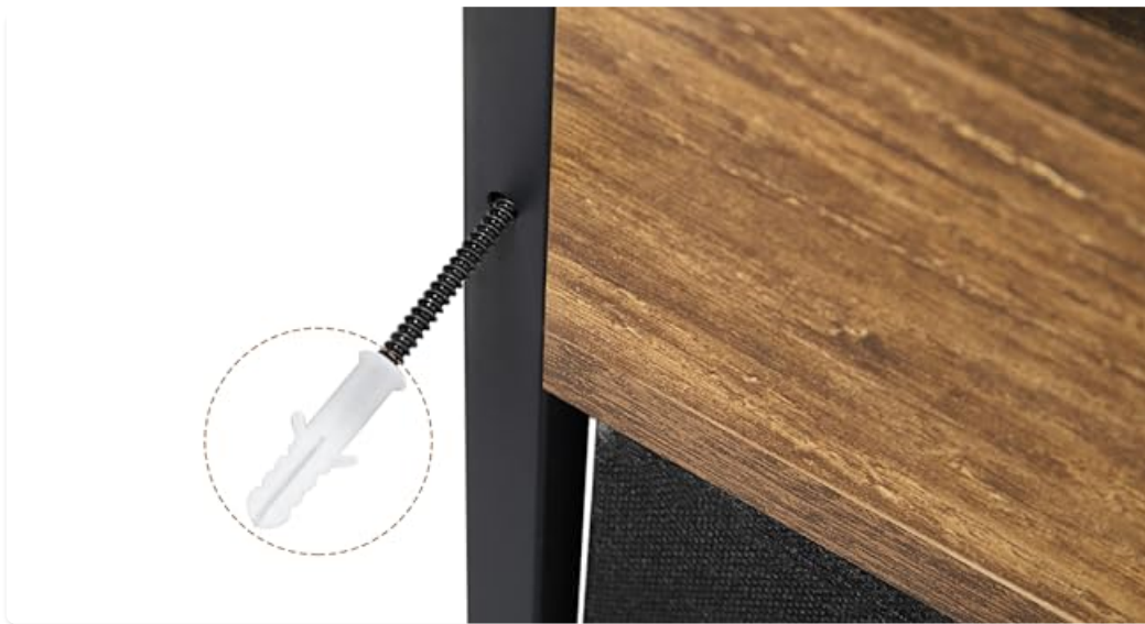
Image 2.1: Anti-tip device for wall mounting, essential for stability.