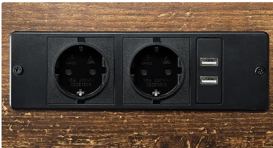
Image 2.2: Integrated charging station with two USB ports and two power outlets.