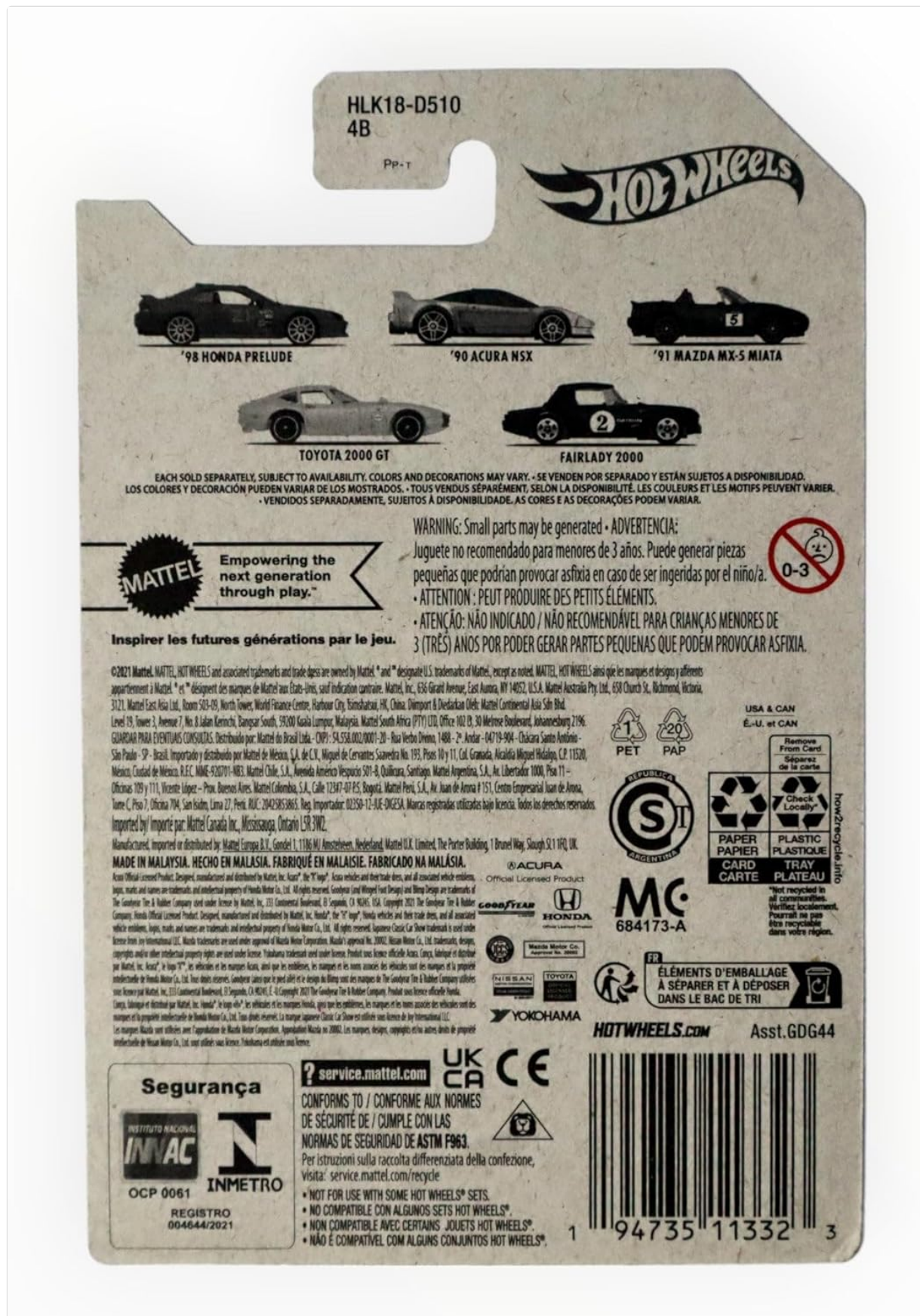
Figure 8.1: Back view of the '90 Acura NSX die-cast model packaging, showing safety warnings and manufacturer information.

environment to prevent injury or damage.