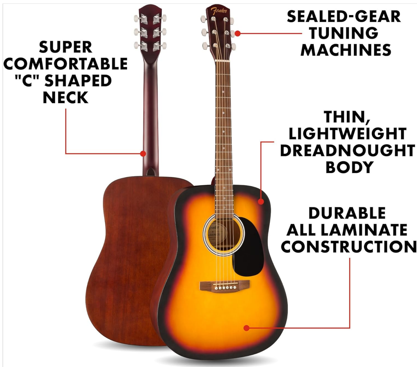
Image: A detailed view highlighting key features of the Fender FA-25, including the comfortable 'C' shaped neck and sealed-gear tuning machines for stable tuning.

Over time, strings will wear out and lose their tone. Replace strings one at a time to maintain neck tension. Use light gauge acoustic guitar strings for optimal playability and tone on the FA-25. Ensure strings are properly seated in the bridge pins and wound securely around the tuning posts.