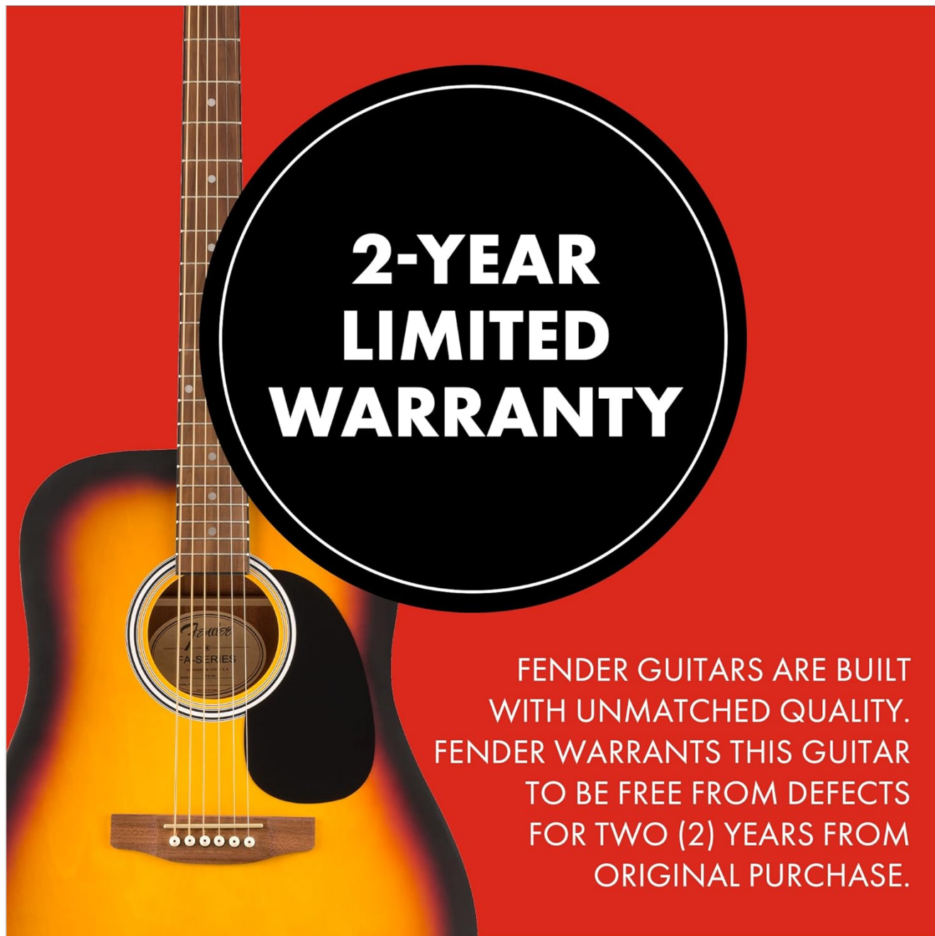
Image: Official Fender statement regarding the 2-Year Limited Warranty, assuring quality and defect coverage.

Your Fender FA-25 Dreadnought Acoustic Guitar is backed by a 2-year limited warranty from the original date of purchase. Fender guitars are built with unmatched quality, and this warranty ensures your guitar is free from defects for two (2) years. Please retain your proof of purchase for warranty claims.