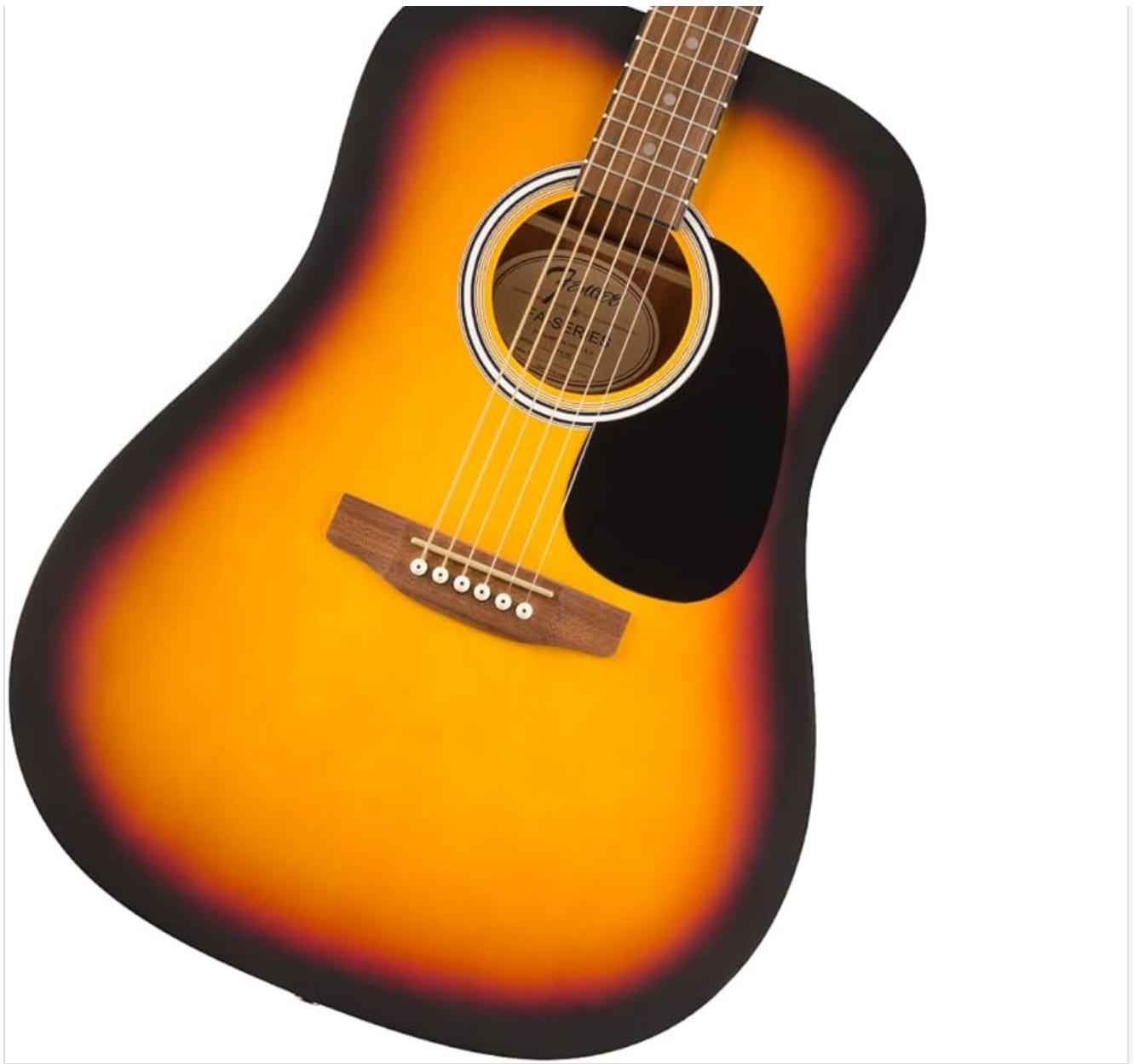
Image: The Fender FA-25 Dreadnought Acoustic Guitar, showcasing its classic sunburst finish and dreadnought body shape.