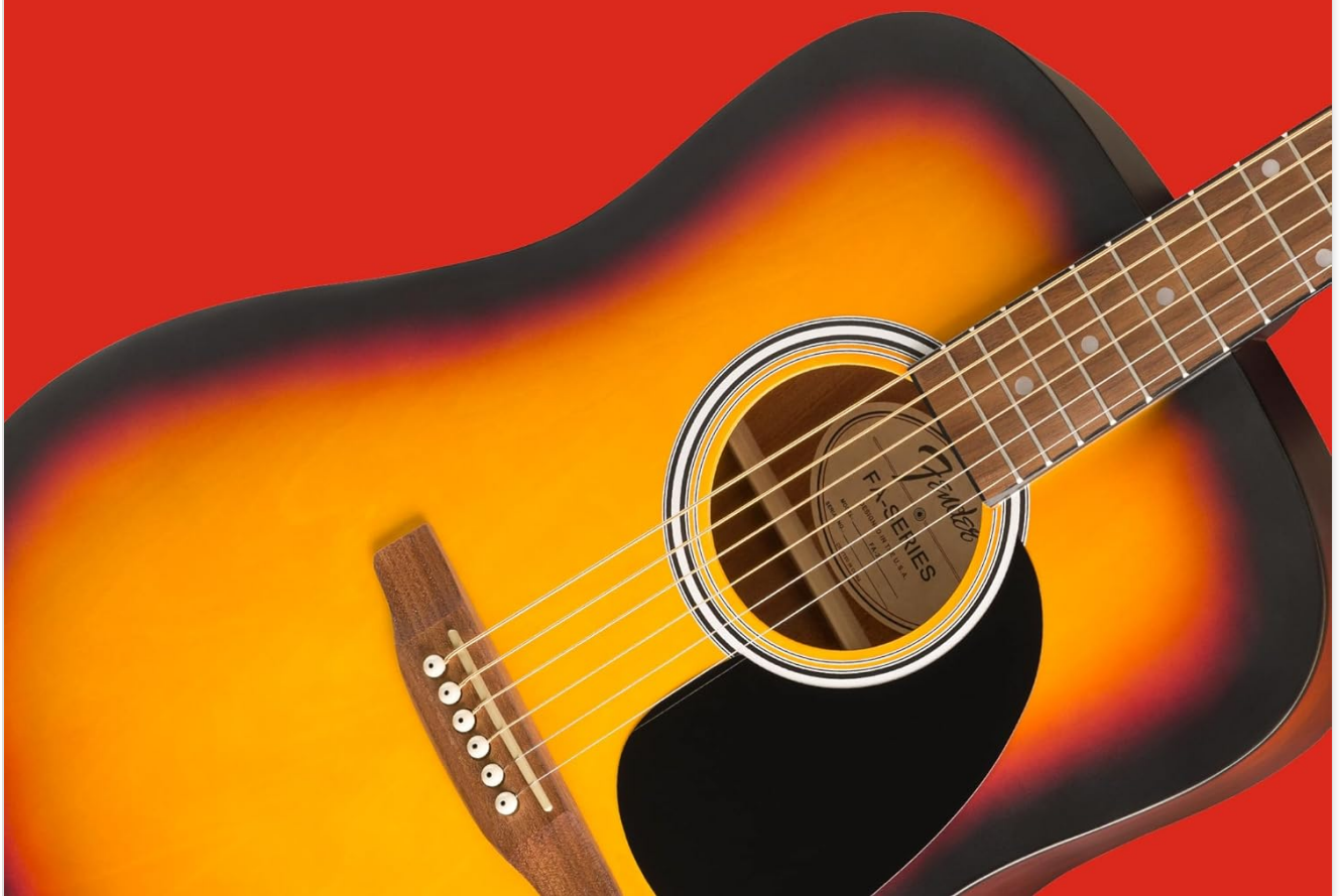
Image: Emphasizing the Fender FA-25's design for beginners, highlighting Fender's reputation in guitar manufacturing.

DESIGNED FOR BEGINNERS BY THE MOST TRUSTED NAME IN GUITAR