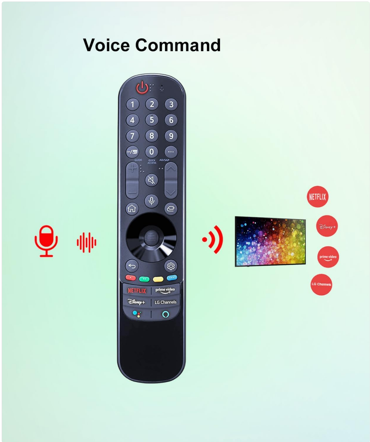
Image 6.2: This image illustrates the voice command feature, showing the microphone icon and sound waves indicating voice input, which is then processed to control the TV or access streaming services like Netflix, Disney+, Prime Video, and LG Channels.