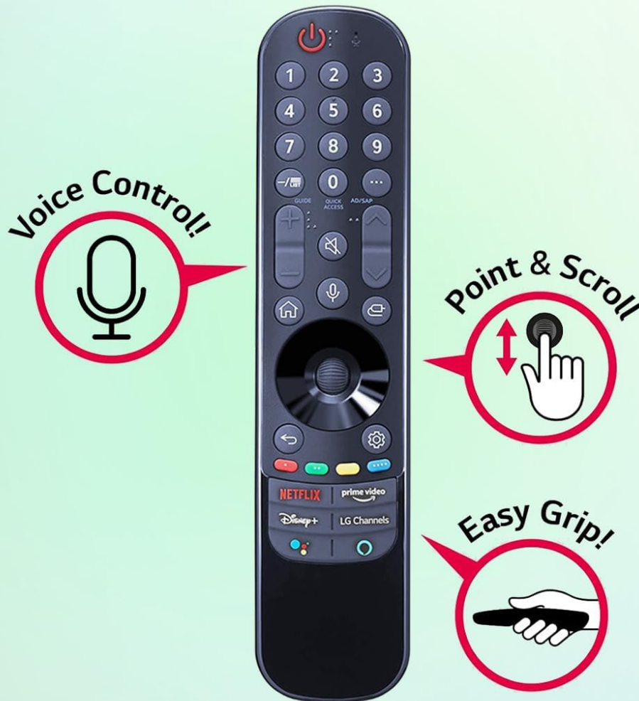
Image 4.3: This image highlights the remote's capabilities: Voice Control for issuing commands, Point & Scroll for navigating menus with a cursor, and an Easy Grip design for comfortable handling.