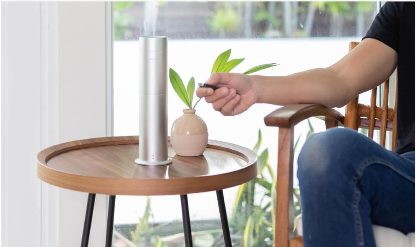
Figure 3: The remote control allows for easy adjustment of scent intensity and timer settings.

Experience ultimate convenience with our wireless diffuser, effortlessly filling any space with your favorite fragrances. Enjoy the freedom of placement and a touch of elegance in your home, all without the clutter of cords.