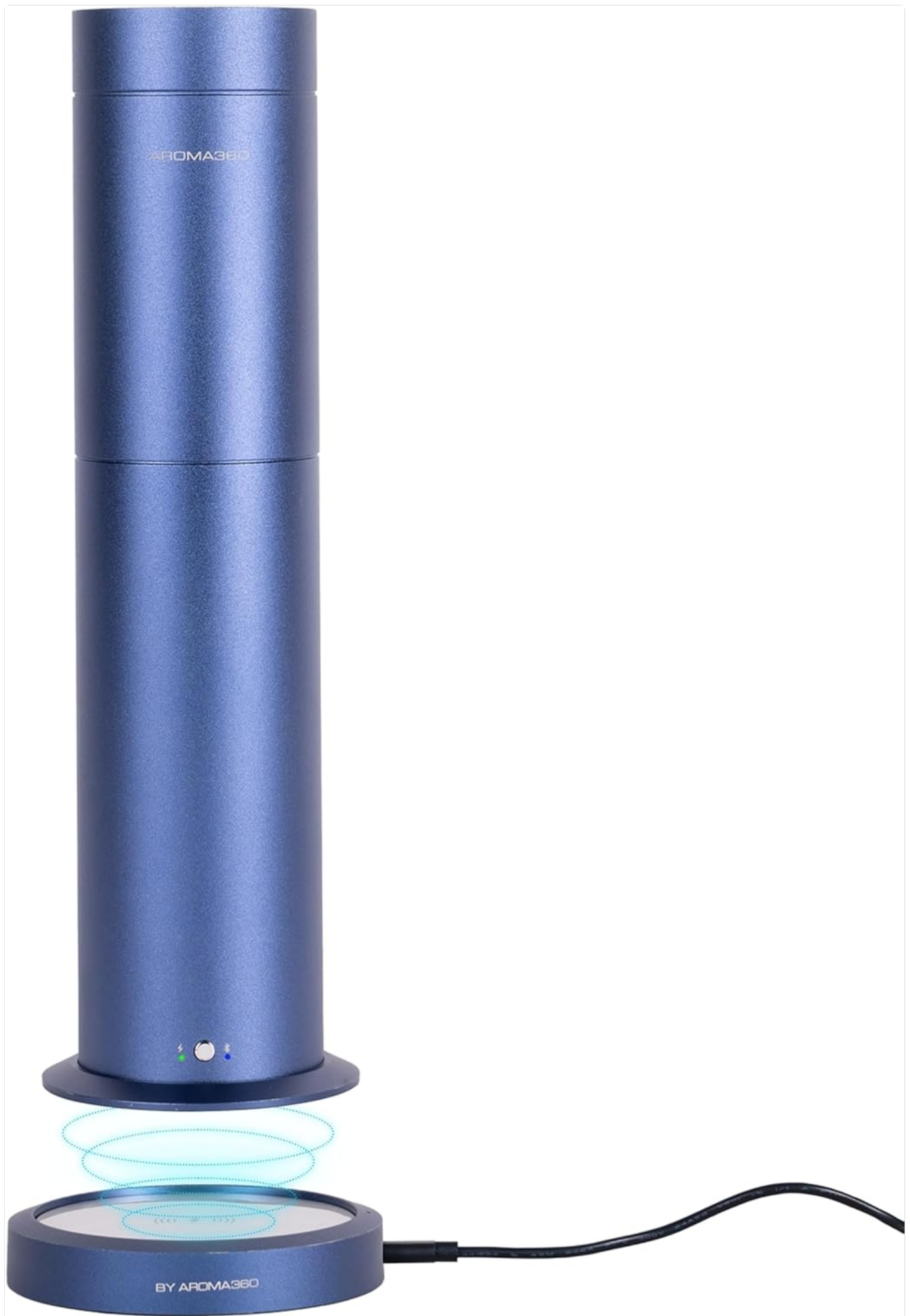
Figure 1: The Aroma360 Wireless Pro Essential Oil Diffuser in blue, showcasing its sleek cylindrical design and charging base.