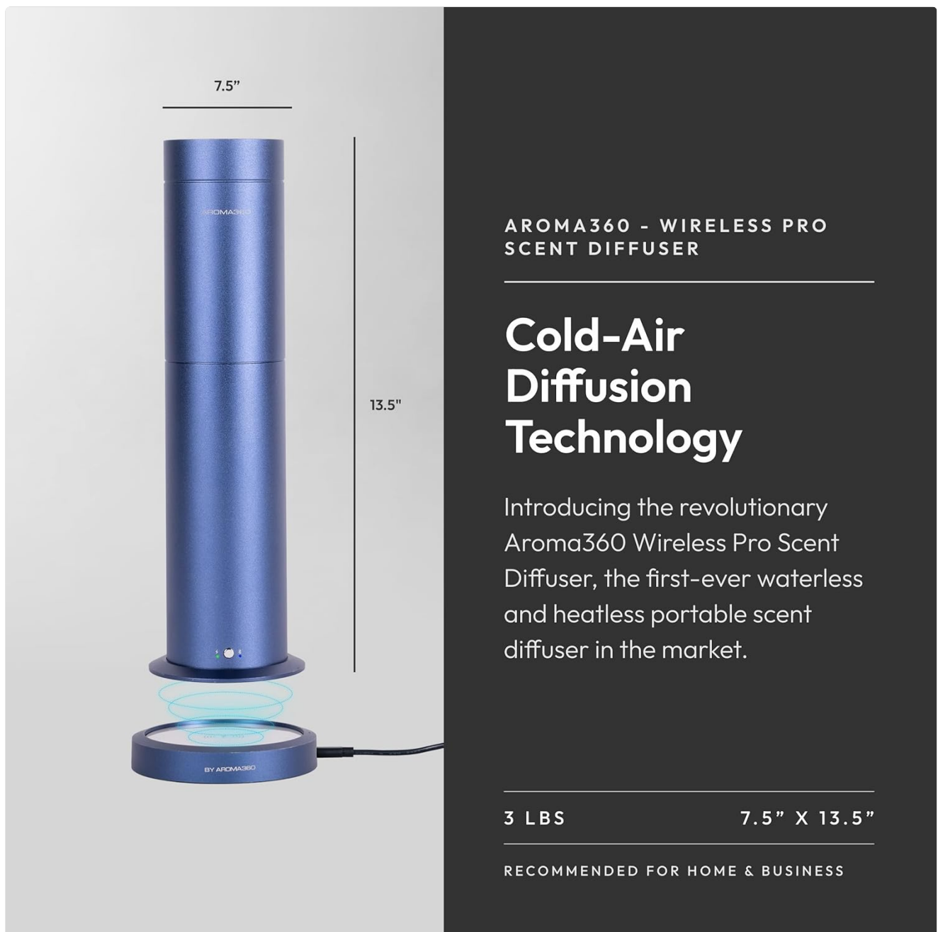
Figure 5: Product dimensions and weight for the Aroma360 Wireless Pro Scent Diffuser.