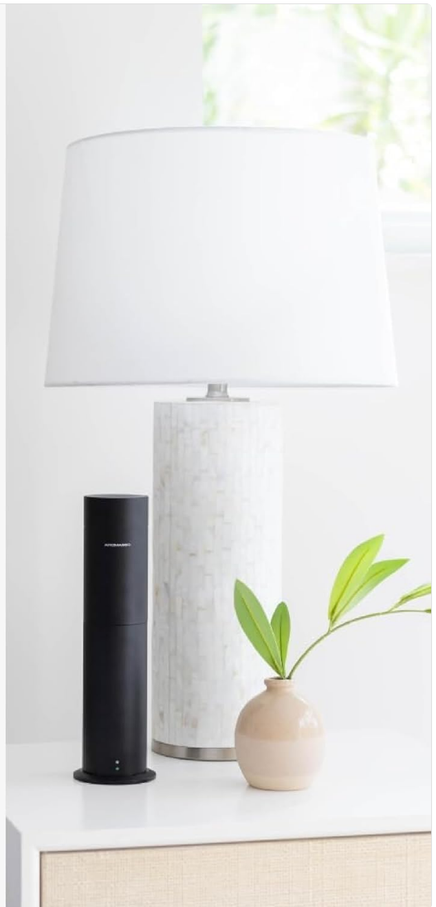
Figure 2: The diffuser is designed for effortless placement, emphasizing its wireless operation.

With up to 12 hours of portable usage, experience the ultimate convenience with the mess-free and easy-to-add oil refills, making scenting your space a breeze.