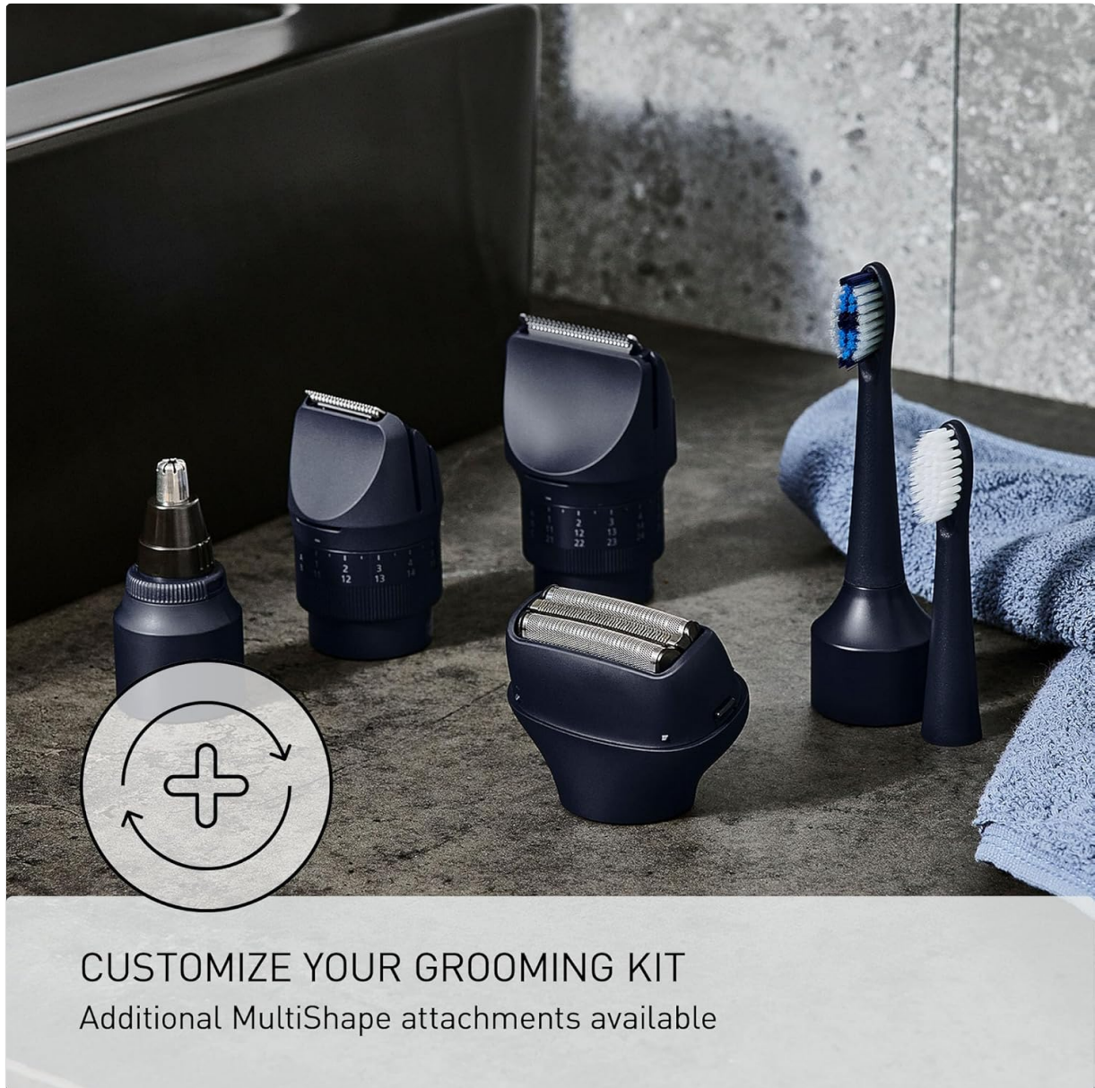
Image: The Panasonic MultiShape trimmer main unit displayed alongside its various interchangeable attachments, including different sized comb guides, a nose hair trimmer, and a toothbrush head, showcasing its modular design.