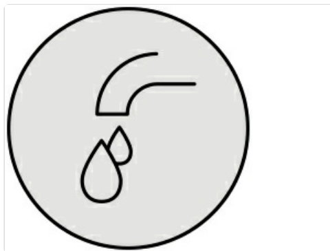
Image: A circular icon depicting a water droplet and dots, symbolizing the trimmer's wet/dry functionality.

The Panasonic MultiShape trimmer is fully waterproof, allowing for convenient wet or dry operation. You can use it in the shower with shaving foam or gel for a comfortable experience, or dry for a quick trim. Always ensure the charging port cover is securely closed when using in wet conditions.