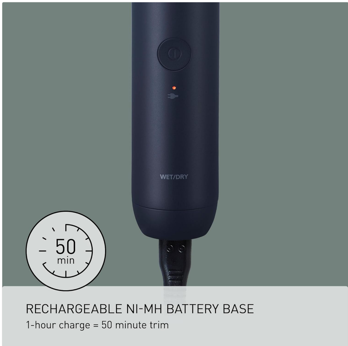
Image: The Panasonic MultiShape trimmer's base connected to its charging cable, with an indicator light visible, showing the device in the process of charging.