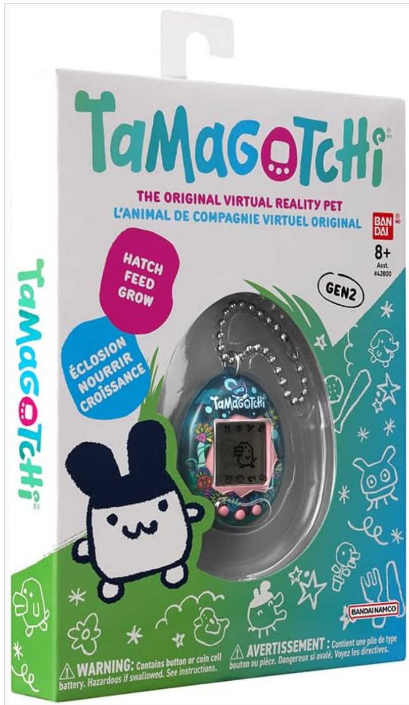
Image: A Tamagotchi device held in a hand, demonstrating its compact size and portability, attached to a keychain.

Your Tamagotchi will evolve through different stages: egg, child, and adult. The way you care for your Tamagotchi, including feeding habits, discipline, and success in the game, will influence which of the 7 possible adult characters it will evolve into.