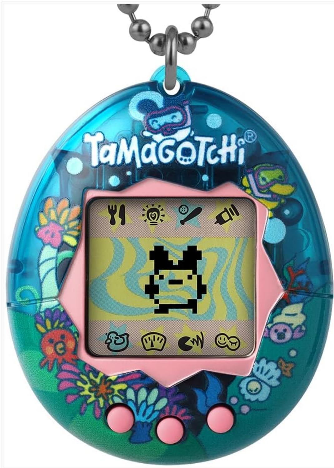
Image: The Tamagotchi Original - Tama Ocean device, featuring a translucent blue shell with ocean-themed decorations and a pink screen frame.