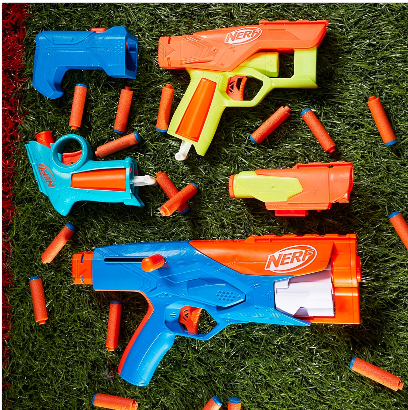
Image: All included components of the Gear Up Pack, including blasters, accessories, and darts, neatly arranged.