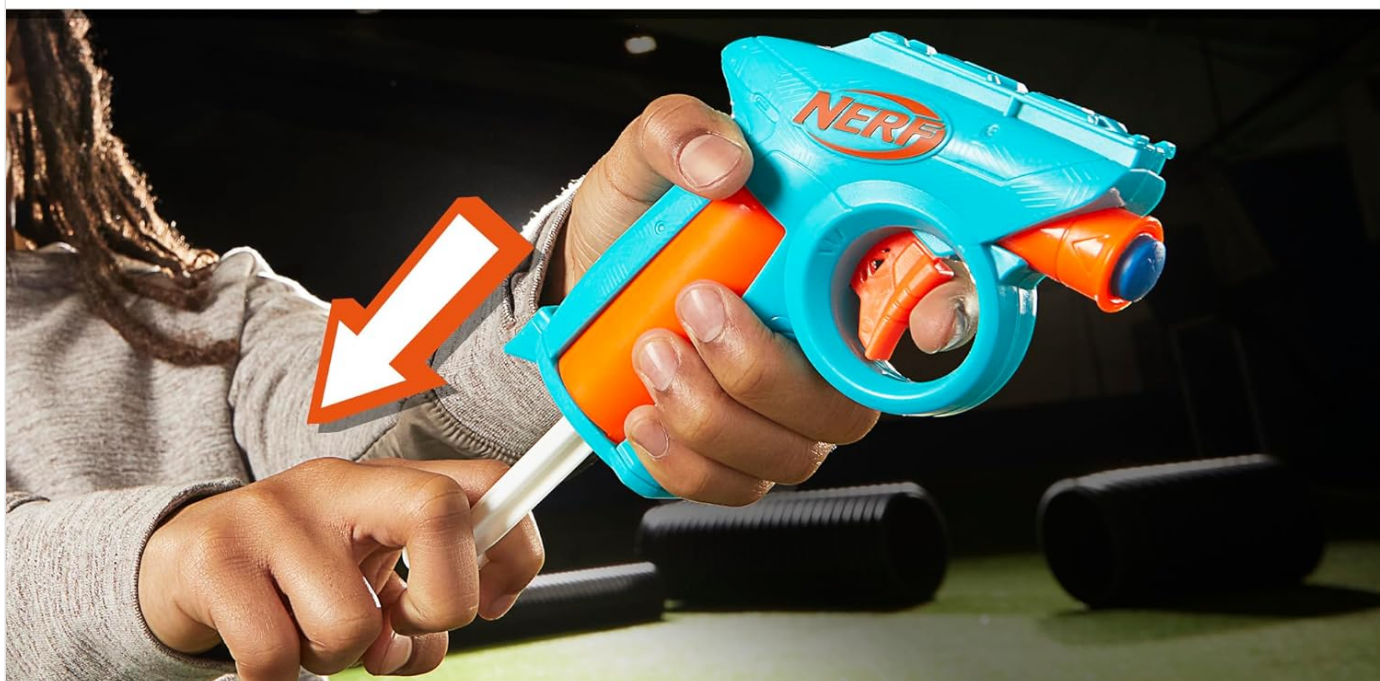
Image: A user demonstrating how to load an N1 dart into the Flex blaster and prime the pull-down mechanism.