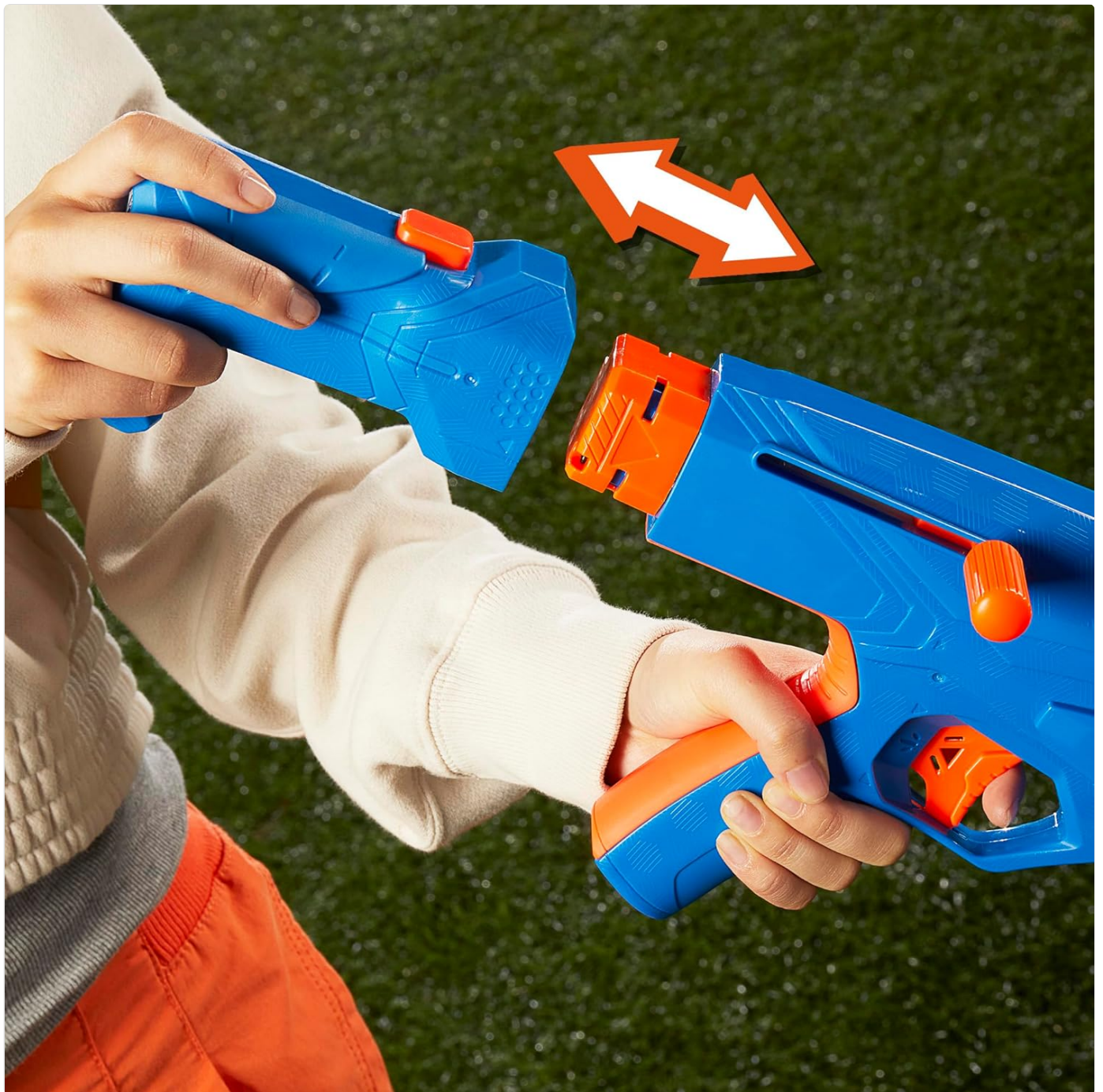
Image: A close-up view demonstrating the attachment of the removable stock to a blaster, highlighting the connection point.