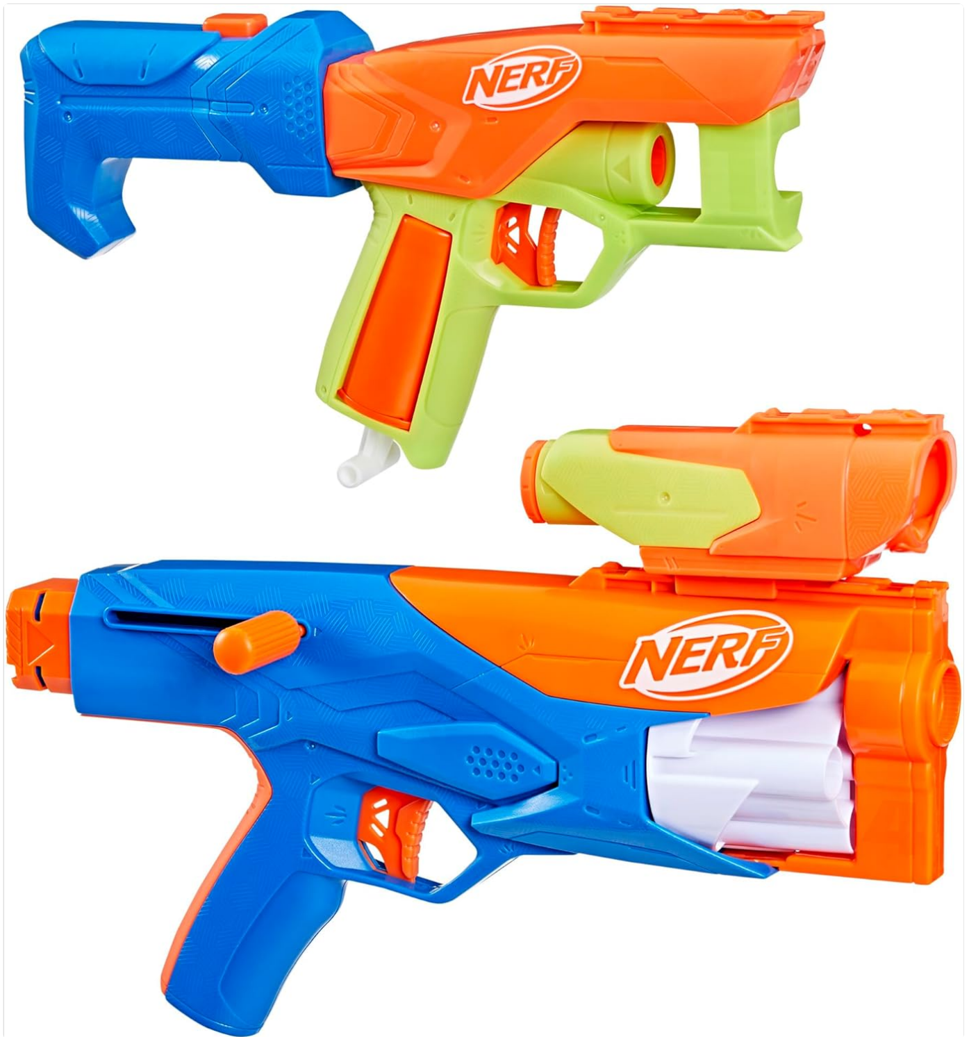
Image: Examples of different blaster configurations achieved by attaching the scope and stock accessories.