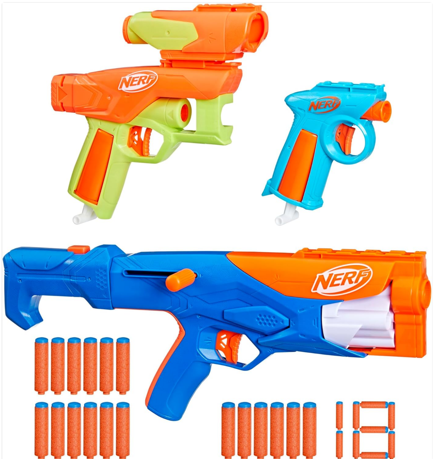
Image: The Nerf N Series Gear Up Pack, showcasing the three blasters (Wielder, Dealer, Flex) and the included N1 darts.