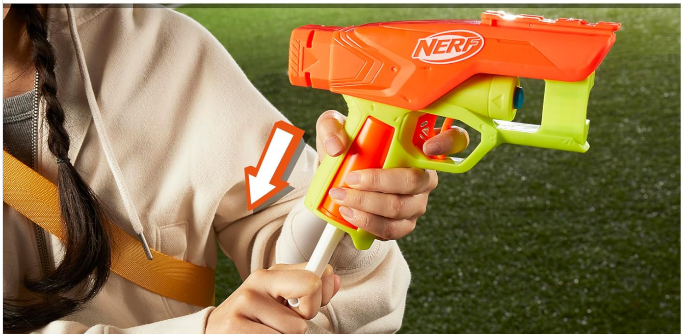
Image: A user demonstrating how to load an N1 dart into the Dealer blaster and prime the pull-down mechanism.