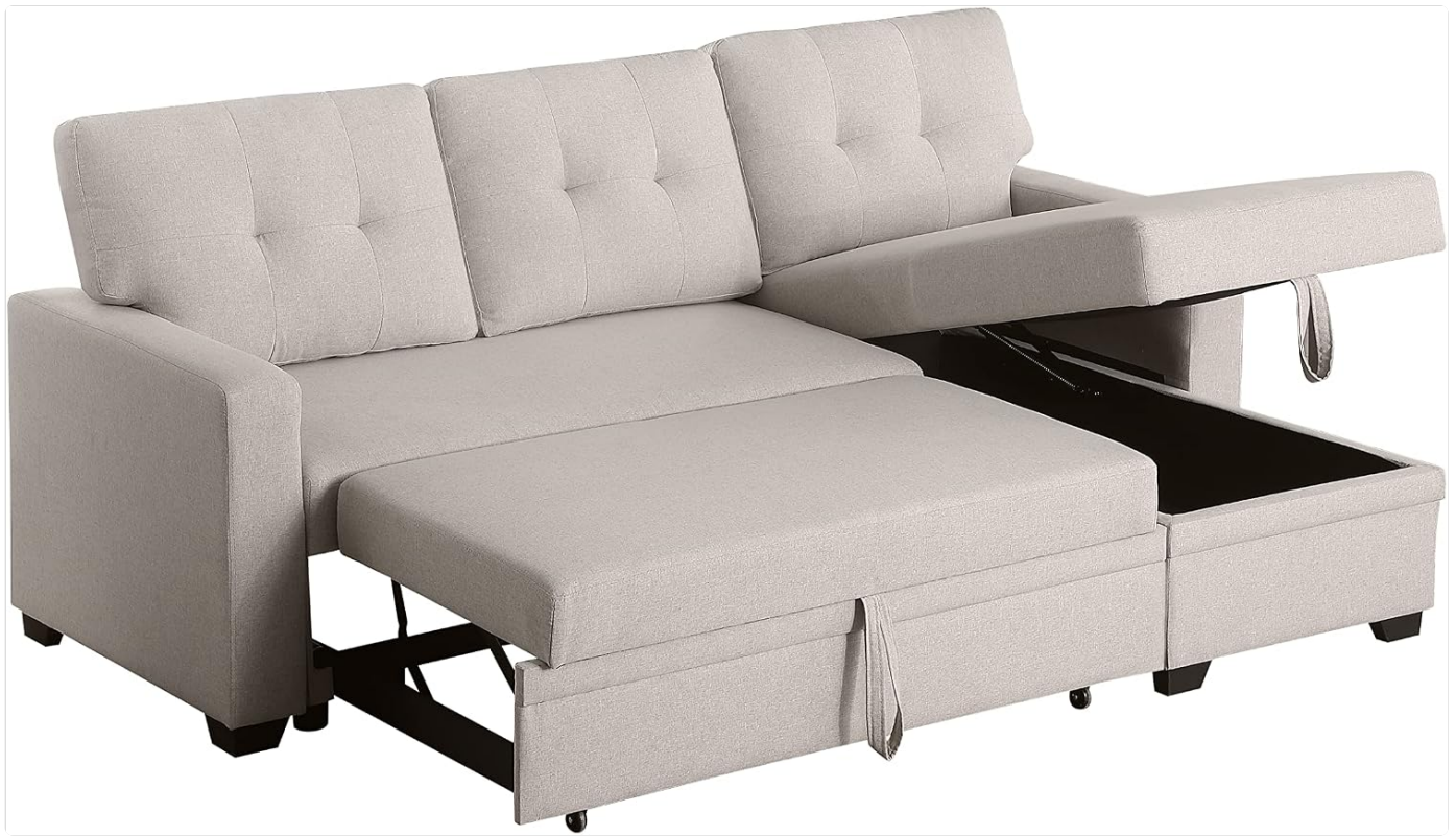
Image 4.1: The sofa sectional with the pull-out sleeper bed fully extended, ready for use.