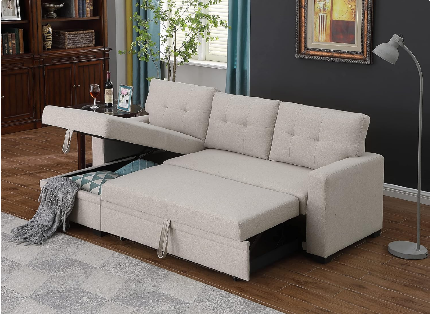
Image 3.1: The sofa sectional with the pull-out bed extended and the storage chaise lid lifted, illustrating its multi-functional design.