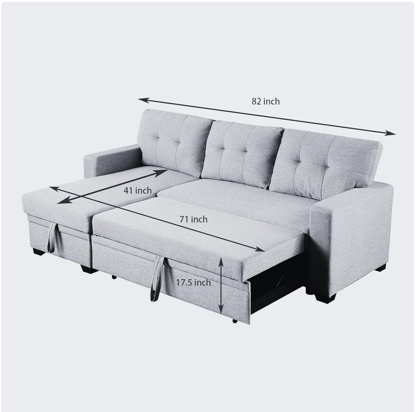
Image 1.1: Front view of the LOVMOR L-Shape Sofa Sectional in beige.