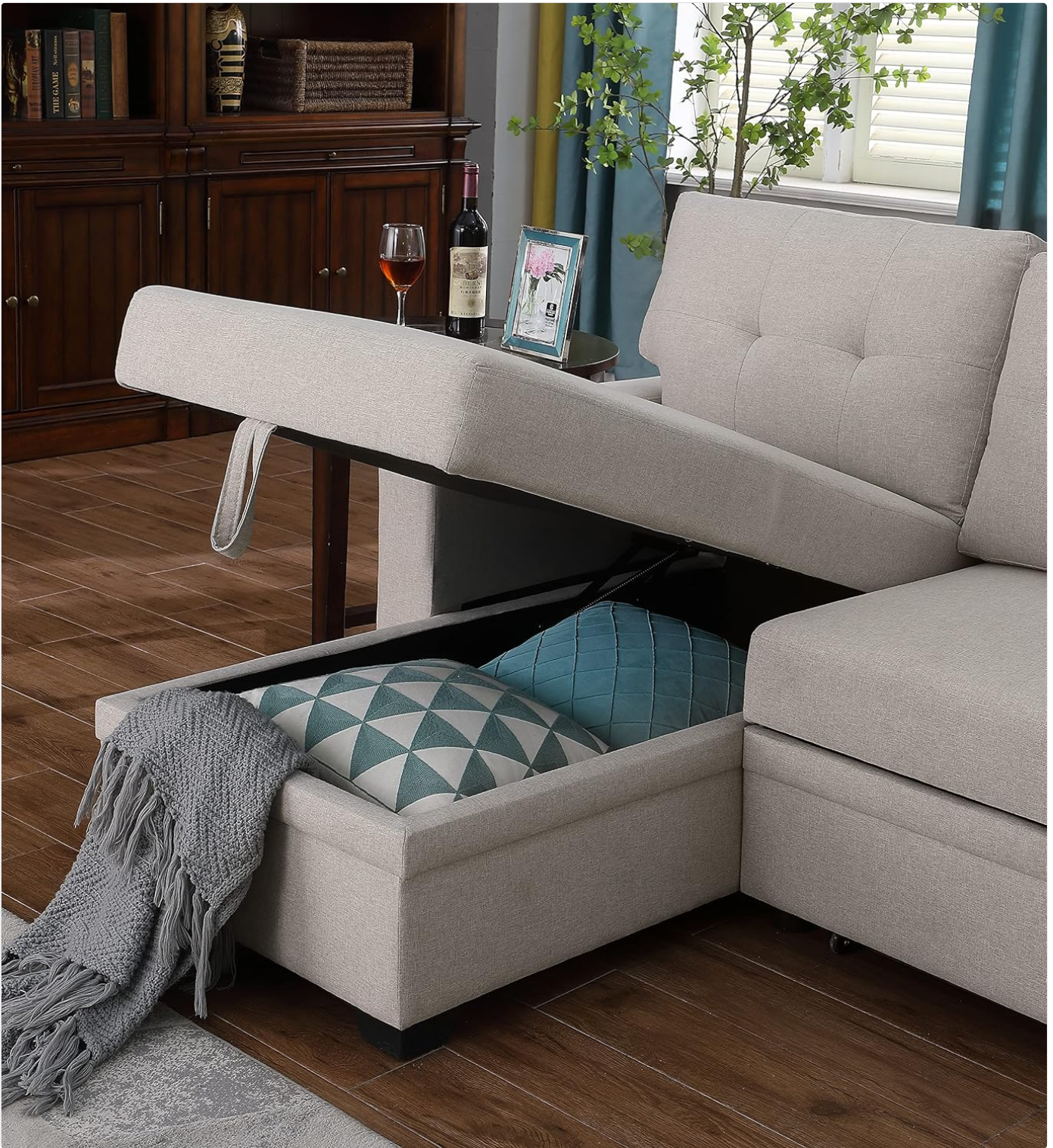
Image 4.2: The chaise section of the sofa with its top lifted, revealing the integrated storage compartment.