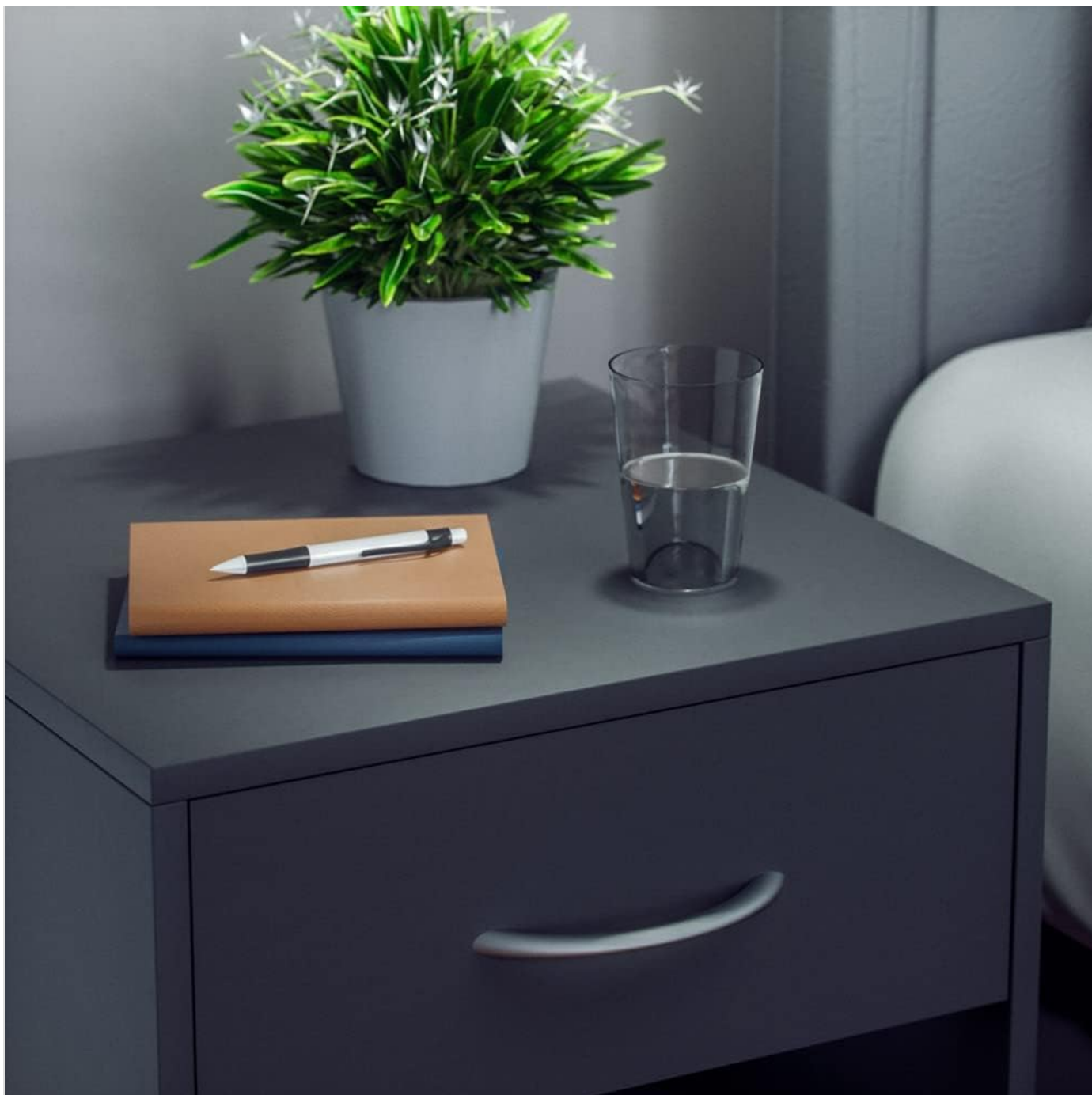
Image 5.2: The top surface of the nightstand displaying common bedside items such as a potted plant, a notebook with a pen, and a glass of water.