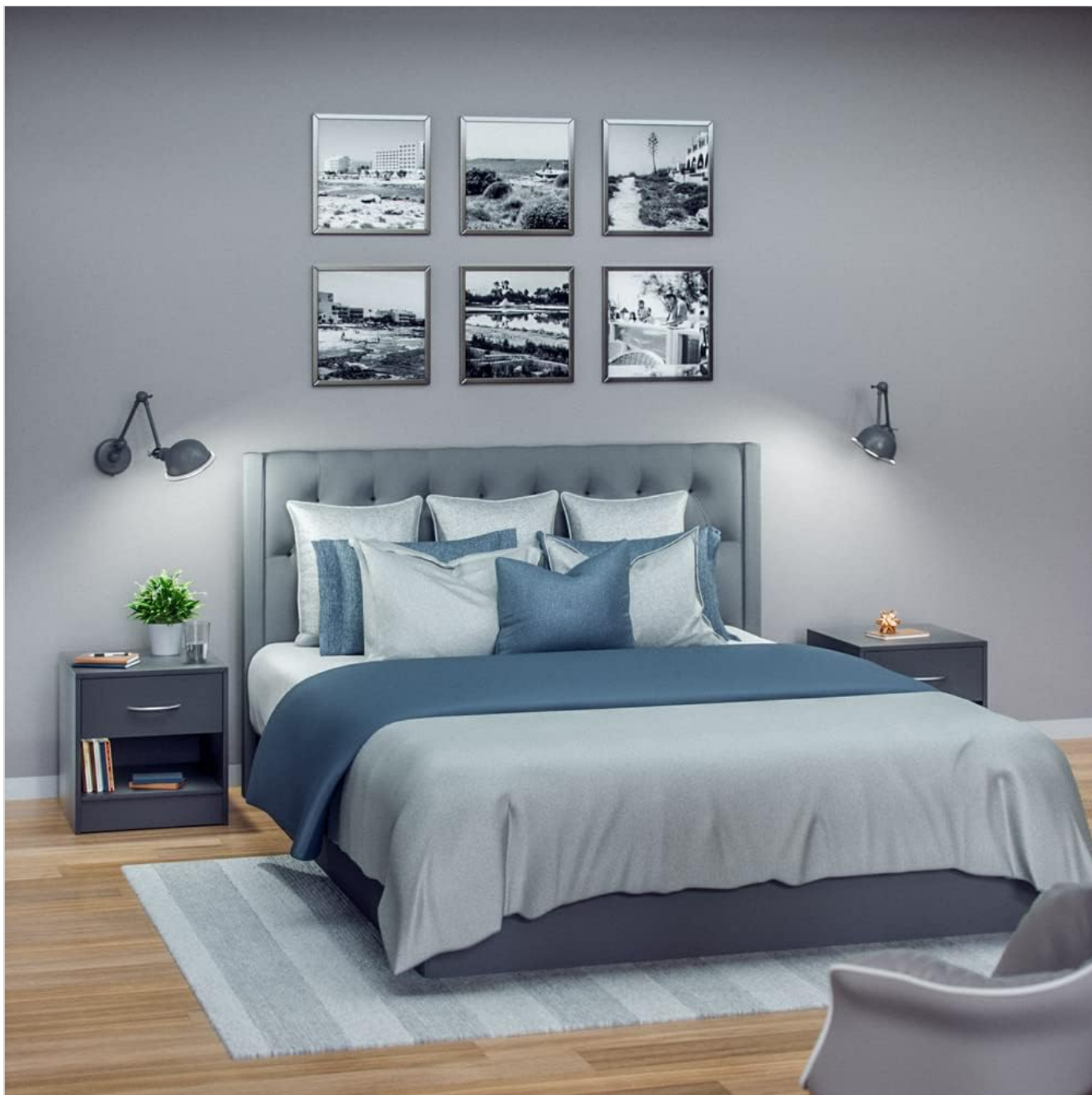
Image 4.1: Two Casaria Kiel Nightstands positioned on either side of a bed, demonstrating their intended use in a bedroom environment.