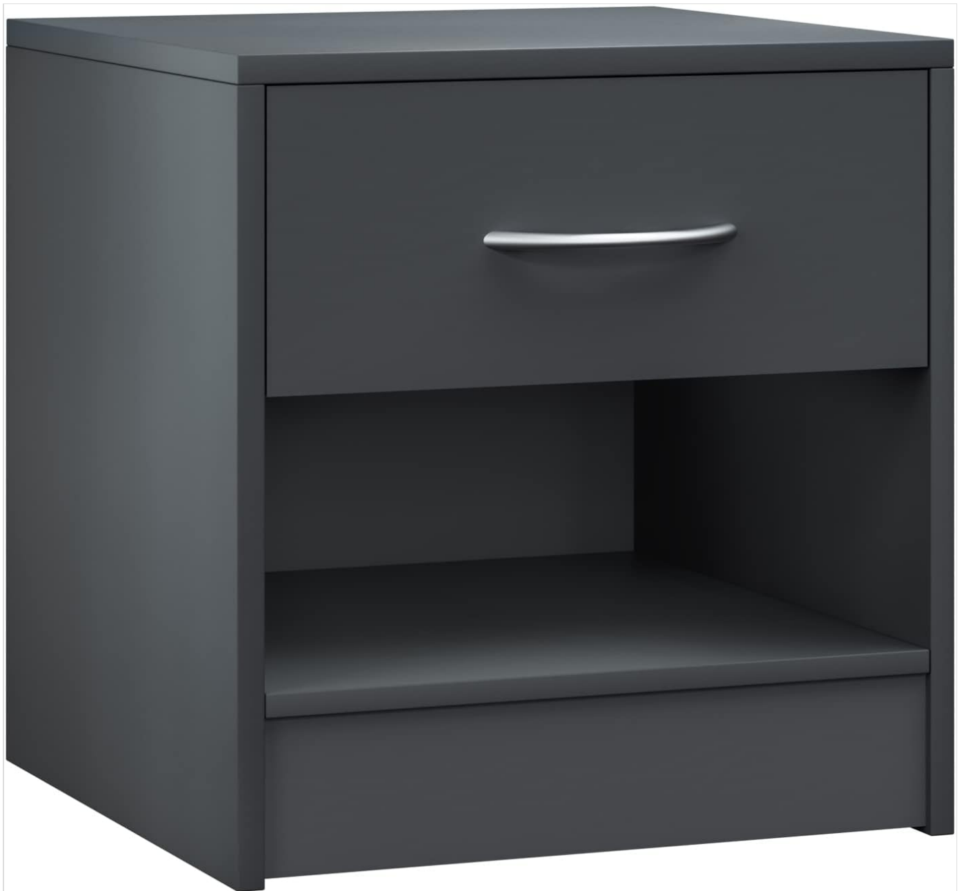
Image 1.1: Front view of the Casaria Kiel Nightstand in anthracite, showcasing its single drawer and open storage compartment.