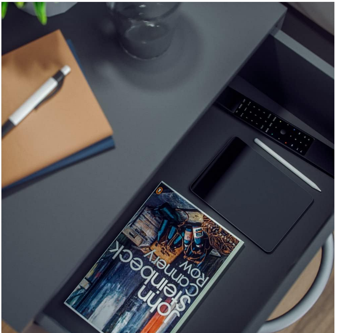
Image 5.1: A close-up view of the nightstand's drawer, illustrating its capacity to hold items like a tablet, remote control, and a book.