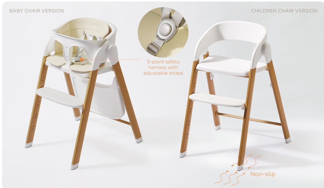
Figure 4.1: High chair adaptability from baby to children's use.