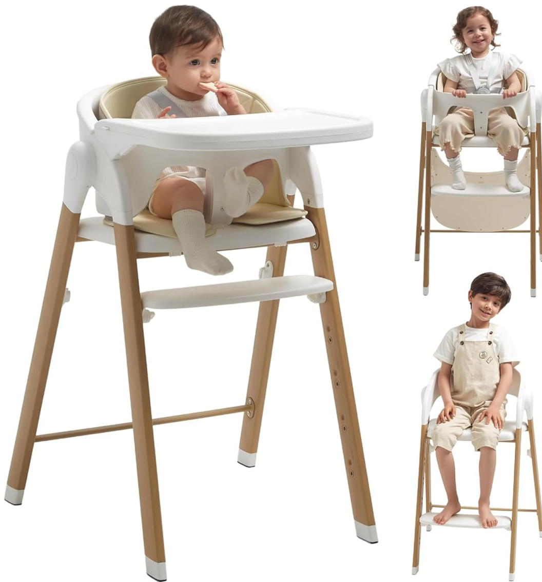
Figure 1.1: KUB High Chair demonstrating its adaptability for different age groups.