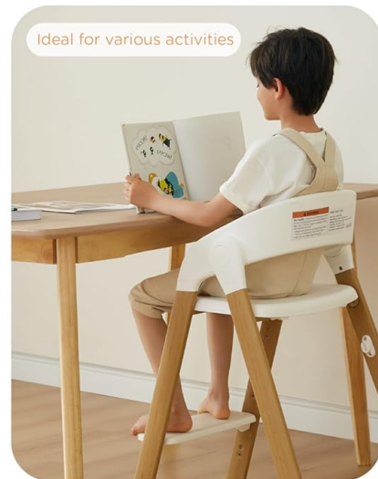
Figure 4.4: Footrest adjustment and usage for various activities.