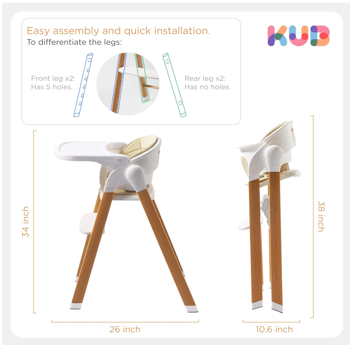
Figure 3.1: Assembly guide highlighting leg identification and overall dimensions.

For detailed step-by-step instructions, please refer to the included assembly manual provided in the product packaging.