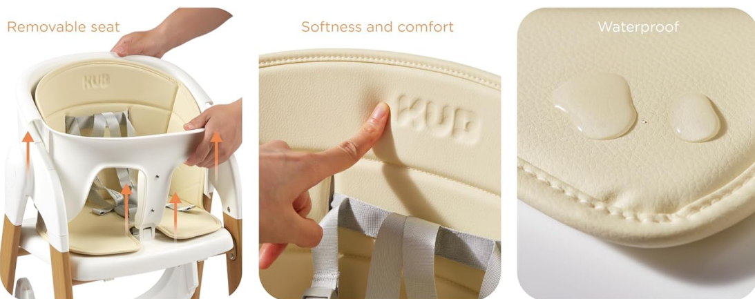
Figure 4.2: Ergonomic seat features including removable cushion and waterproof material.