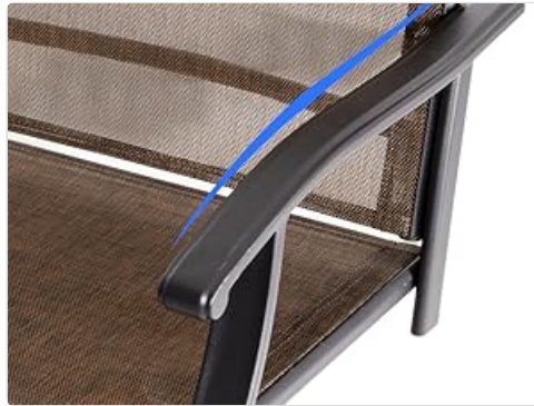
Image: Detail of a bar stool frame, highlighting the metal construction and textile seat material.

Attach the chair base to the seat frame. Ensure the swivel mechanism is correctly aligned. Secure all bolts loosely at first, then tighten completely once all parts are in place.