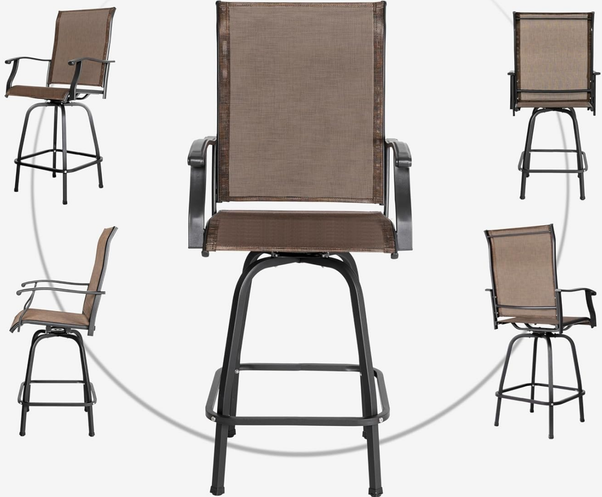
Image: A visual representation of the 360-degree swivel capability of the bar stool.

360-degree rotation and slightly rocking forth and back to enjoy a smooth swing