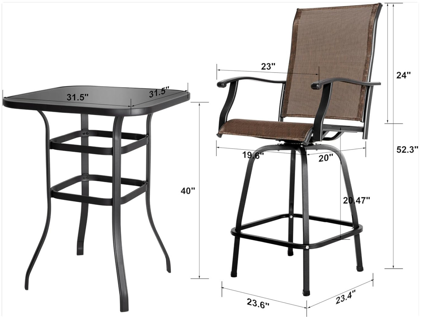
Image: Dimensional drawing of the bar table and swivel bar stool, indicating height, width, and depth measurements.