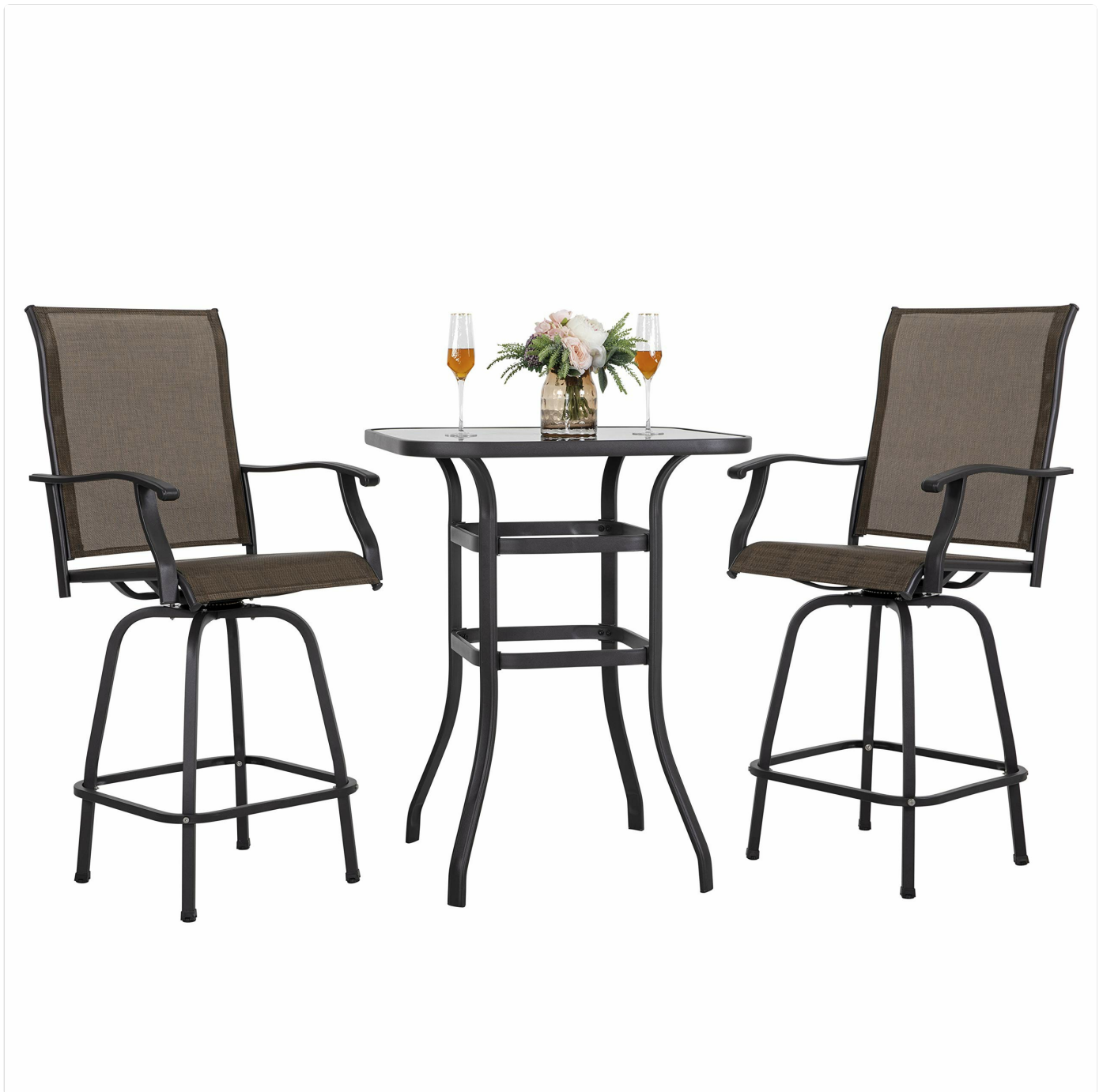
Image: The NUU GARDEN 3 Piece Patio Bar Set, featuring a square table and two swivel bar stools, placed outdoors against a green, ivy-covered wall.