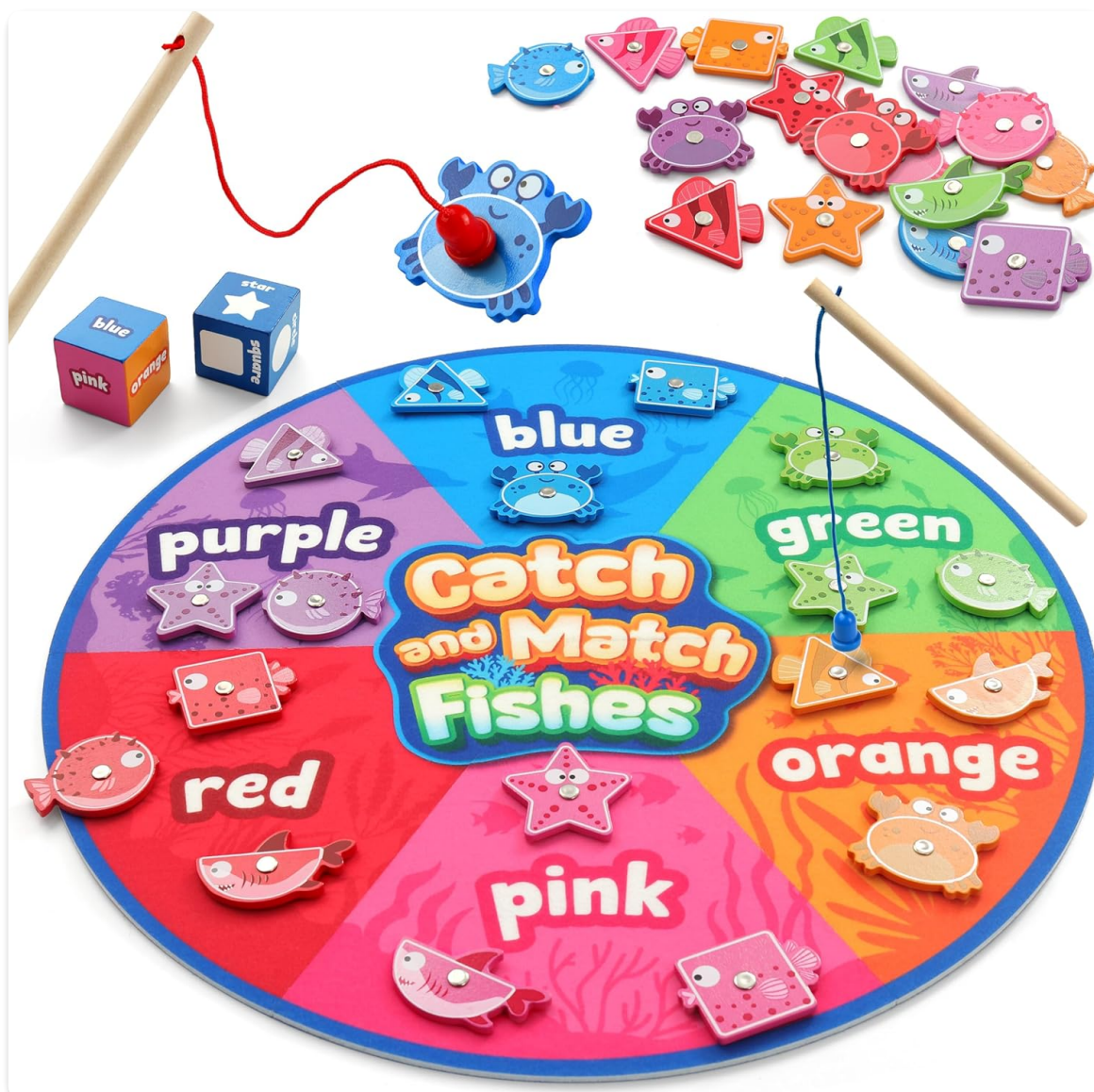
The game ready for play on the color-sorting side of the mat.