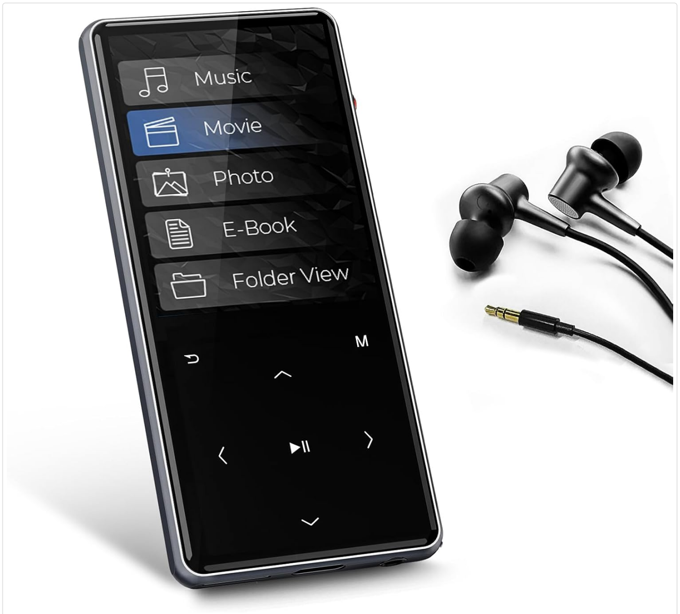
Image: The HIFI WALKER M7 MP3 player displaying its main menu with options like Music, Movie, Photo, E-Book, and Folder View, alongside the included earphones.