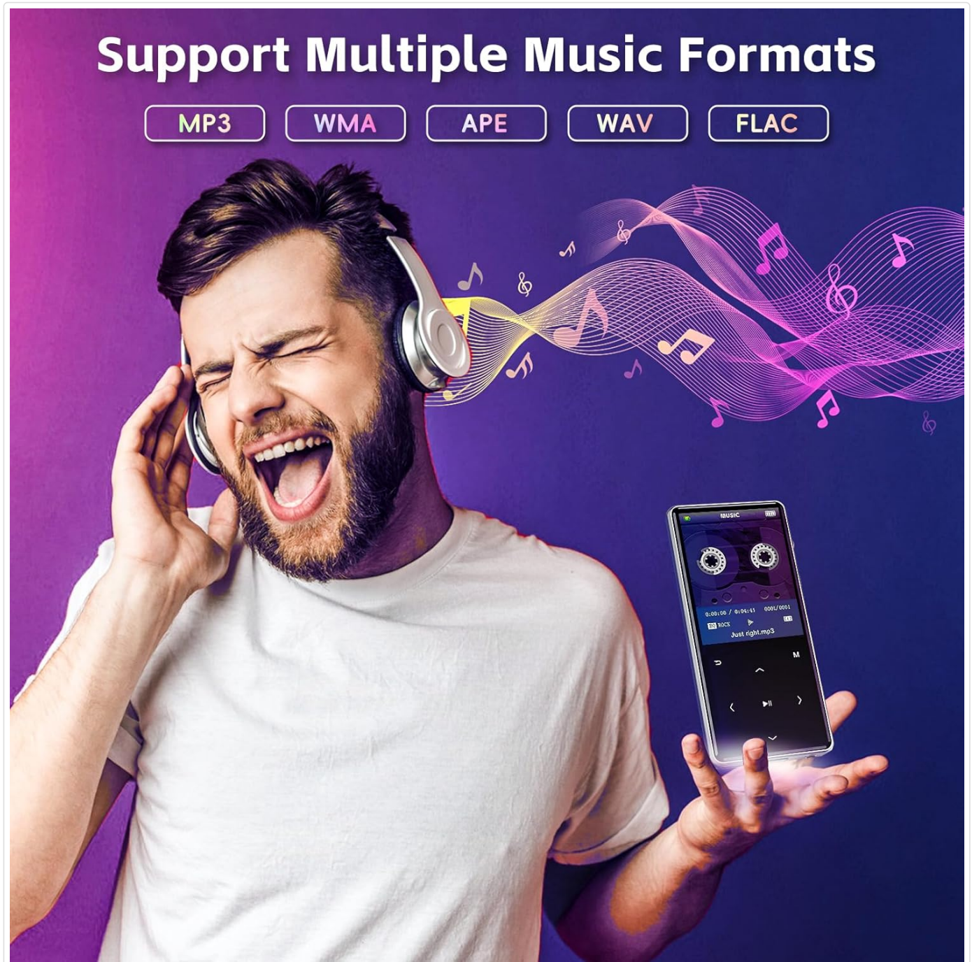
Image: A person enjoying music with headphones, with the HIFI WALKER M7 MP3 player in the foreground, highlighting support for various audio formats like MP3, WMA, APE, WAV, and FLAC.

The player supports MP3, WMA, WAV, APE, and FLAC formats.