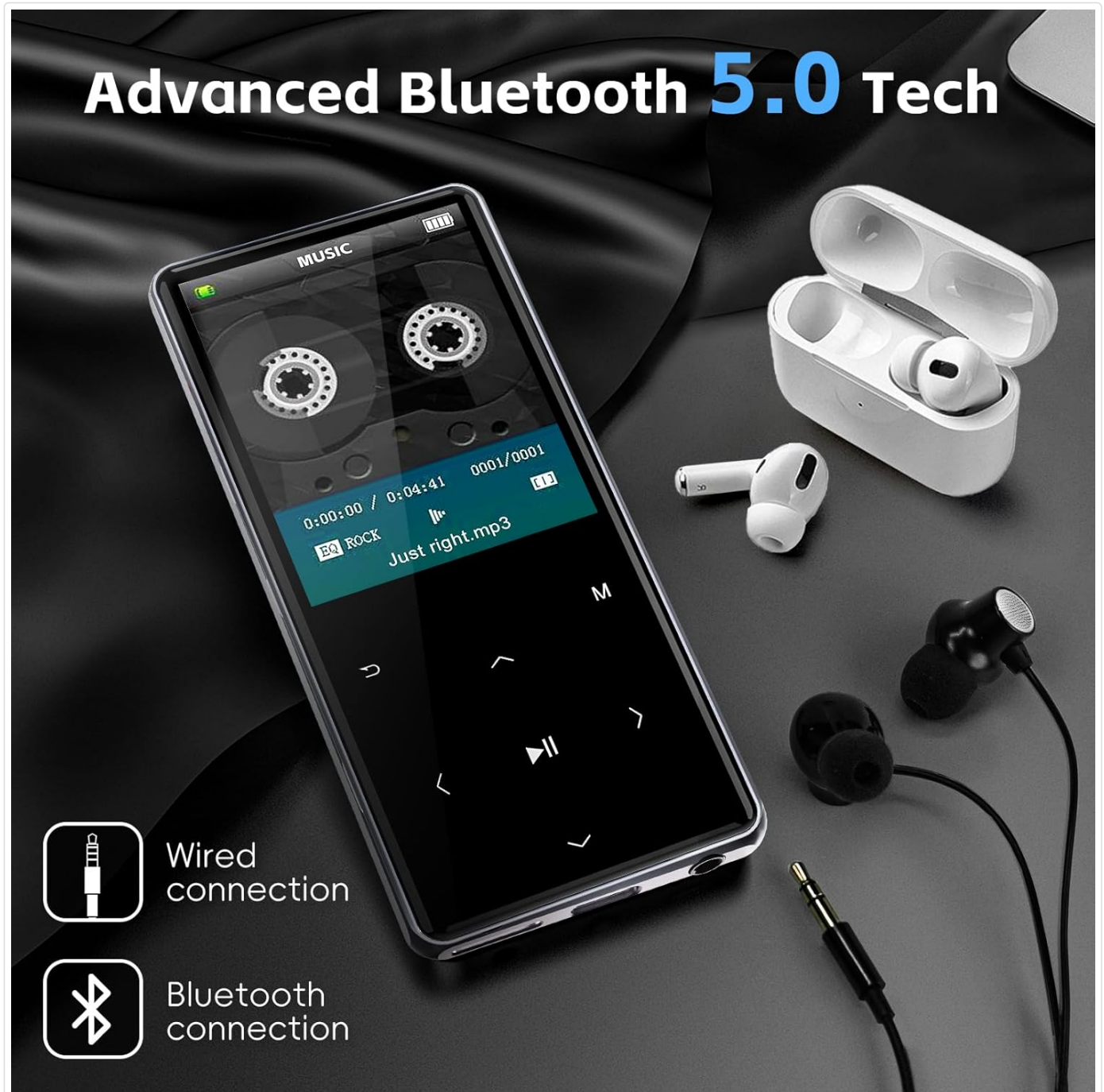
Image: The HIFI WALKER M7 MP3 player displaying music playback, with both wired earphones and wireless earbuds shown, emphasizing its advanced Bluetooth 5.0 technology for both wired and wireless connections.

The player features Bluetooth 5.0 for stable and compatible connections.