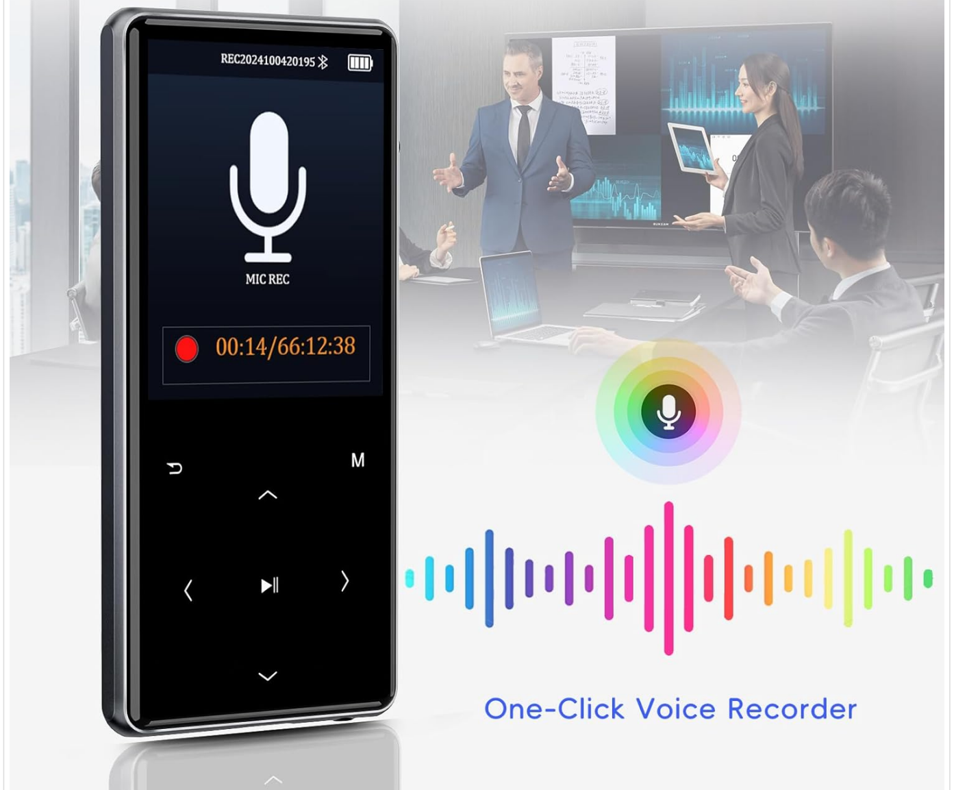
Image: The HIFI WALKER M7 MP3 player displaying its recording interface, with a microphone icon and recording timer, illustrating its one-touch recording capability.

Helps you quickly record important meeting and study information.