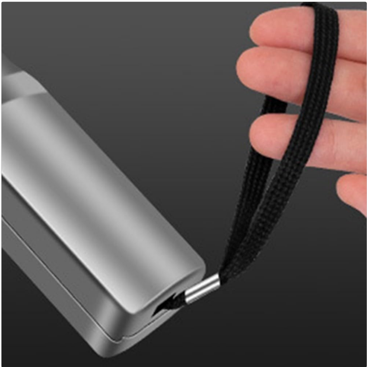
Figure 4: Detail of the wrist strap attachment point for secure handling.