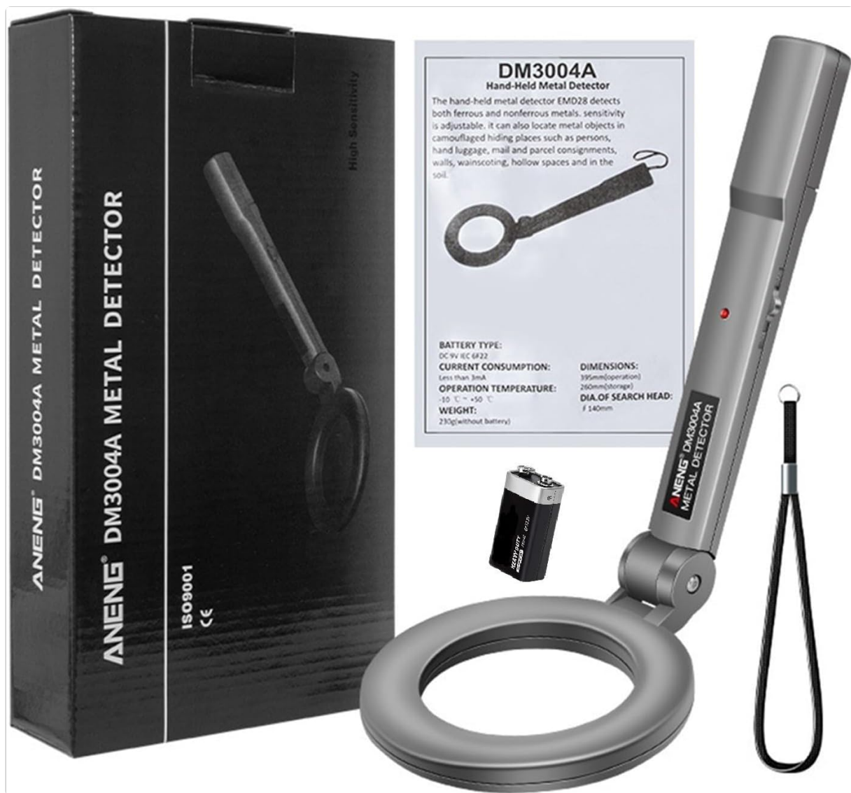
Figure 5: Demonstrating the use of the metal detector for scanning.