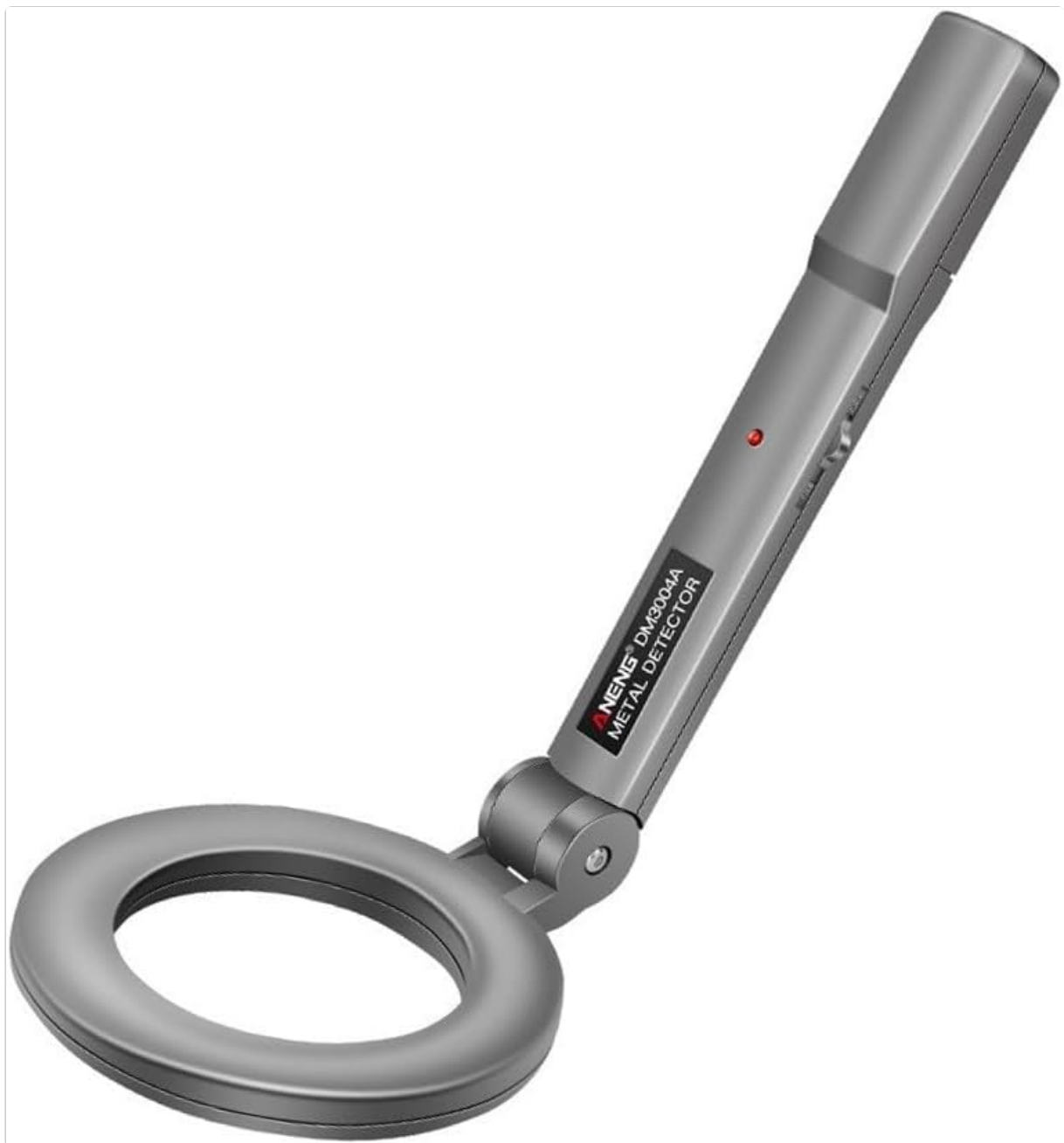
Figure 3: The metal detector, its packaging, and the 9V battery required for operation.