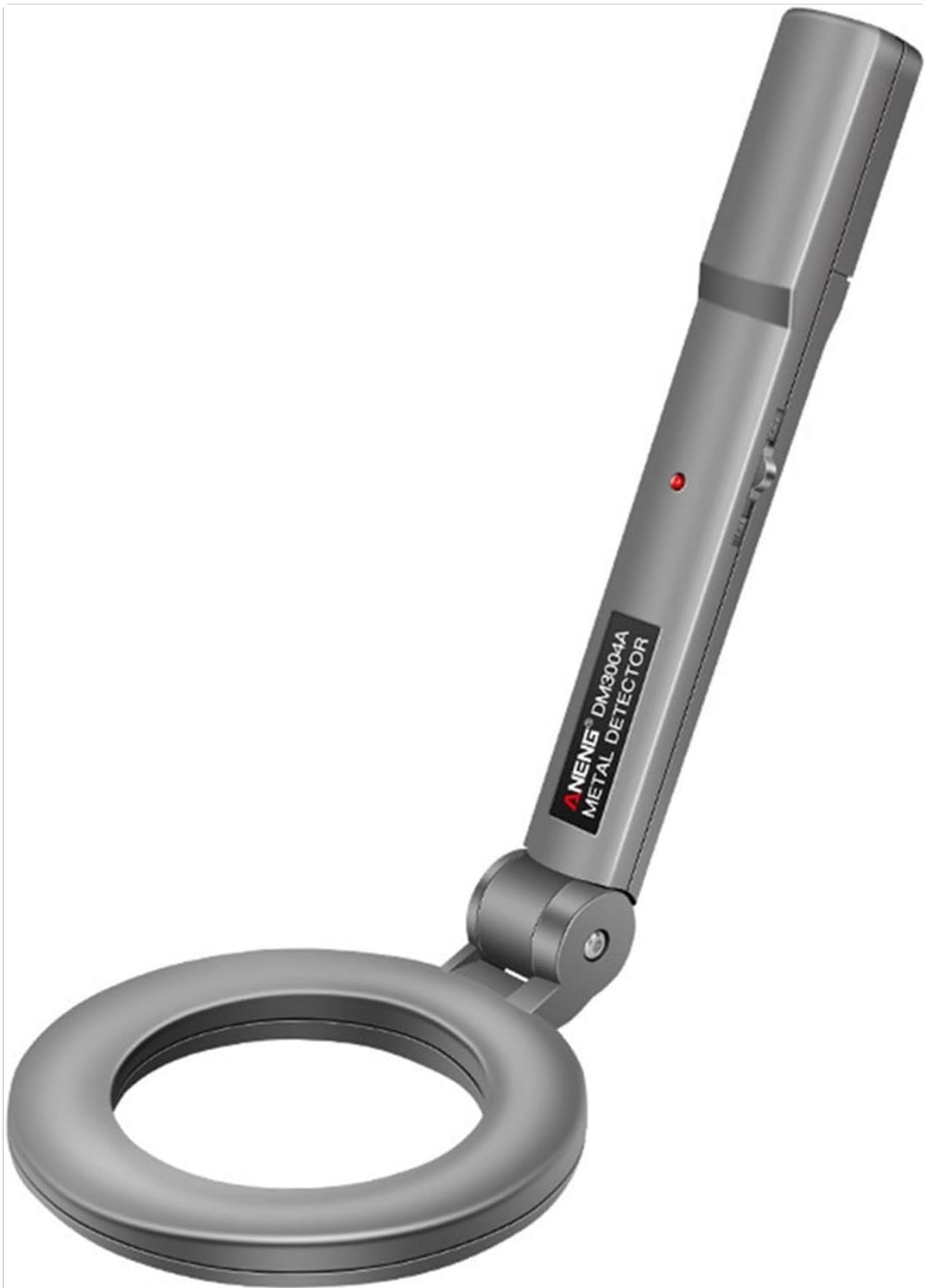
Figure 1: The ANENG DM3004A Metal Detector in its compact, folded state.