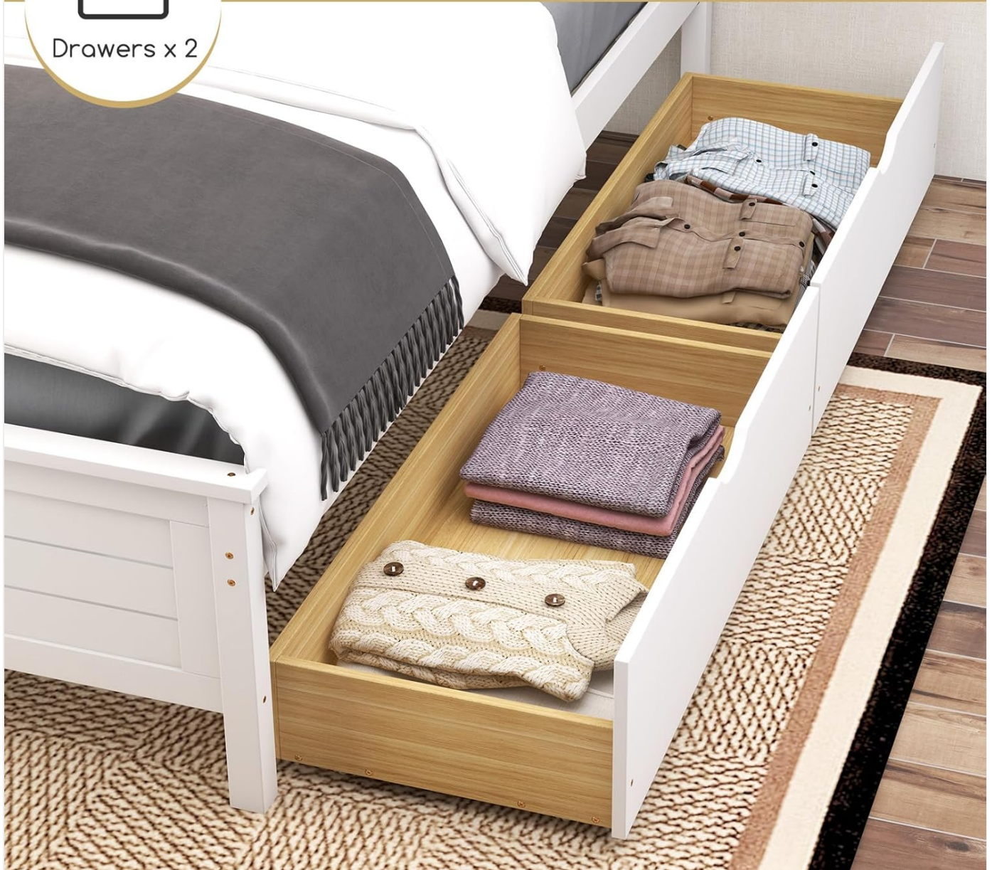
Image: A view of the two large storage drawers positioned under the bed frame, shown partially open and filled with folded clothing, demonstrating their storage capacity.