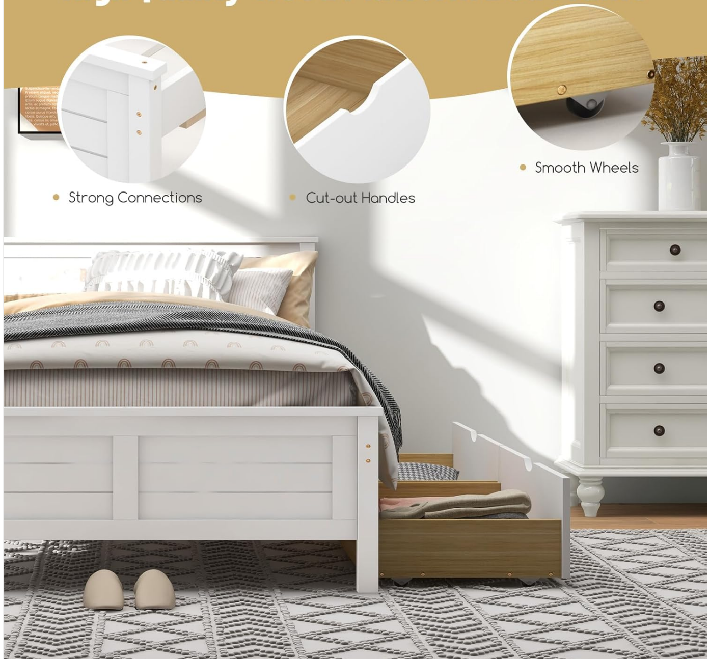
Image: Detailed view of the bed frame's features, including strong connections at the corners, the design of the cut-out handles on the storage drawers, and the smooth wheels on the bottom of the drawers.