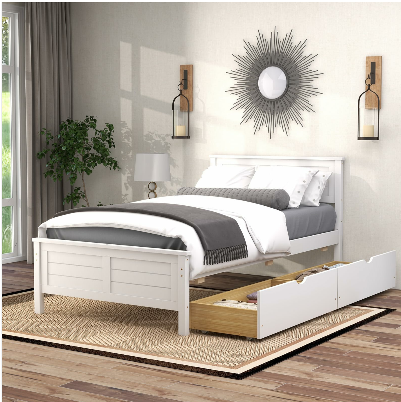
Image: The GOFLAME Twin Size Bed Frame in white, featuring a slatted headboard and footboard, with two storage drawers visible along one side. A mattress with light pink bedding is on the frame.