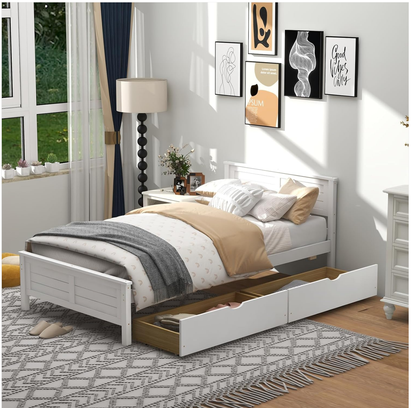
Image: The white twin bed frame with both under-bed storage drawers fully extended, showcasing their accessibility and the space available for storage.