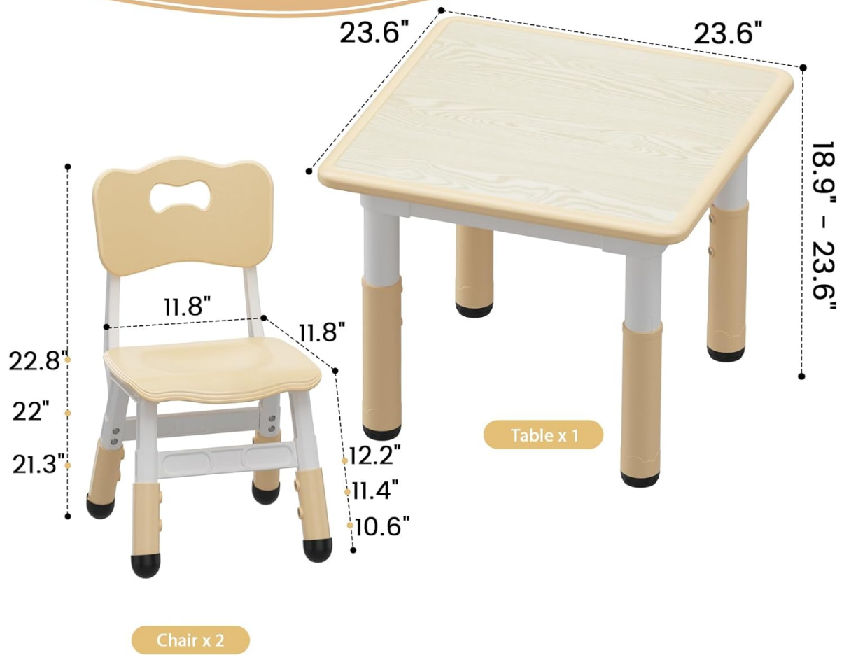
Image: A diagram illustrating the 7 height levels for the table and 3 height levels for the chairs, with corresponding age recommendations.