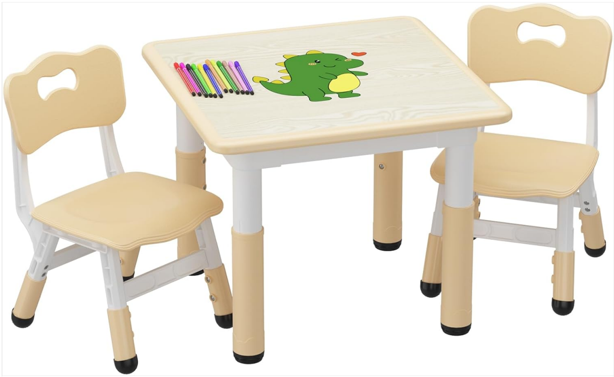
Image: The complete GAOMON Kids Table and 2 Chairs Set, showcasing the table with a dinosaur drawing and two chairs.