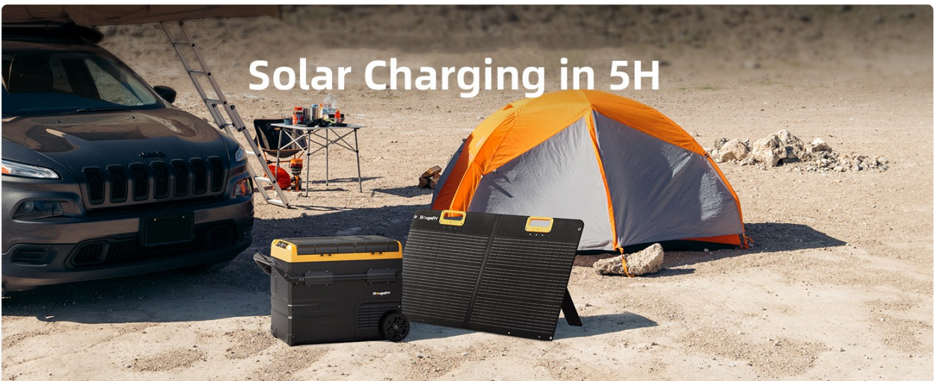
Figure 3.5: Extended run time provided by the 173Wh detachable battery.