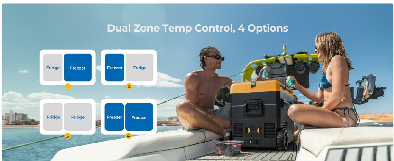
Figure 3.2: Demonstrating the versatility of dual zone temperature control in an outdoor setting.