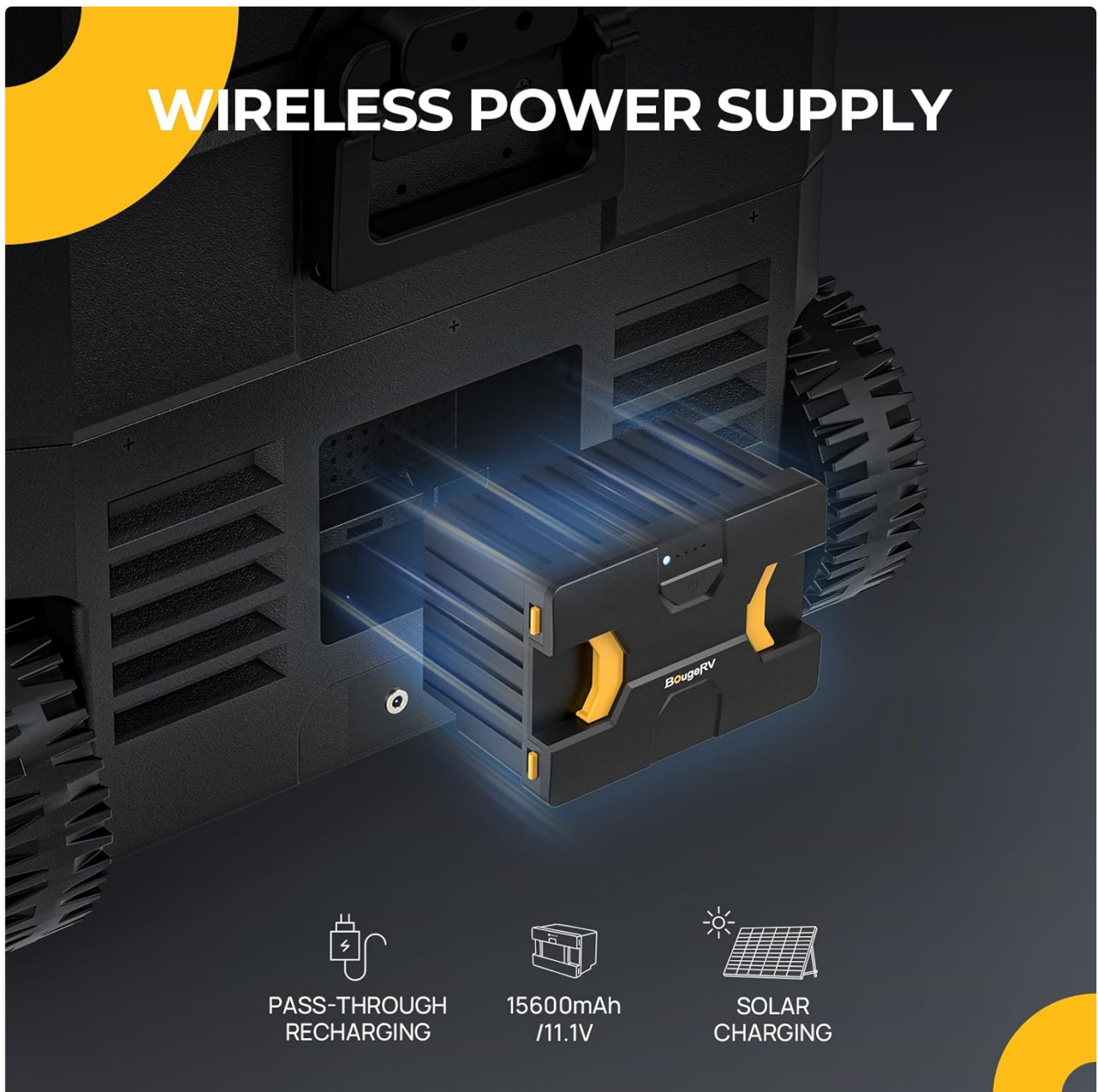
Figure 2.3: The wireless power supply system, highlighting pass-through recharging and solar charging compatibility.

Your browser does not support the video tag.