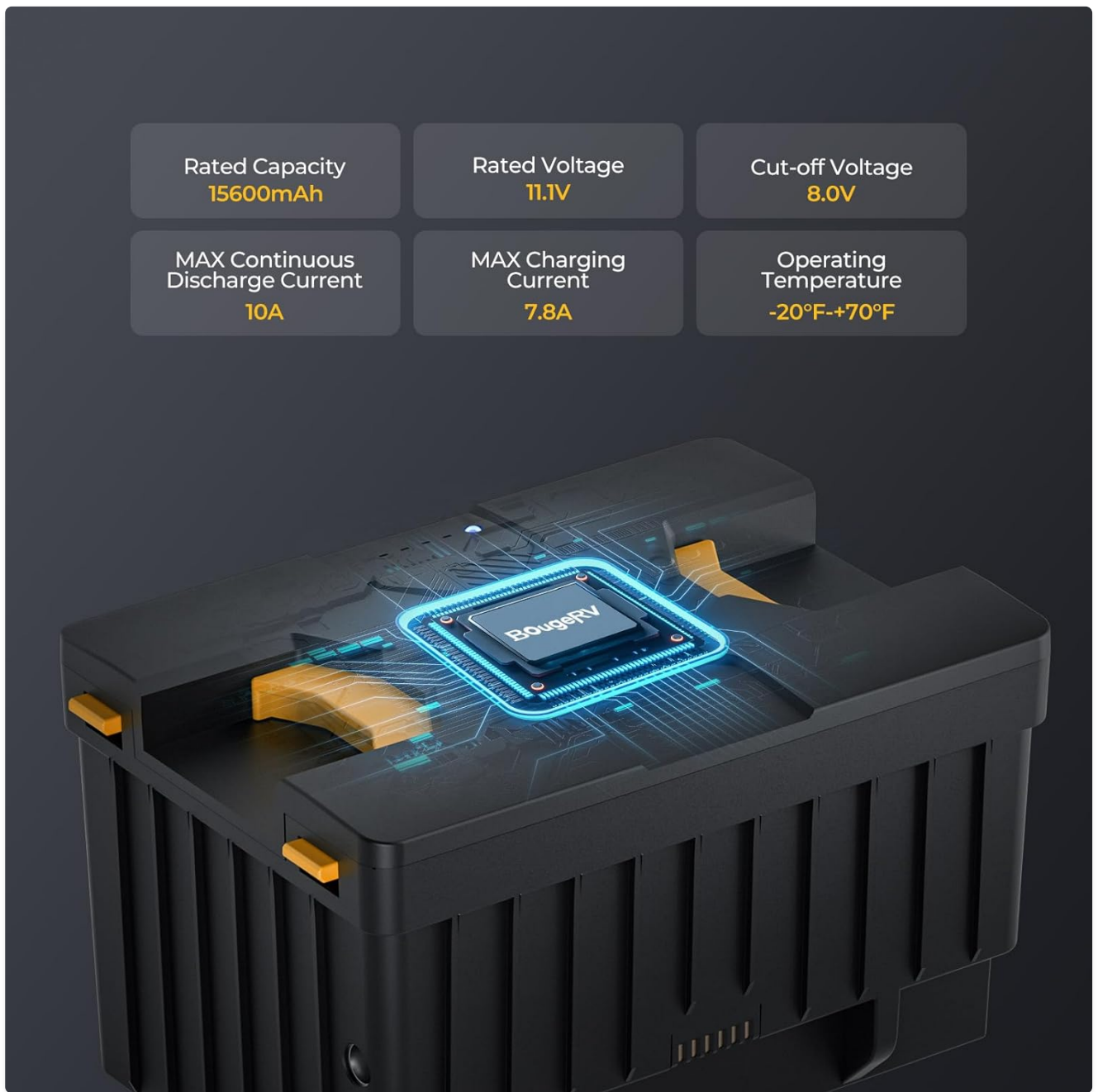
Figure 3.7: Technical specifications of the 15600mAh detachable battery.