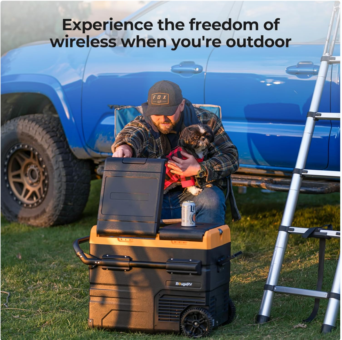
Figure 3.8: Enjoying wireless freedom with the portable refrigerator in an outdoor environment.

Experience the freedom of wireless when you're outdoor