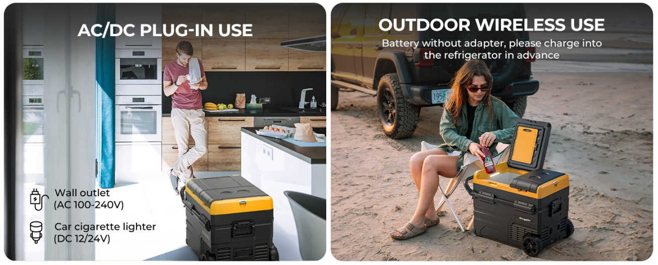
Figure 2.2: Powering options for the refrigerator, including AC/DC and wireless battery use.

The portable power station is specifically designed for BougeRV CRD35, CRD45, CRD55, ED35, ED45, and ED55 models. It offers convenience for outdoor use without the need for an AC adapter, DC cord, or a bulky external energy storage battery.