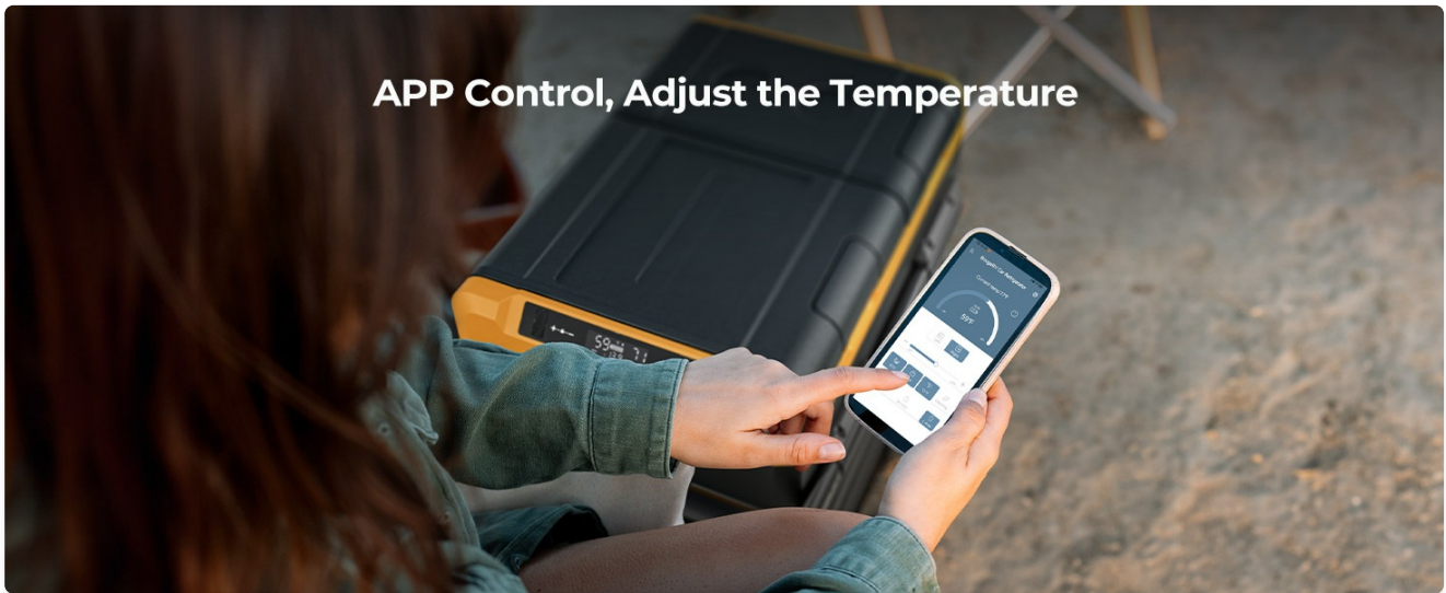
Figure 3.4: Adjusting the temperature settings using the dedicated mobile application.