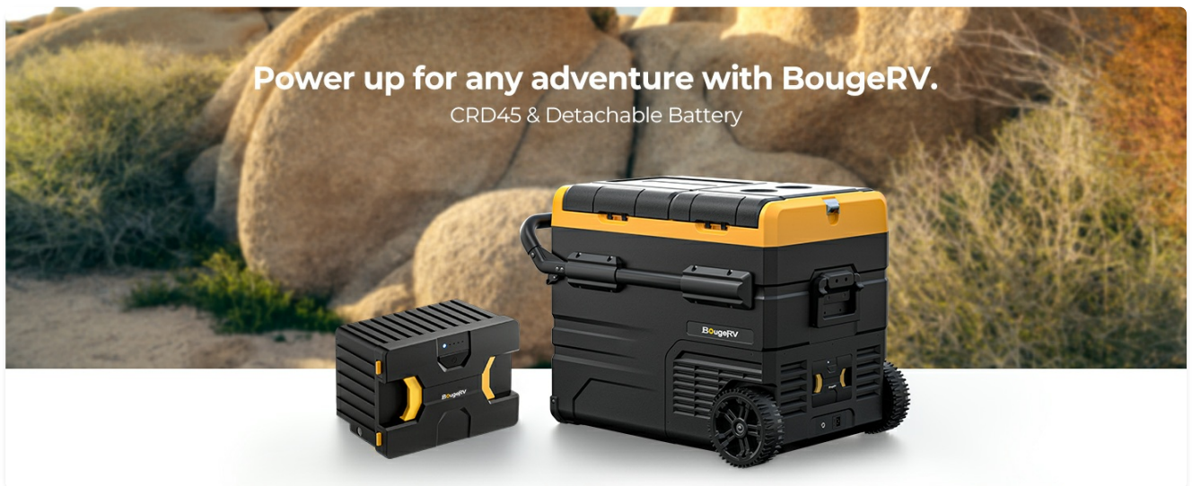
Figure 1.2: The CRD45 refrigerator and detachable battery, ready for outdoor adventures.