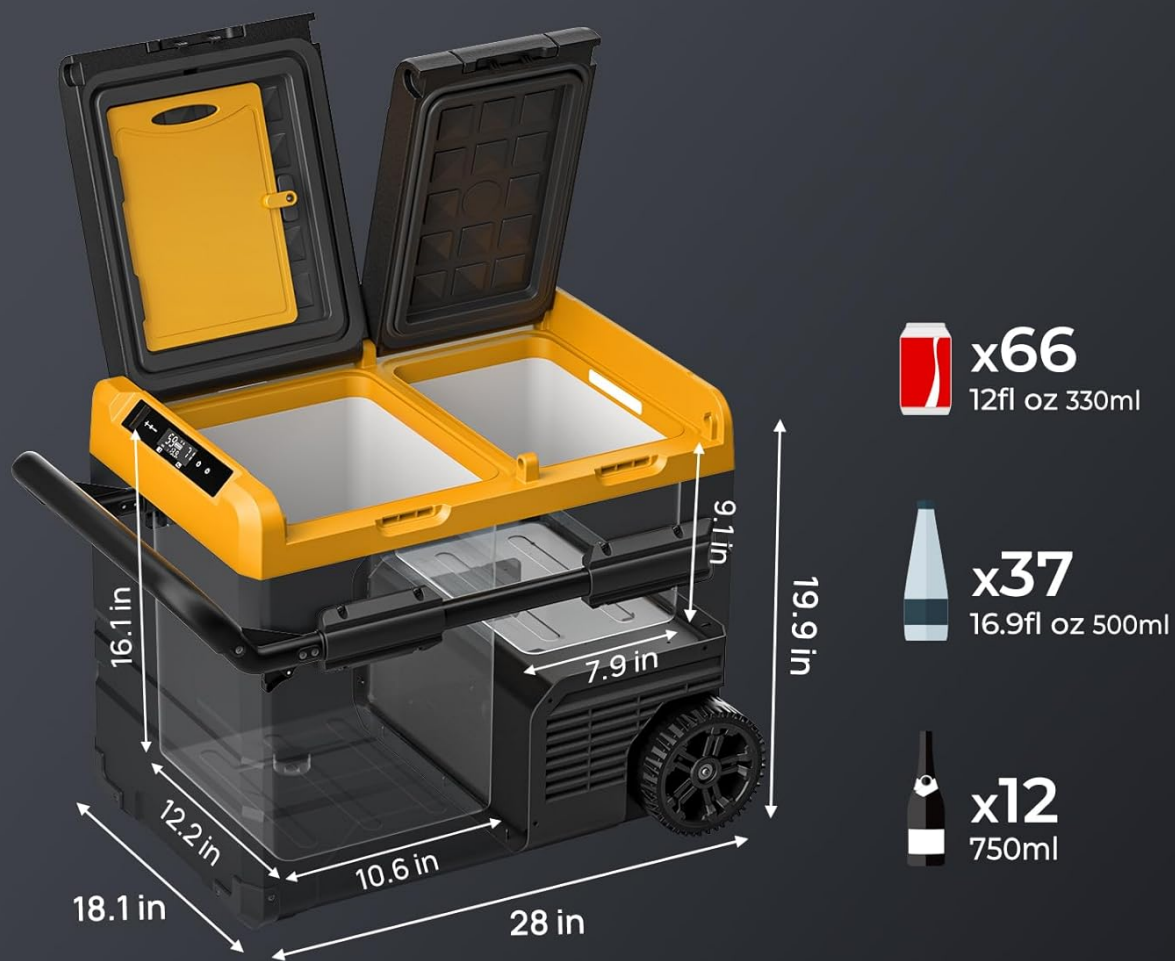
Figure 6.1: Dimensions and capacity details of the 48 Quart refrigerator.