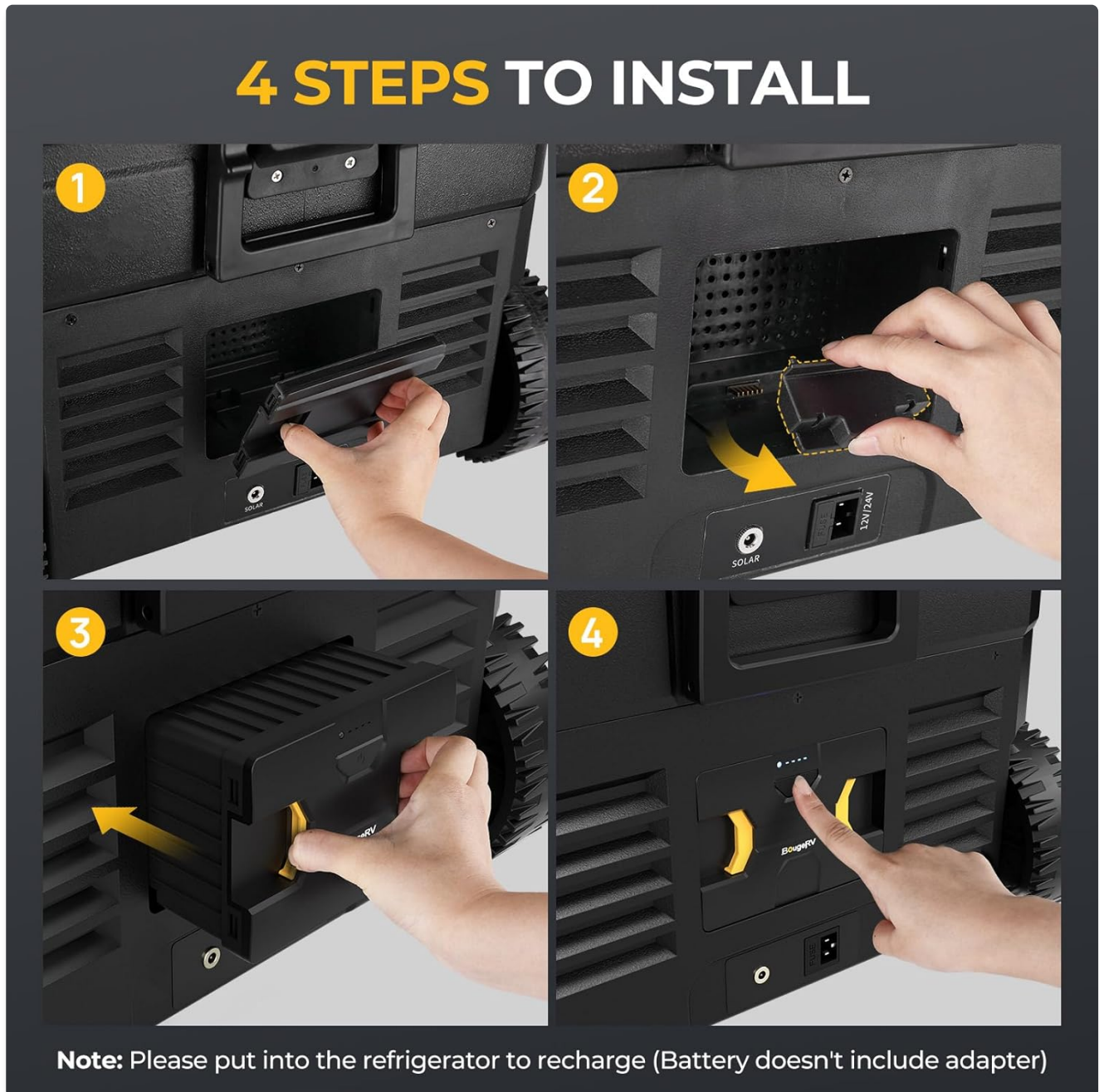
Figure 2.1: Step-by-step guide for installing the detachable battery.