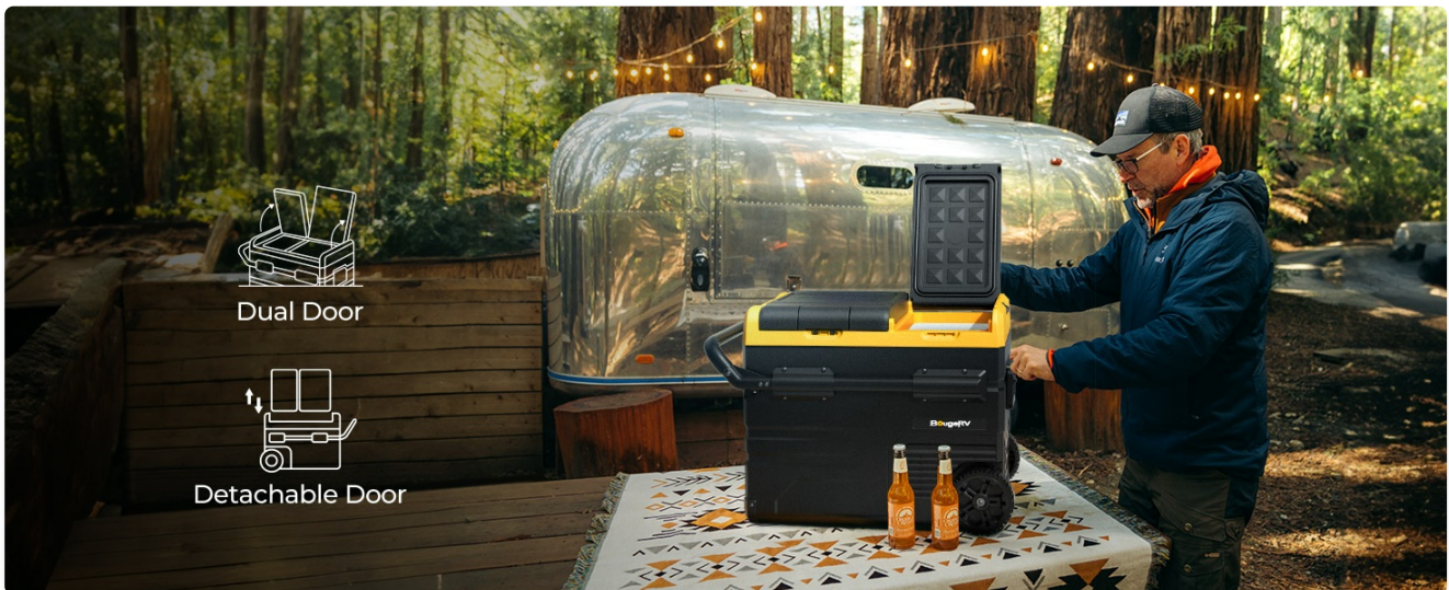
Figure 4.1: The dual door and detachable door design for flexible access.

The door of the CRD45 can be removed and re-attached to change the opening direction, adapting to your specific needs, scenario, or habit. This feature enhances convenience when accessing food and drinks, especially in confined spaces.