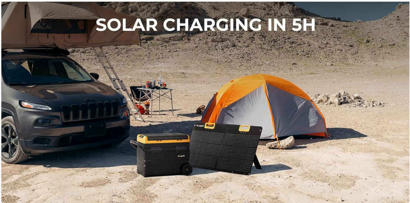
Figure 3.3: Controlling the refrigerator via the mobile application, with solar charging capability.