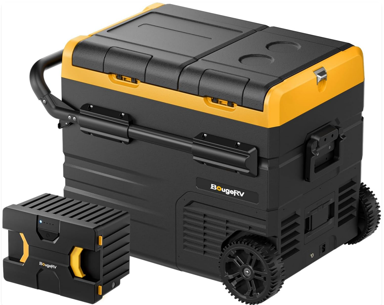
Figure 1.1: The BougeRV CRD45 48 Quart Dual Zone Car Refrigerator and its detachable battery.