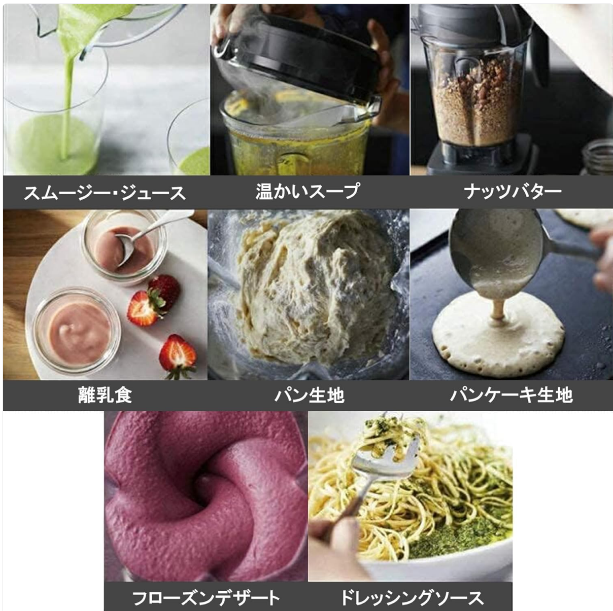
Image: A collection of dishes and ingredients prepared using the Vitamix V1200i, including smoothies, soups, nut butter, and dough.