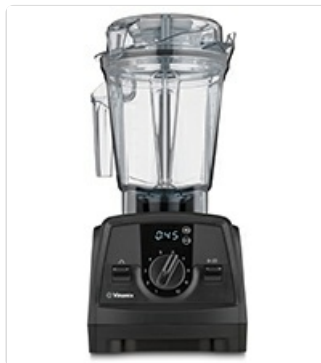
Image: The Vitamix V1200i blender with various fruits and vegetables loaded into its container, ready for blending.