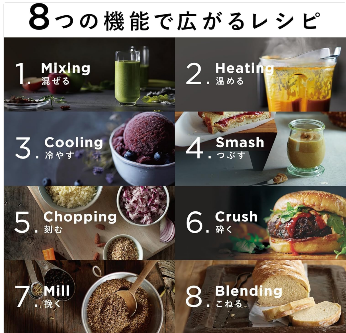
Image: A visual representation of the Vitamix V1200i's eight core functions, demonstrating its versatility in preparing various food items.