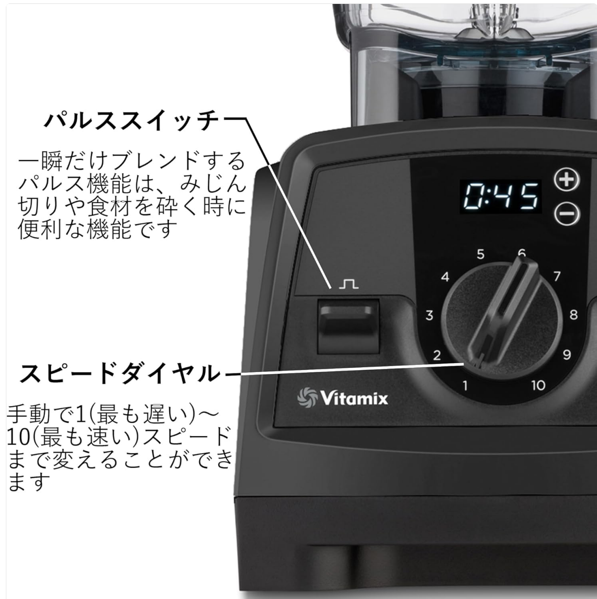
Image: A detailed view of the Vitamix V1200i's control panel, featuring the speed dial, pulse switch, and digital timer display.