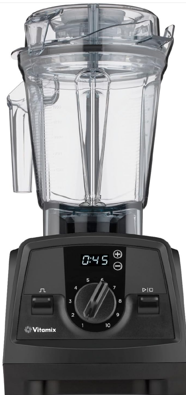
Image: The Vitamix V1200i blender shown alongside a recipe book, highlighting its sleek design and included culinary resources.