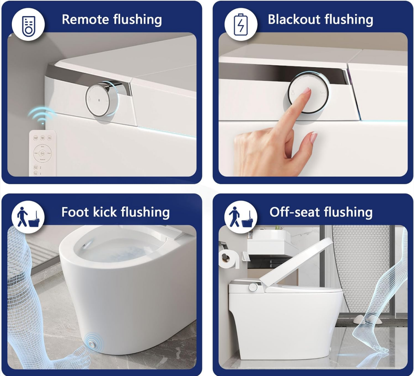
Image 5.1: Visual representation of the multiple flushing options.