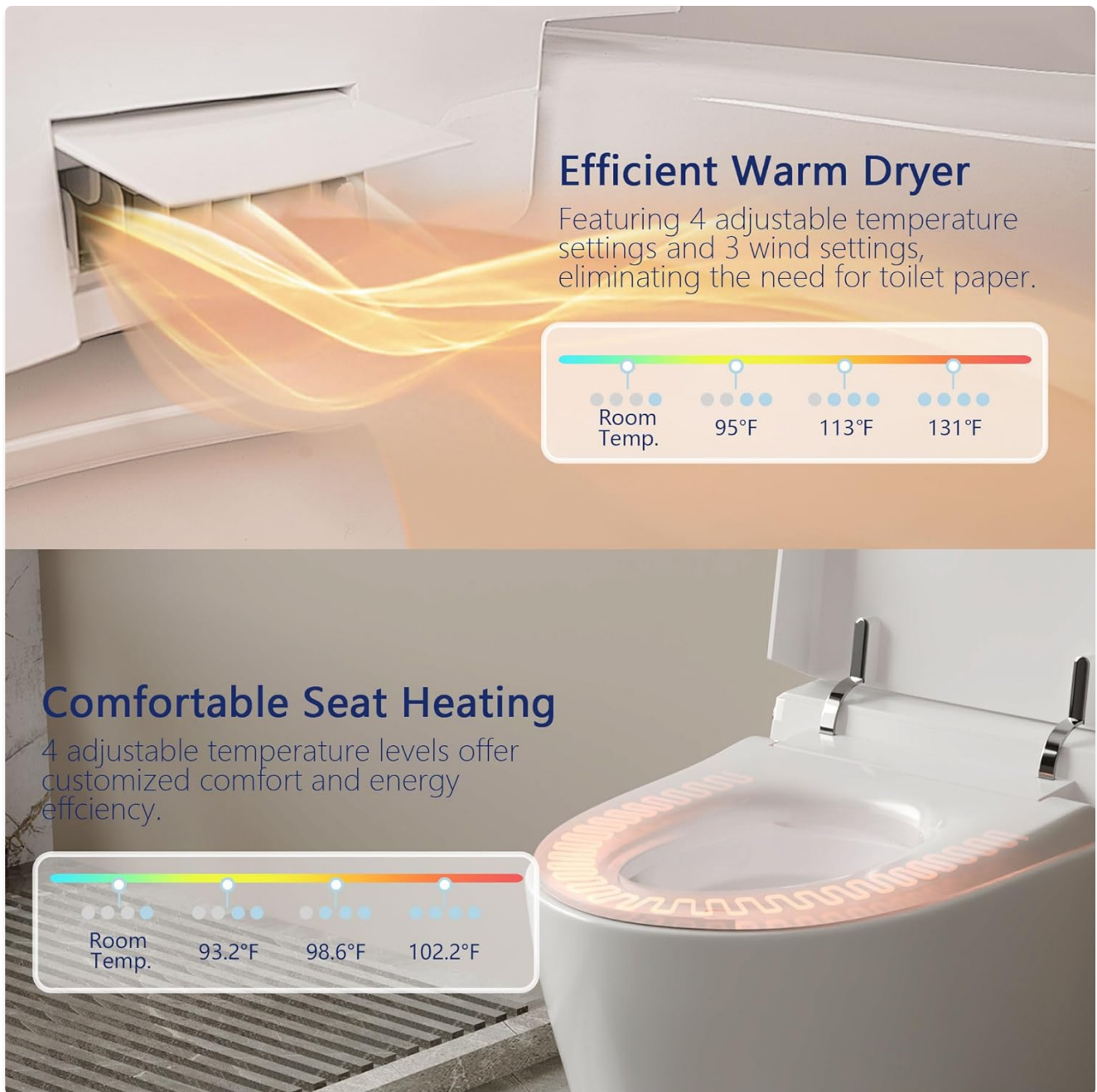
Image 5.4: Details of the efficient warm dryer and comfortable seat heating.