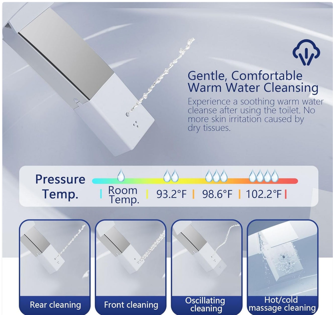
Image 5.3: Illustration of warm water cleansing and various cleaning modes.