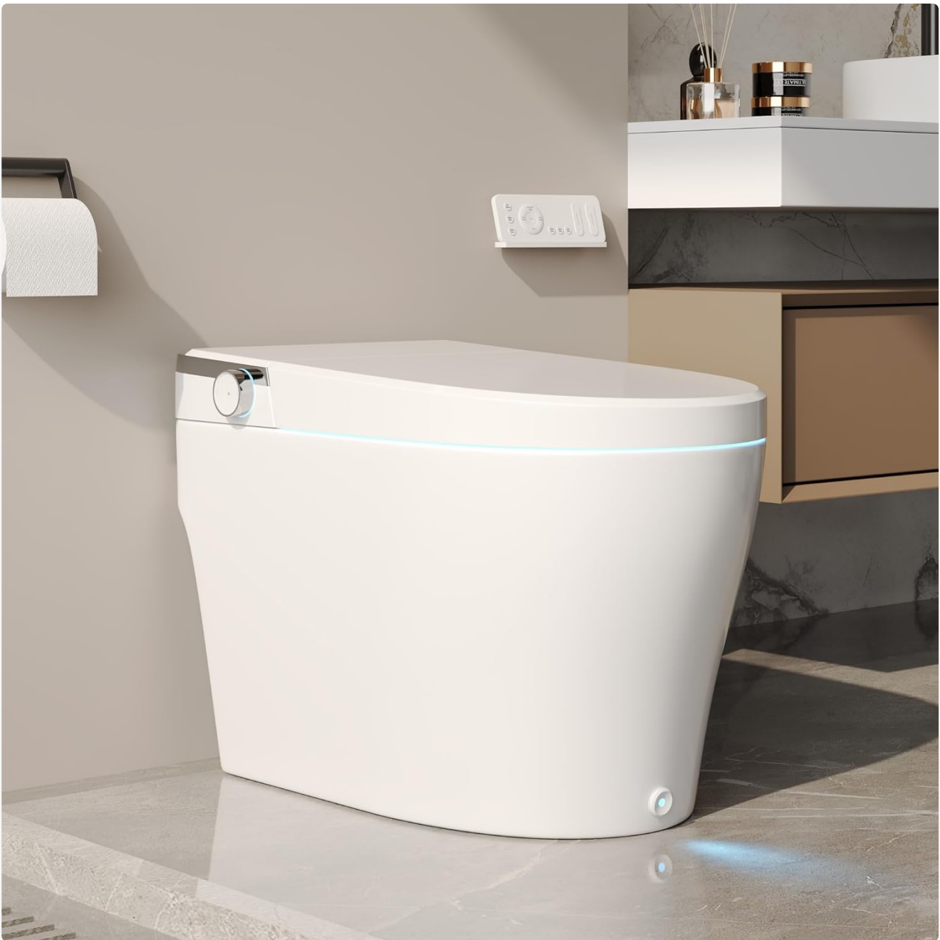
Image 1.1: The DeerValley Smart Toilet (Model 1S0029Plus) in a bathroom environment.