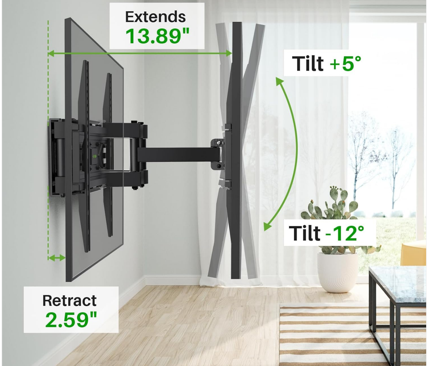
Figure 7: Reduce glare and reflection with the mount's tilt function, offering adjustments from +5° to -12°. The mount also extends up to 13.89 inches and retracts to 2.59 inches.