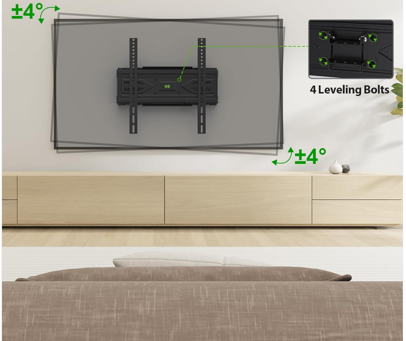
Figure 3: The wall plate features leveling bolts for fine-tuning the horizontal alignment of the TV after installation, allowing for a \pm 4^\circ adjustment.