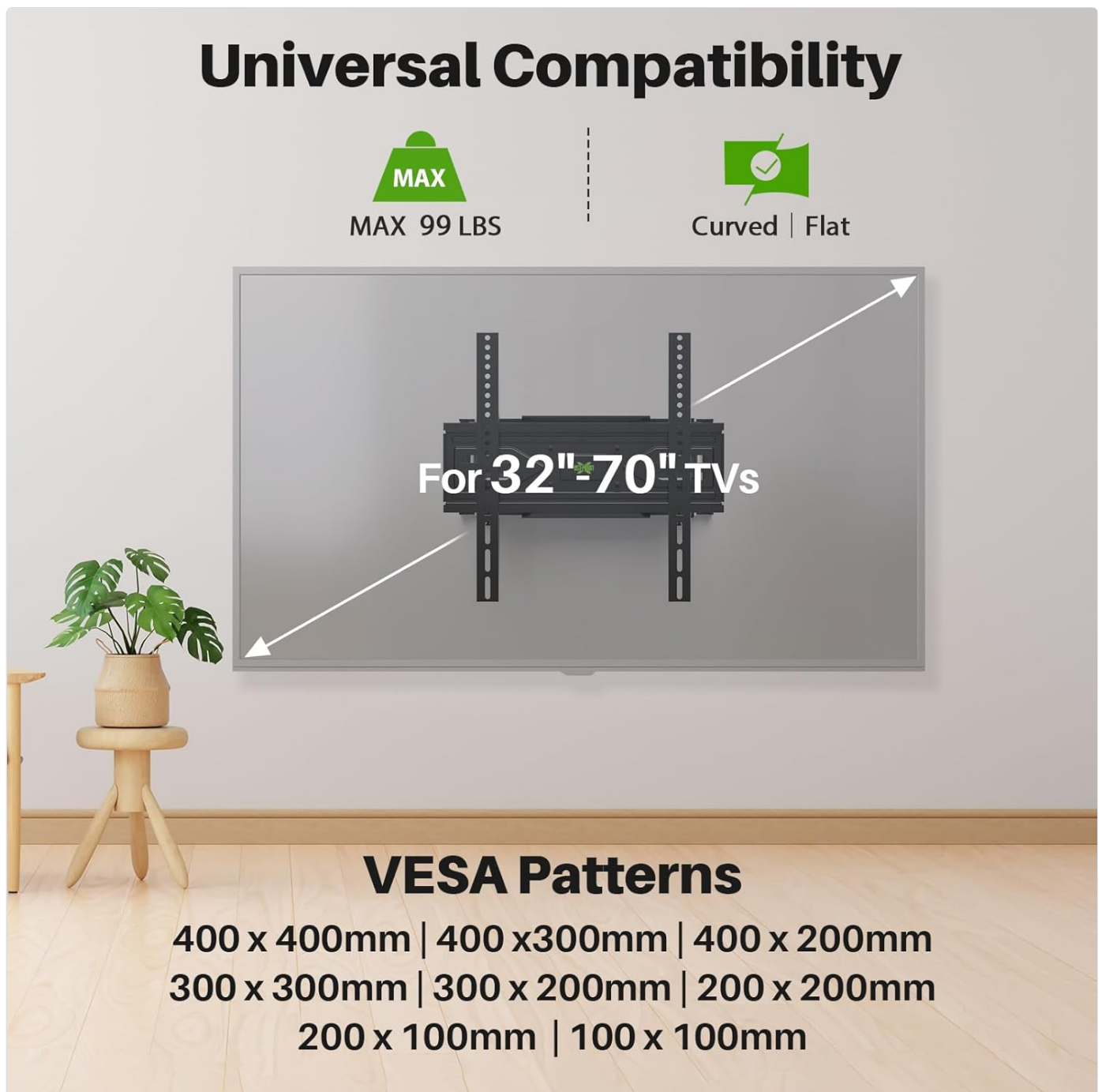
Figure 5: The mount supports TVs from 32 to 70 inches with a maximum weight of 99 lbs, and is compatible with VESA patterns up to 400x400mm.

With assistance, carefully lift the TV with the attached brackets and hook them onto the wall plate. Ensure the brackets are properly seated on the wall plate. Secure the TV to the wall plate using the locking screws or mechanisms provided, typically located at the bottom of the TV brackets.