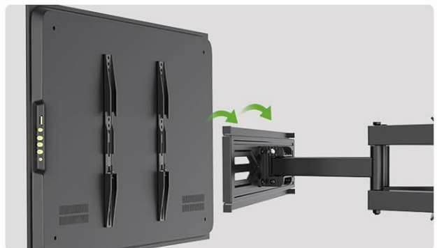
Figure 2: Visual representation of the easy 3-step installation process. Step 1 shows attaching the TV brackets to the back of the television.