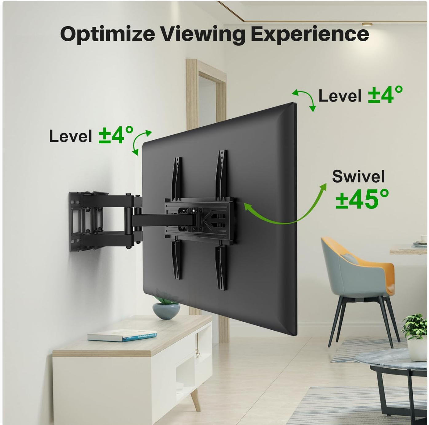
Figure 6: Optimize your viewing experience with the mount's swivel capability, allowing the TV to turn up to \pm 45^\circ for flexible positioning.