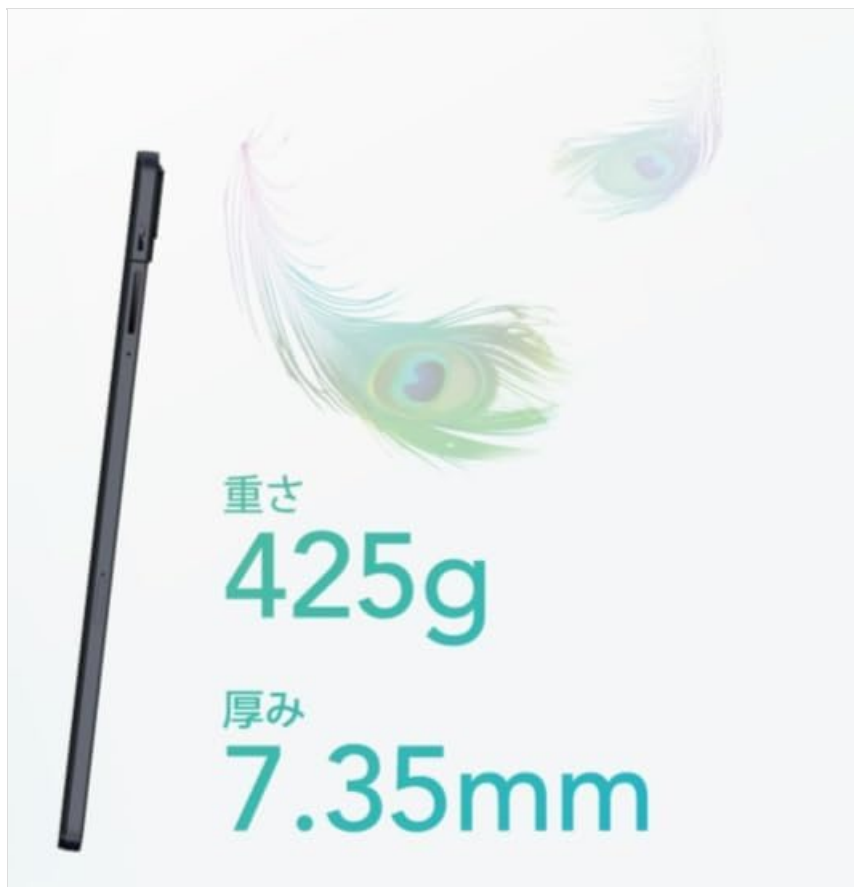
Figure 2.3: Side profile of the TCL TAB 10 Gen2 tablet, illustrating its slim design (7.35mm thickness) and light weight (425g).