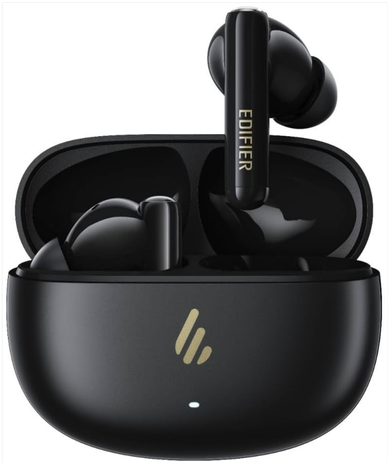
Image: Edifier X5 Pro earbuds inside their charging case, with the lid open.