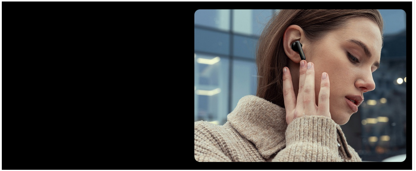
Image: A person smiling and talking on a phone call while wearing Edifier X5 Pro earbuds, emphasizing the clear call quality.