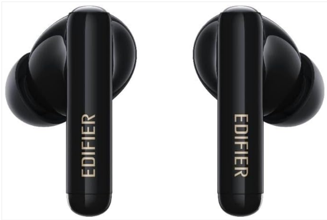
Image: Close-up view of the left and right Edifier X5 Pro earbuds, showing the "EDIFIER" branding on the stems.