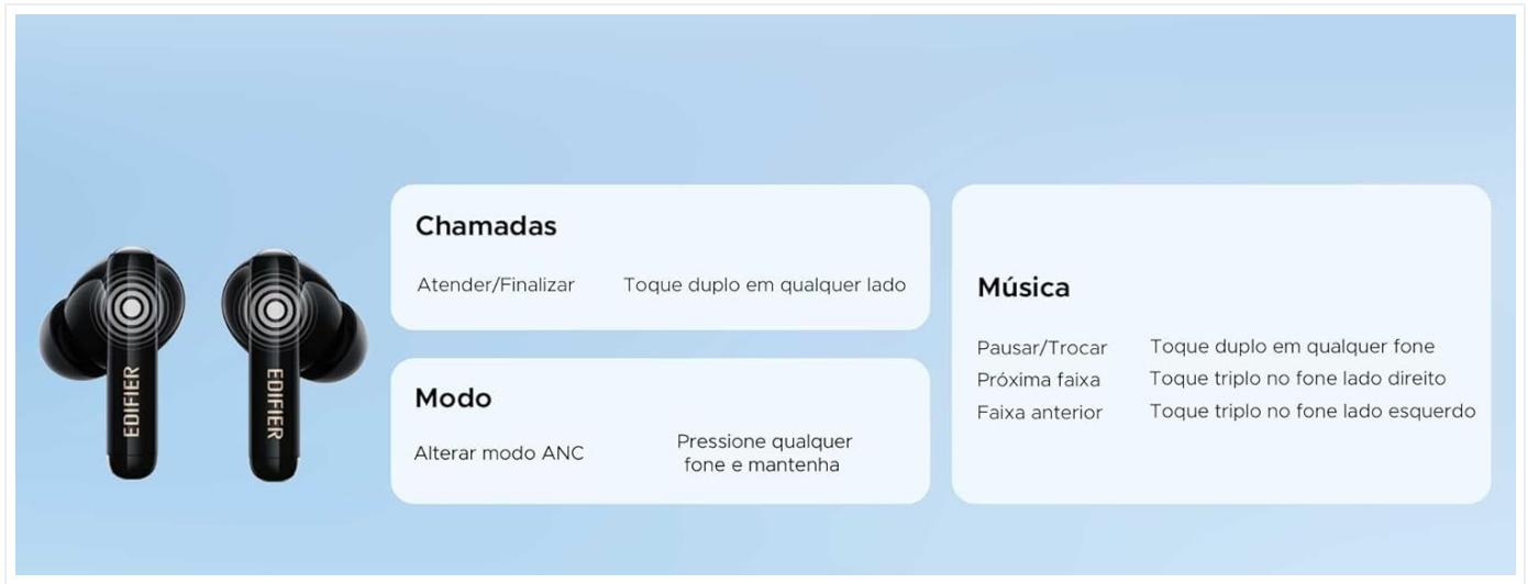
Image: Diagram illustrating the touch control areas on the Edifier X5 Pro earbuds and their corresponding functions for calls, music, and ANC mode.