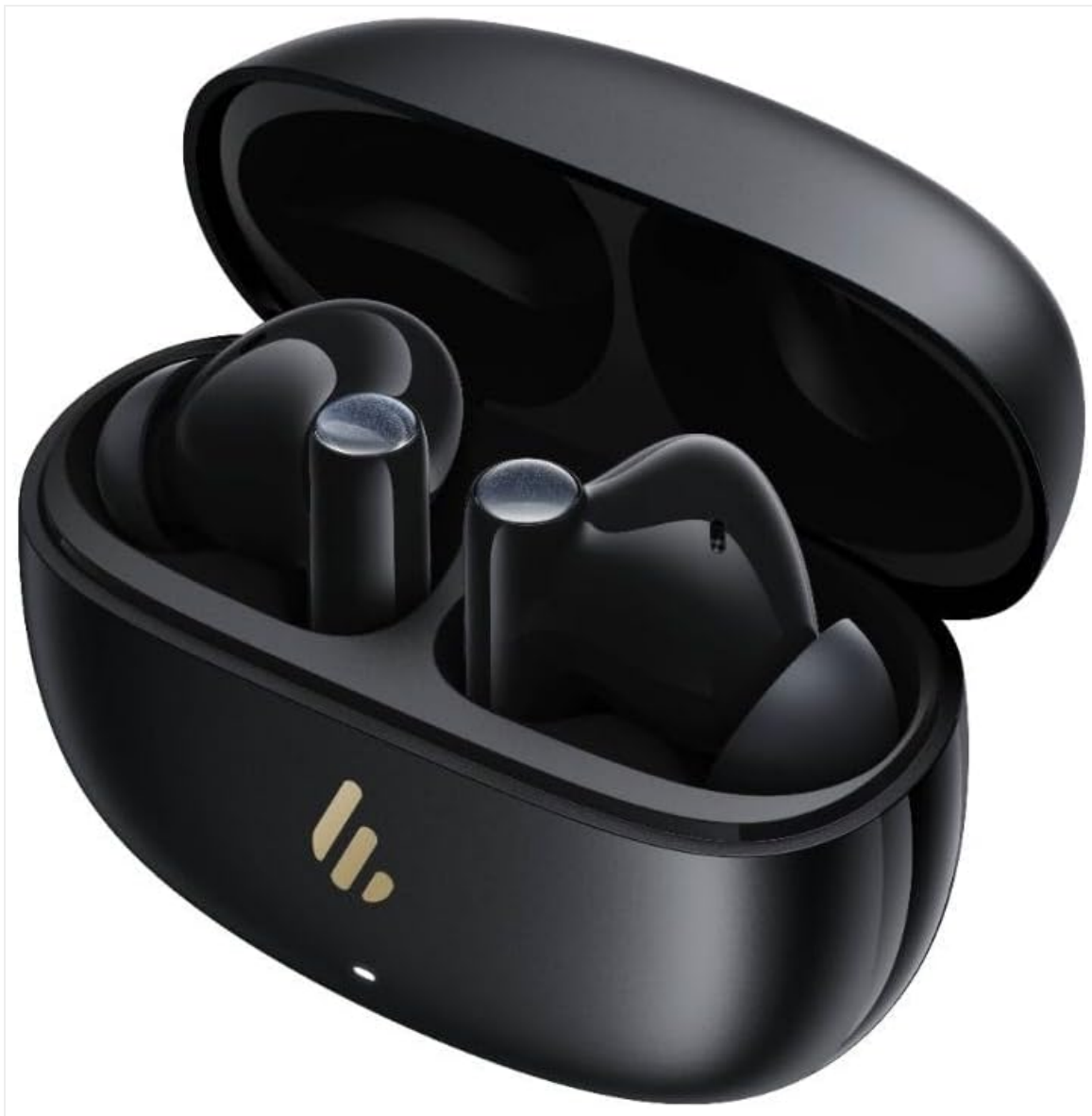
Image: The Edifier X5 Pro charging case with a USB-C cable connected to its charging port.