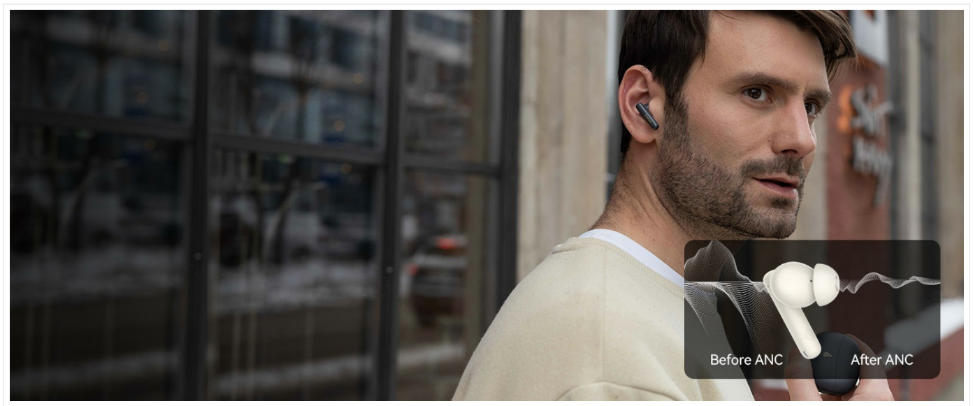
Image: A person wearing Edifier X5 Pro earbuds, with a visual representation of how Active Noise Cancellation reduces surrounding noise.

The hybrid ANC technology effectively reduces ambient noise, allowing for a more focused listening experience. You can switch between ANC, Ambient Sound, and Normal modes by pressing and holding either earbud.