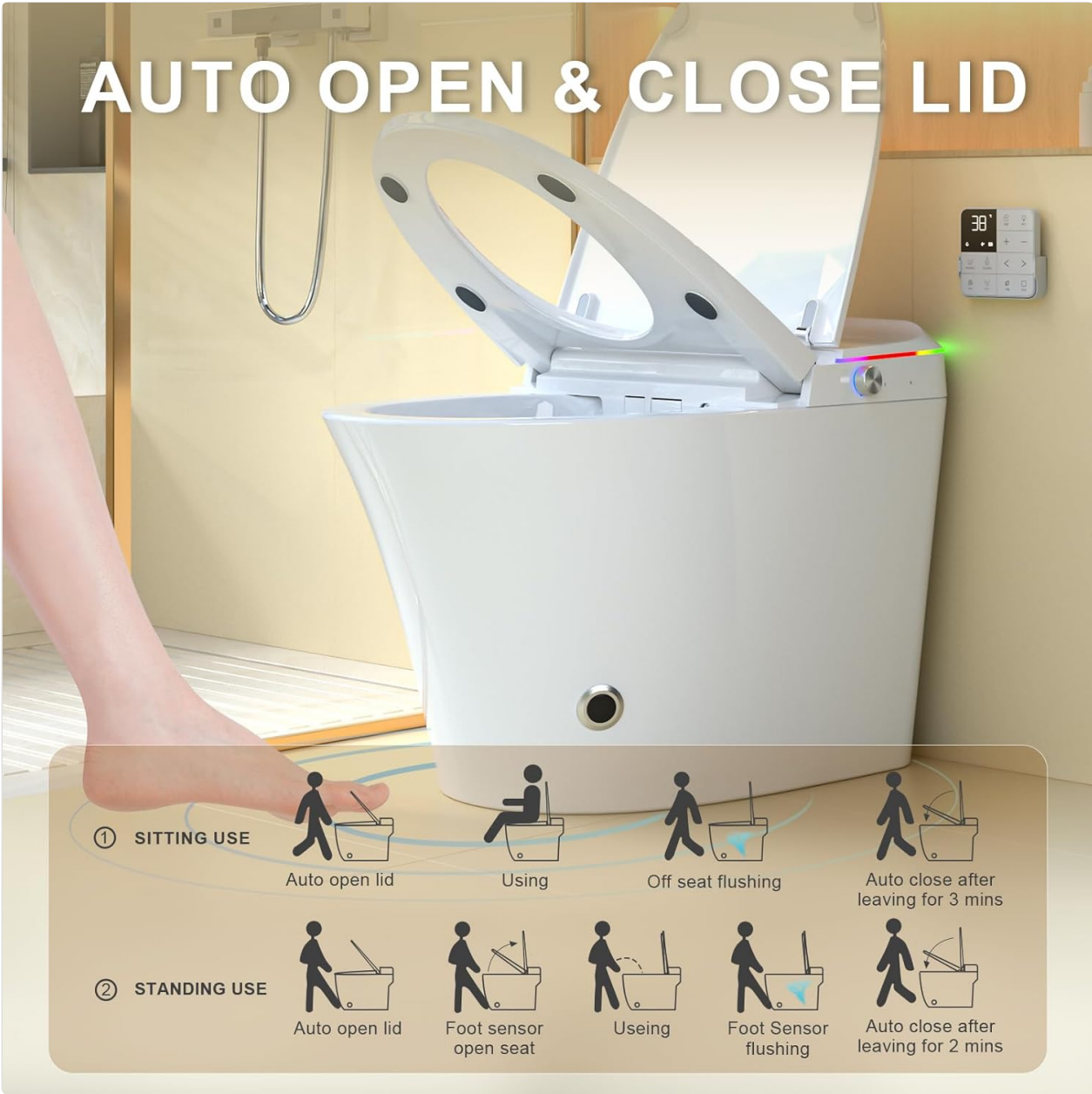
Figure 4: Automatic lid and seat operation with foot sensing.

The lid automatically opens when a person approaches and closes when they leave. A foot sensor can also be used to flip the seat and flush.