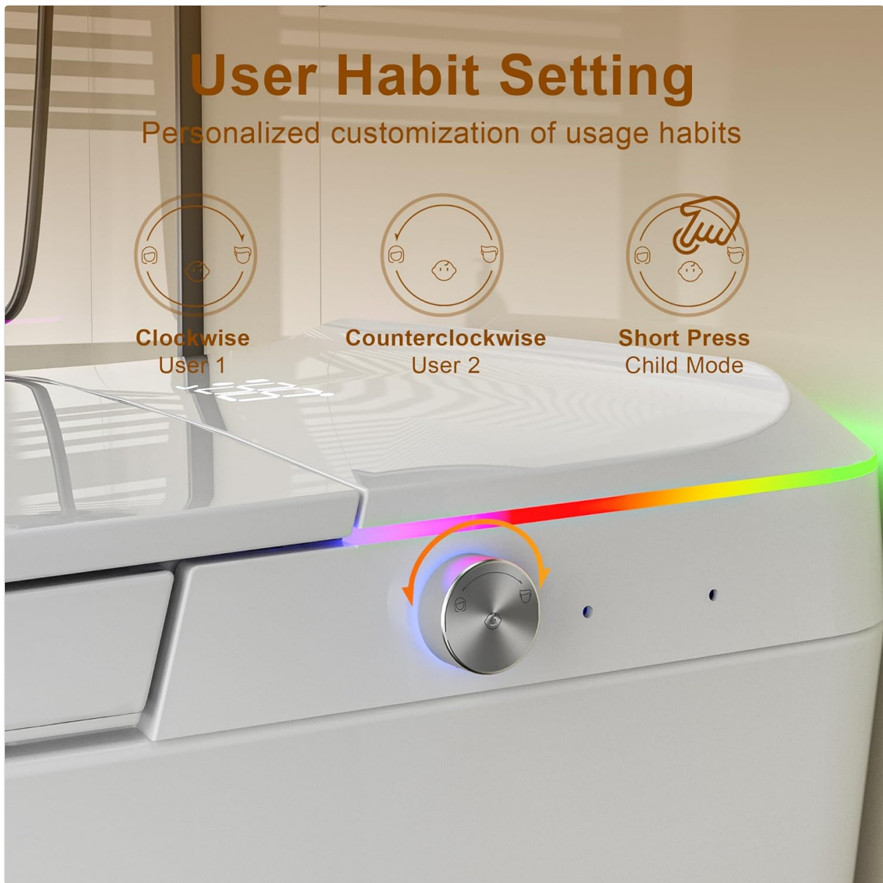
Figure 5: User habit settings via the one-touch knob.