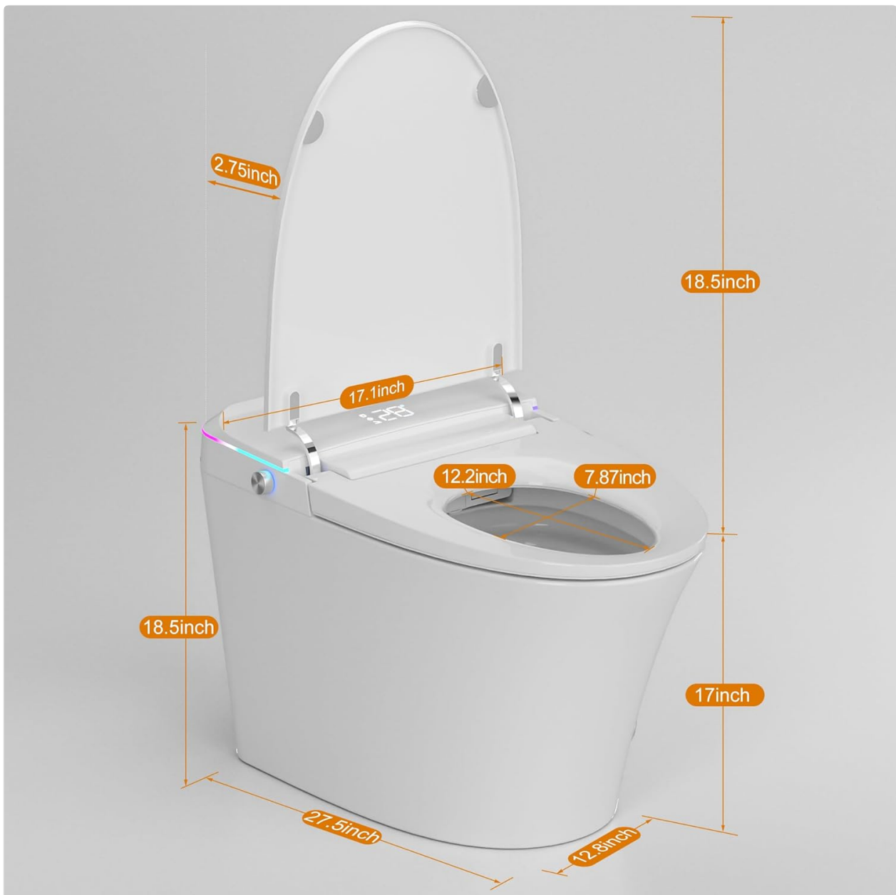
Figure 3: TEISVAY Smart Toilet dimensions.