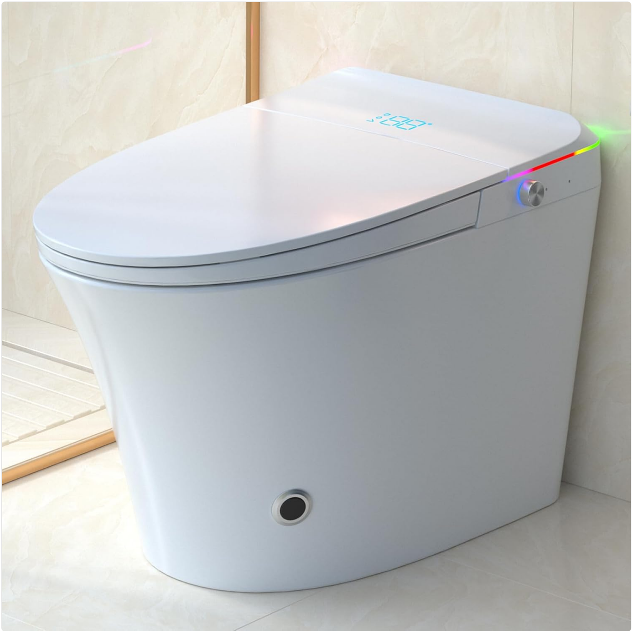
Figure 1: Front view of the TEISVAY Smart Toilet with Bidet.