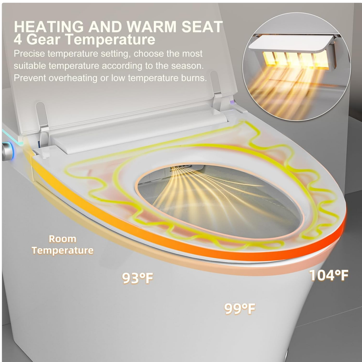
Figure 8: Heated seat temperature settings.