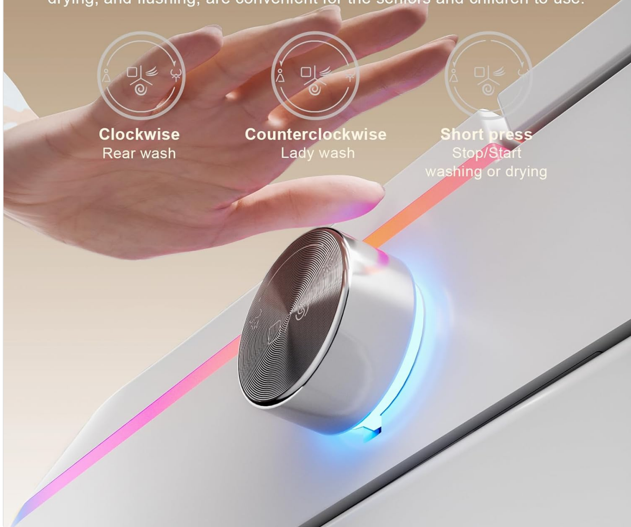
Figure 6: One-touch knob for washing and drying functions.

Rotating and pressing operations, including rear washing, front washing, drying, and flushing, are convenient for the seniors and children to use.