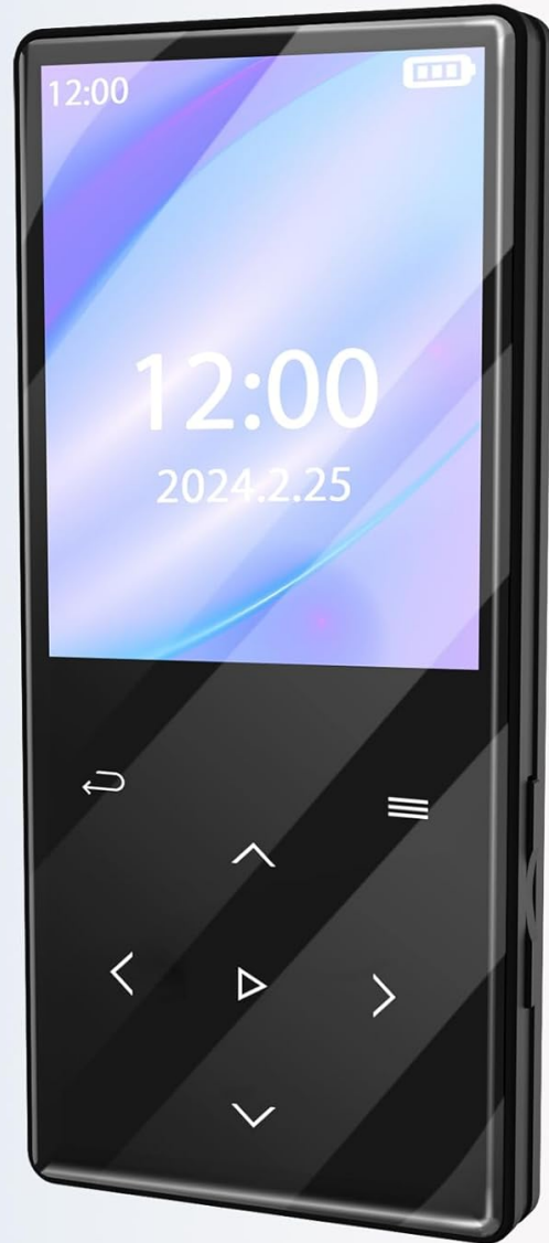
Image: The Gueray HJGP5MP3 MP3 Player alongside a summary of its key specifications: 2.4-inch large screen, 450mAh battery, 2 hours fast full charging, up to 40 hours music play time, and up to 6 hours video play time.