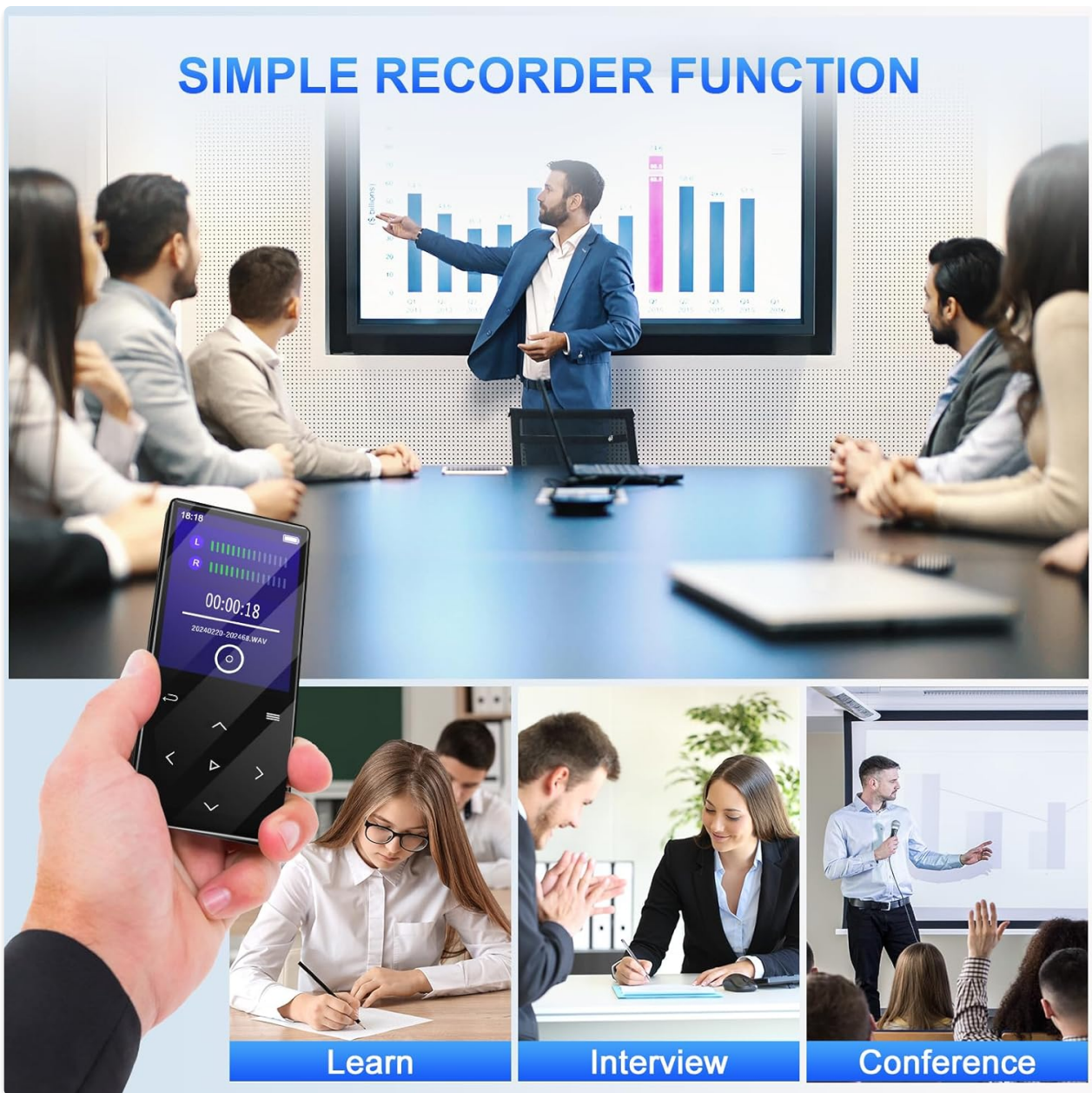
Image: The Gueray HJGP5MP3 MP3 Player displaying its recording interface, shown in contexts of learning, interviews, and conferences, highlighting its simple recorder function.