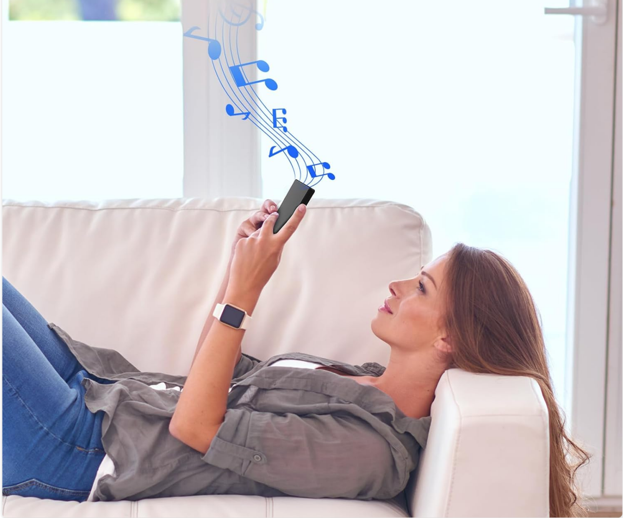
Image: A woman relaxing on a couch, listening to music from the Gueray HJGP5MP3 MP3 Player, illustrating the convenience of its built-in speakers.

Free your hands and relax your ears, say goodbye to wired headphones, enjoy your music more convenient.