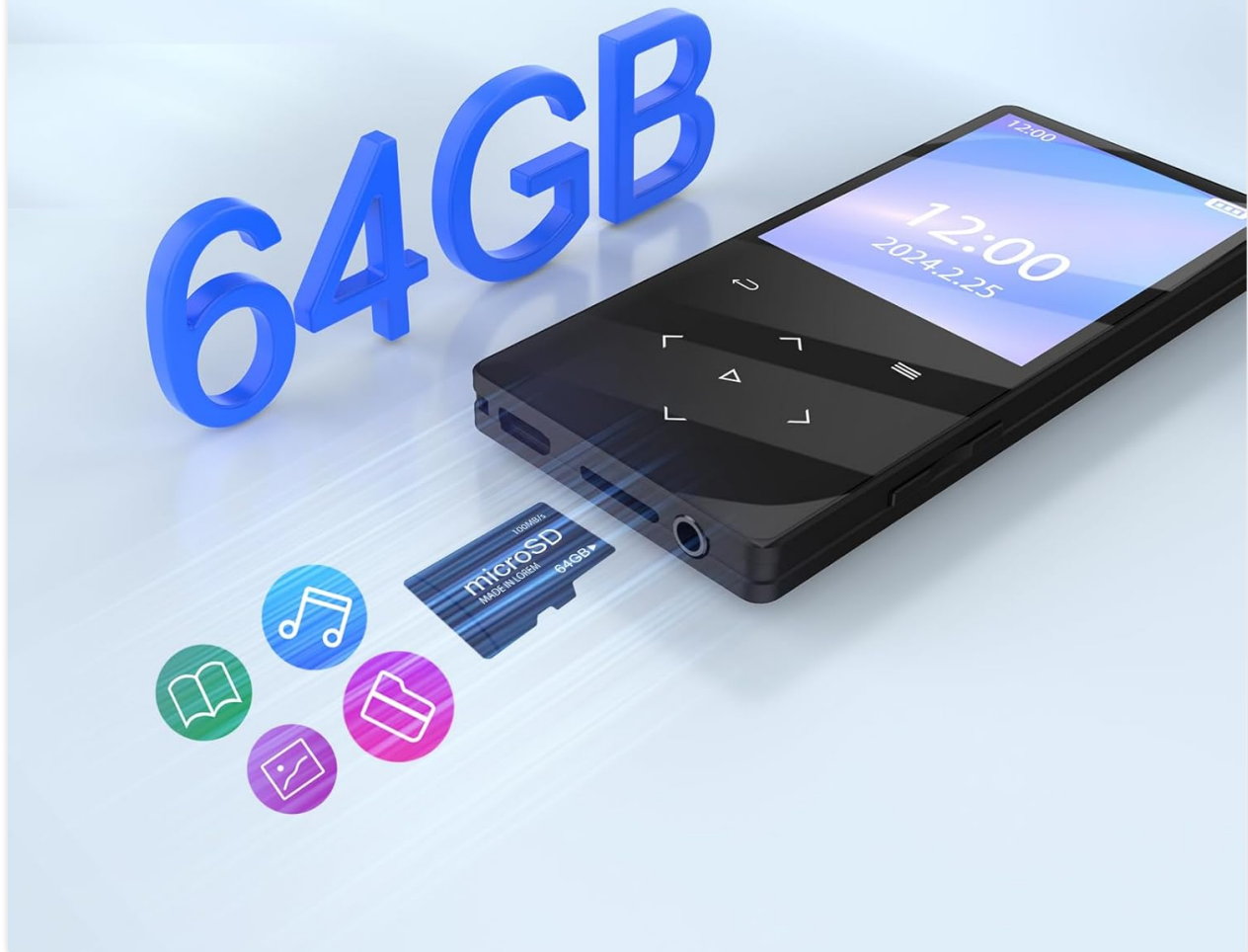
Image: The Gueray HJGP5MP3 MP3 Player with a 64GB TF card being inserted into its slot, illustrating the expandable storage capability.

Plenty for your songs, videos and photos, it can expand external storage up to 128GB.