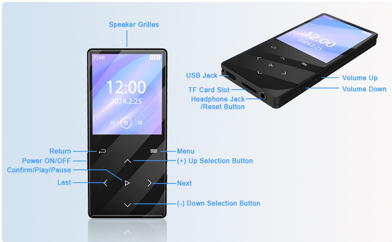
Image: Front and side views of the Gueray HJGP5MP3 MP3 Player, highlighting the speaker grilles, USB jack, TF card slot, headphone jack/reset button, volume buttons, and navigation controls (Return, Power ON/OFF, Confirm/Play/Pause, Last, Menu, Up Selection, Next, Down Selection).

Familiarize yourself with the buttons and ports: