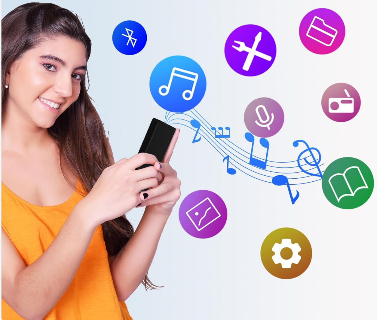
Image: The Gueray HJGP5MP3 MP3 Player displaying its multifunctional capabilities, including Bluetooth, music, tools, e-book, images, radio, and recording.