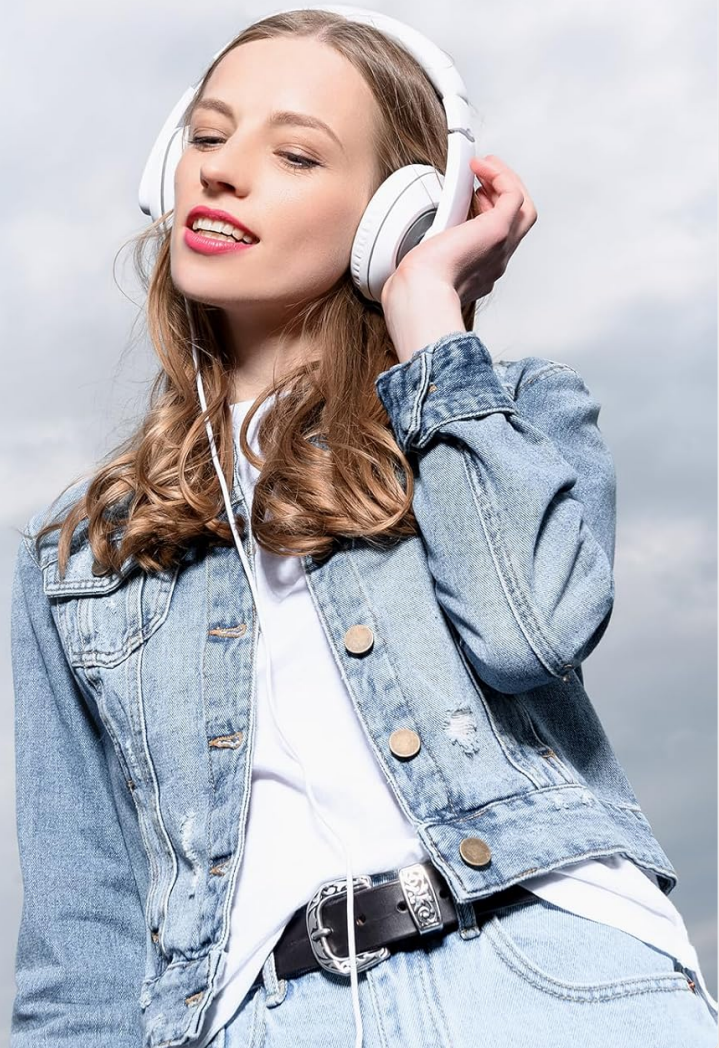
Image: A woman enjoying music with the Gueray HJGP5MP3 MP3 Player, with an overlay listing supported HiFi lossless music file formats: MP3, FLAC, WMA, AAC-LC, WAV, M4A, APE, and OGG.