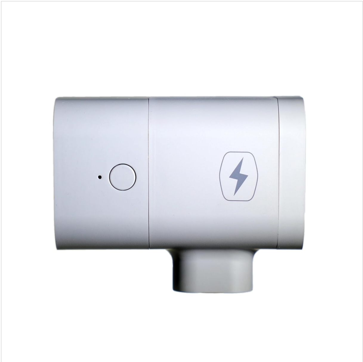
Image: The USB-C charging port and indicator lights on the PhoneSoap UV Toothbrush Sanitizer.