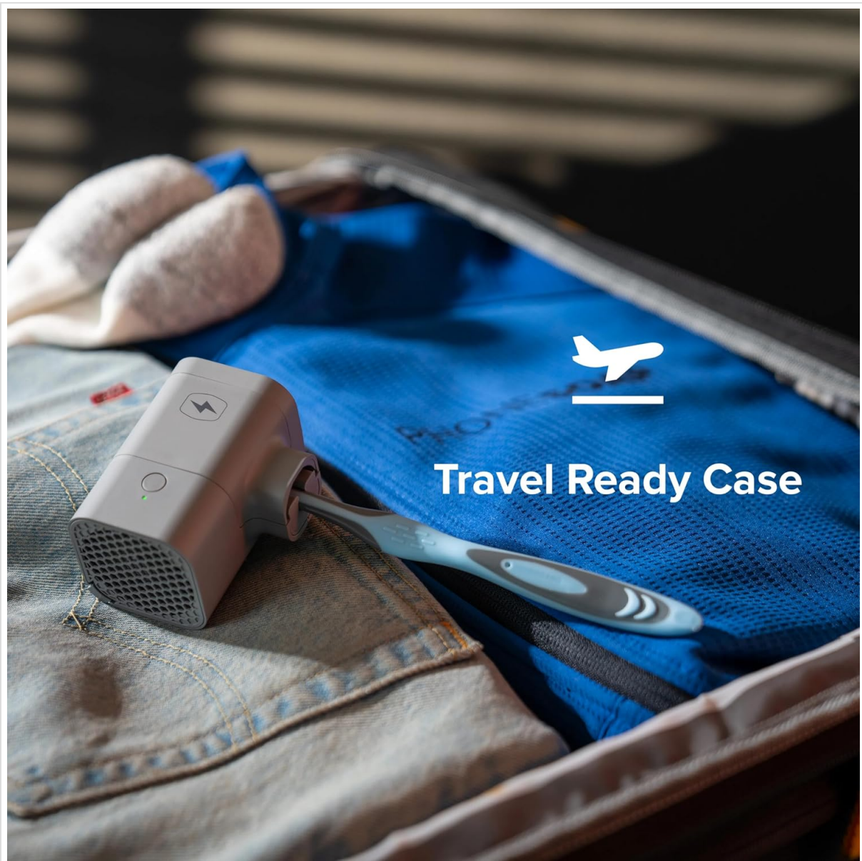
Image: The PhoneSoap UV Toothbrush Sanitizer packed in a suitcase, highlighting its travel-ready design.