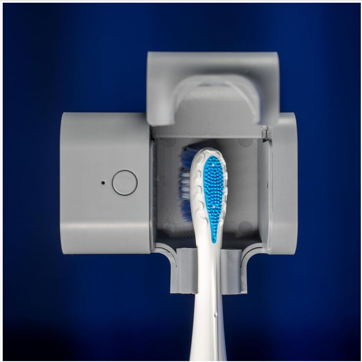
Image: A toothbrush being inserted into the open PhoneSoap UV Toothbrush Sanitizer.