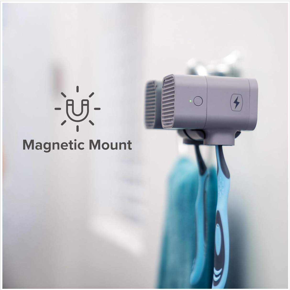
Image: The PhoneSoap UV Toothbrush Sanitizer mounted on a mirror, holding two toothbrushes.