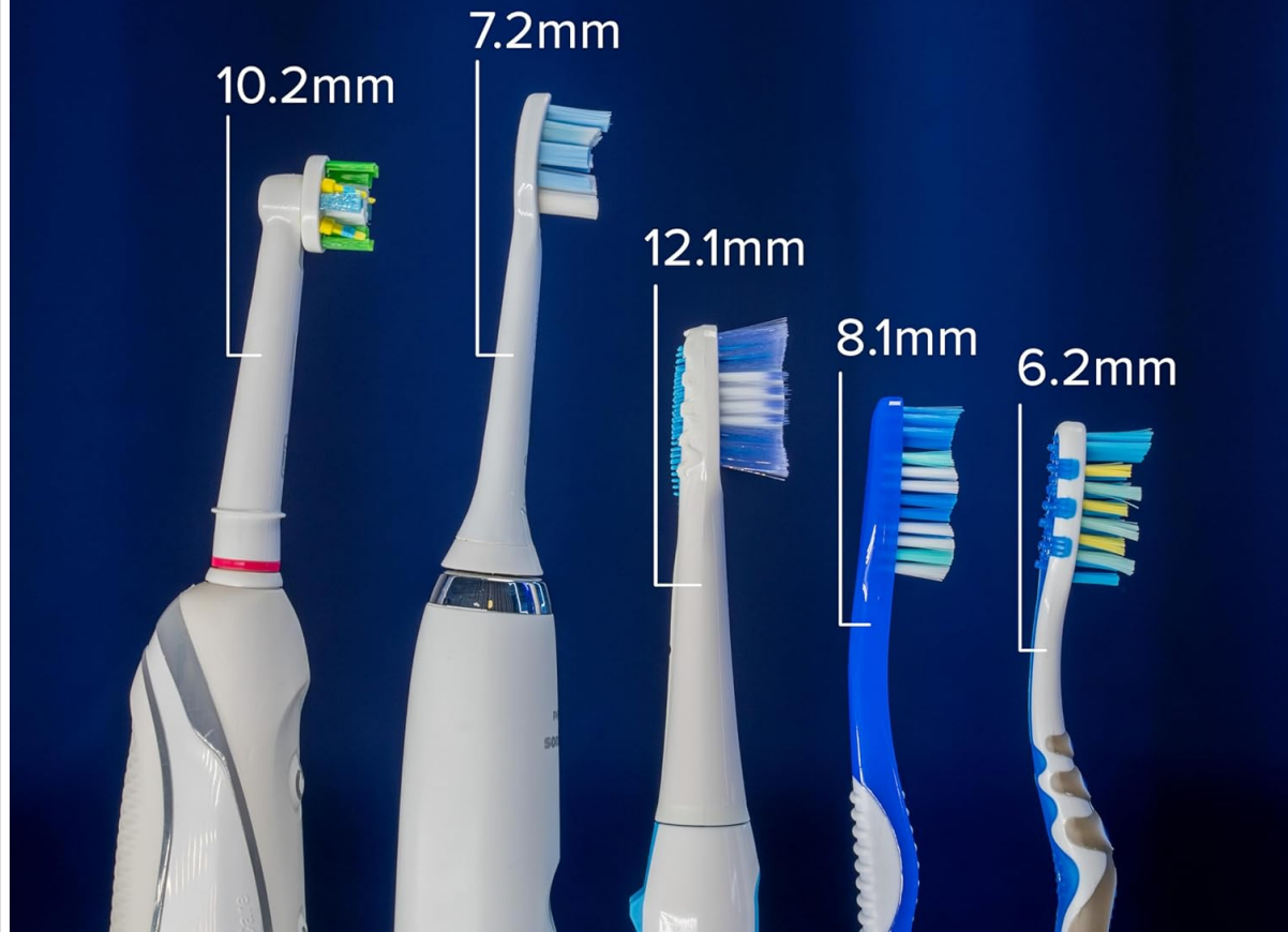
Image: An illustration showing different toothbrush head sizes that fit the sanitizer.