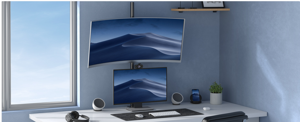
Image: Monitor arm creating a spacious and organized desk.

The monitor arm includes integrated cable management features to keep your workspace tidy. Route your monitor cables through the clips or channels along the arm and pole to conceal them, reducing clutter and creating a cleaner aesthetic.