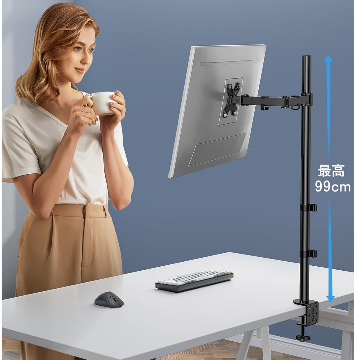
Image: Monitor arm with long pole, showing height adjustment.