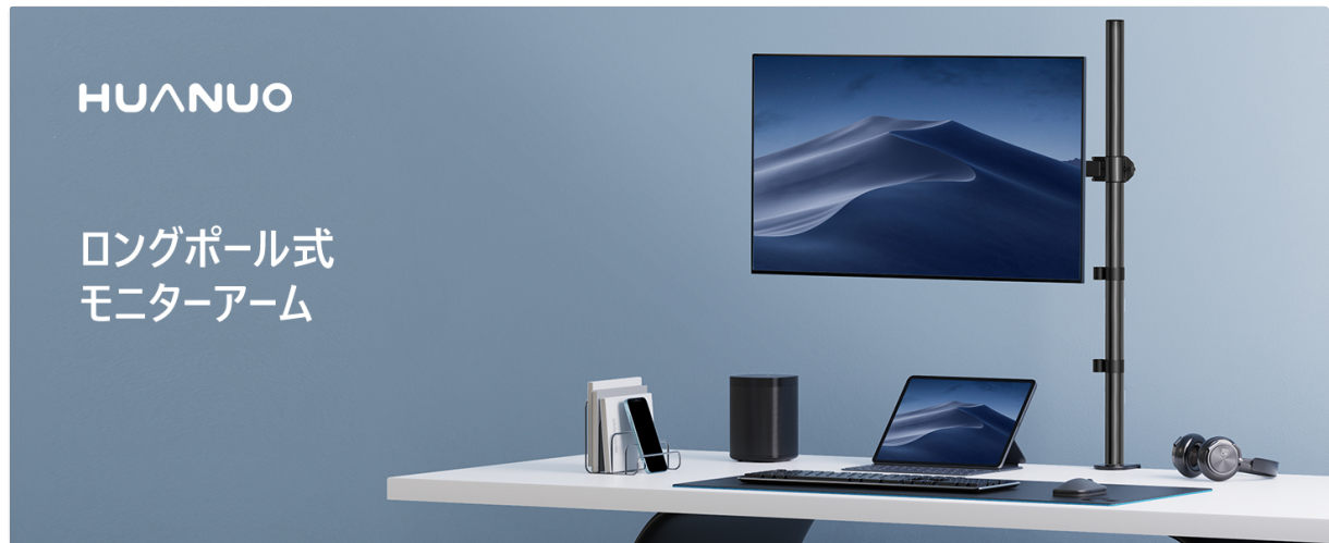
Image: Monitor compatibility and VESA standards.