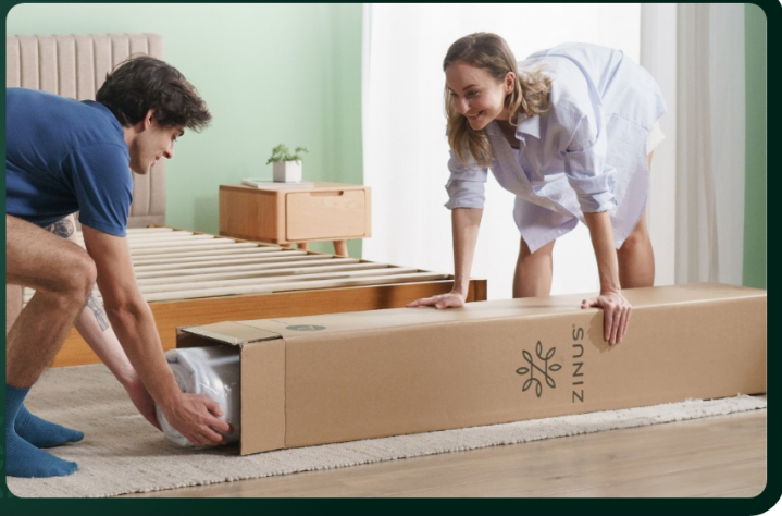
Image: Illustrates the compact packaging and ease of unboxing.