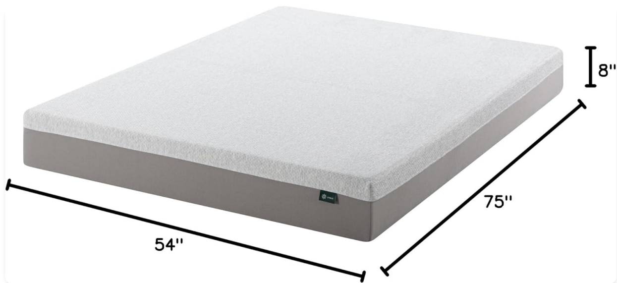
Image: Detailed dimensions of the Zinus Ultima 8 Inch Full mattress.