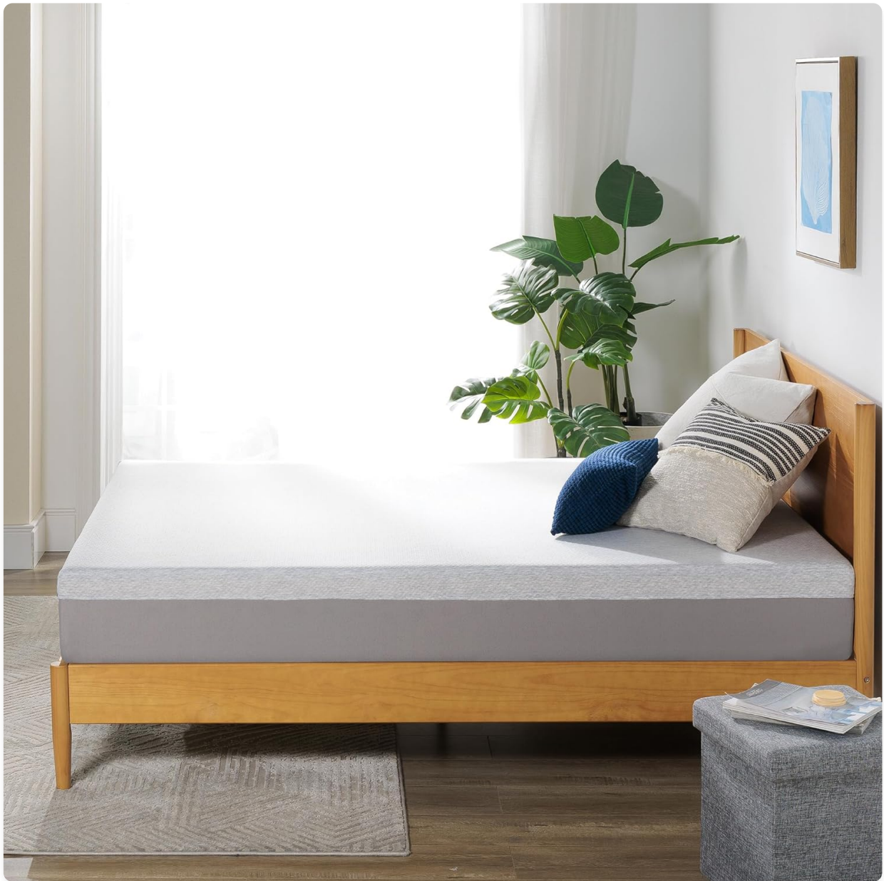
Image: The Zinus Ultima 8 Inch Full Memory Foam Mattress, showcasing its clean design on a bed frame.