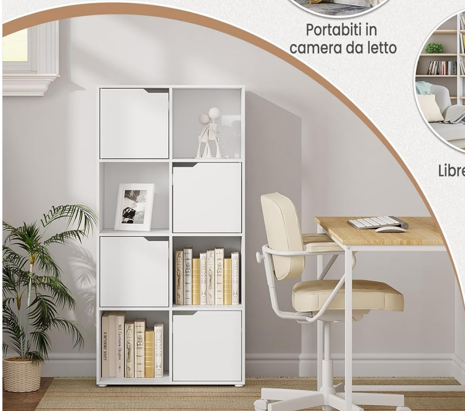
Image 5.1: Examples of the bookshelf's versatile use in different rooms.