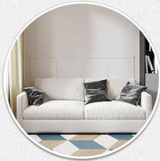
Scaffale portaoggetti in soggiorno