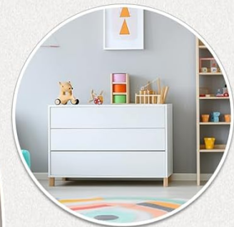
Portagiocattoli in cameretta dei bambini