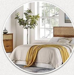
Portabiti in camera da letto