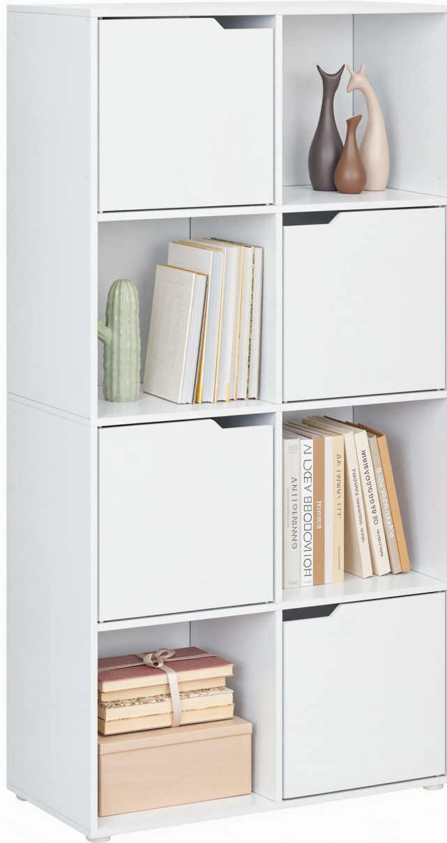
Image 1.1: Front view of the WOLTU SK039ws 8-Cube Freestanding Bookshelf.