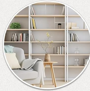
Libreria in studio