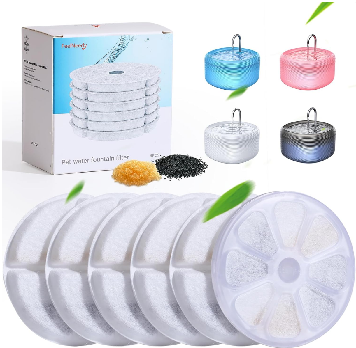
Image 1.1: Overview of FEELNEEDY FN-W06 filters and compatible pet water fountains.