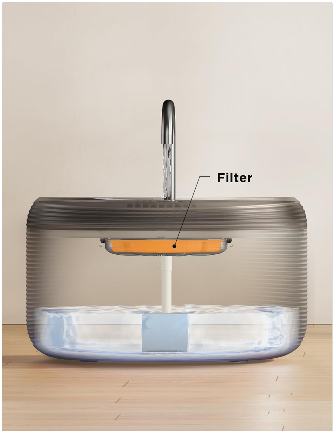
Image 4.4: Placing the prepared filter onto the fountain's top cover.