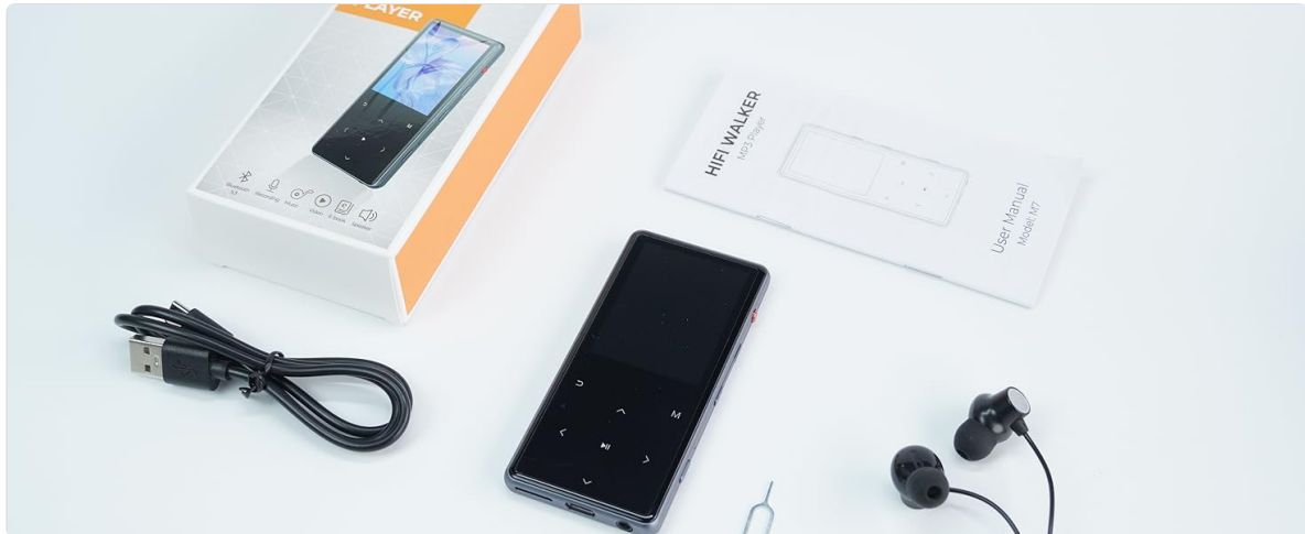
Figure 2.1: Package Contents

Please check the contents of your package to ensure all items are present: