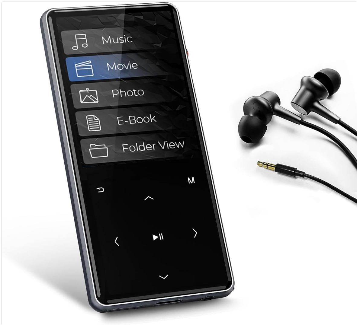
Figure 1.1: HIFI WALKER M7 MP3 Player and Earphones