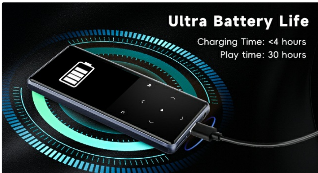
Figure 3.1: Charging the MP3 Player