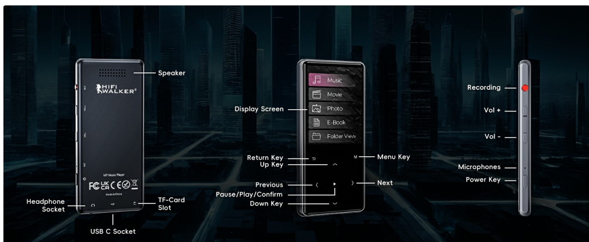
Figure 1.2: M7 MP3 Player Labeled Diagram

The device features a clear display and intuitive touch buttons for easy navigation. Key components include: