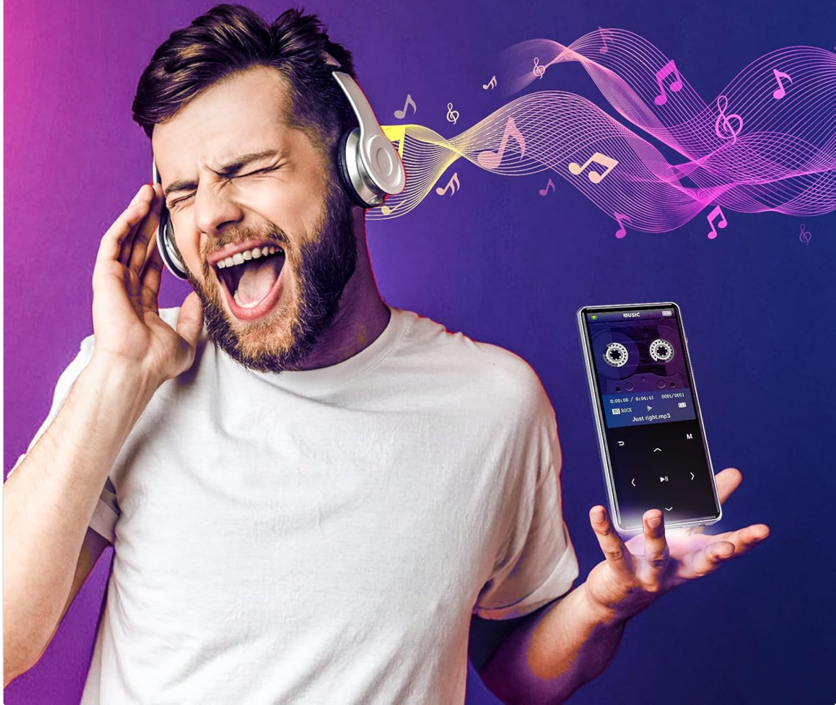
Figure 4.4: Built-in Speaker