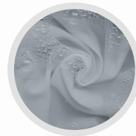
Washable Cushion Covers

Image: A detailed view of the PE Rattan Wicker construction, highlighting its hand-woven texture and properties such as UV resistance, durability, and weather resistance.