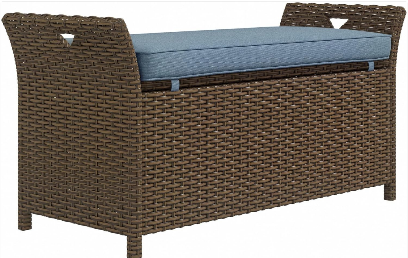
Image: The Outsunny 29 Gallon Patio Wicker Storage Bench, showcasing its dark blue cushion and brown wicker finish.

The Outsunny 29 Gallon Patio Wicker Storage Bench is a versatile 2-in-1 outdoor furniture piece designed to provide both comfortable seating for two and ample storage space. Constructed from durable PE plastic rattan and reinforced with a powder-coated steel frame, this bench is built for outdoor use. It features a thickly padded cushion for enhanced comfort and side handles for easy portability.