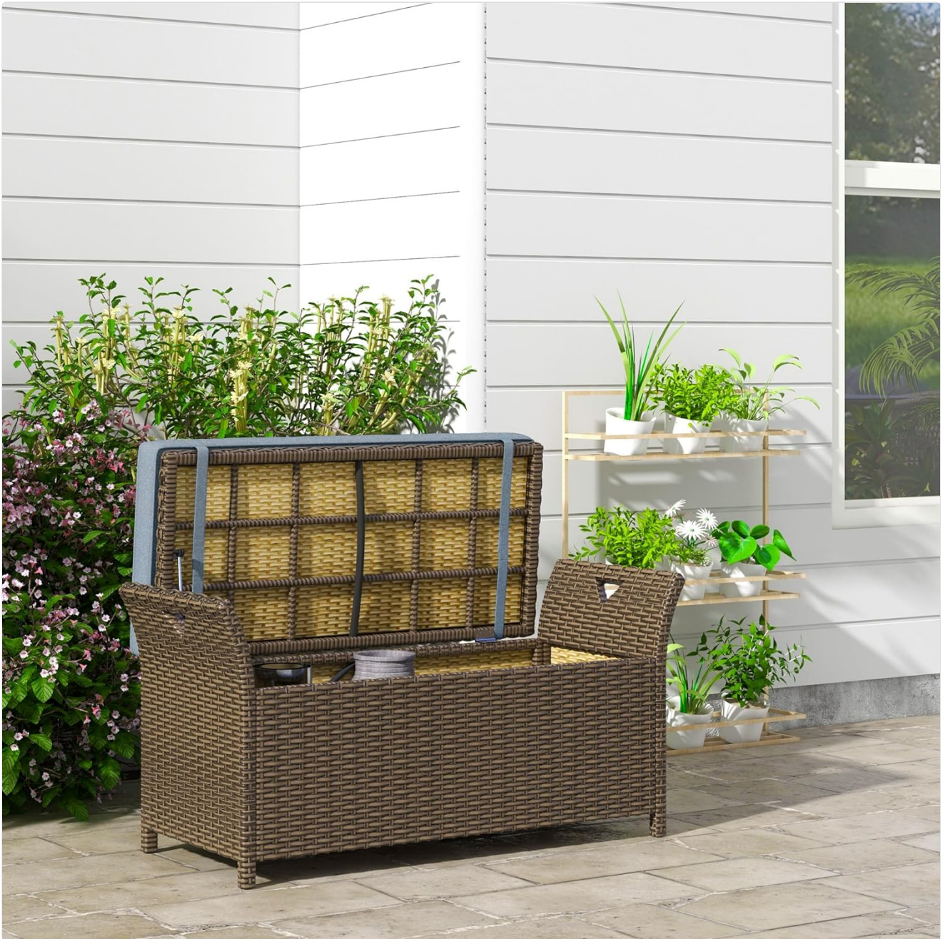
Image: The Outsunny storage bench with its lid fully open, showcasing the accessible storage compartment ready for use.