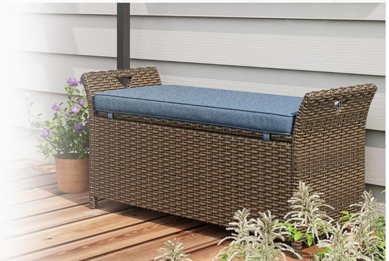
Image: The comfortable cushion, illustrating its soft padding and the convenience of removable and washable covers.