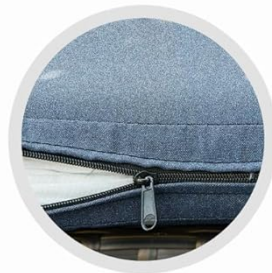
Removable Cushion Covers