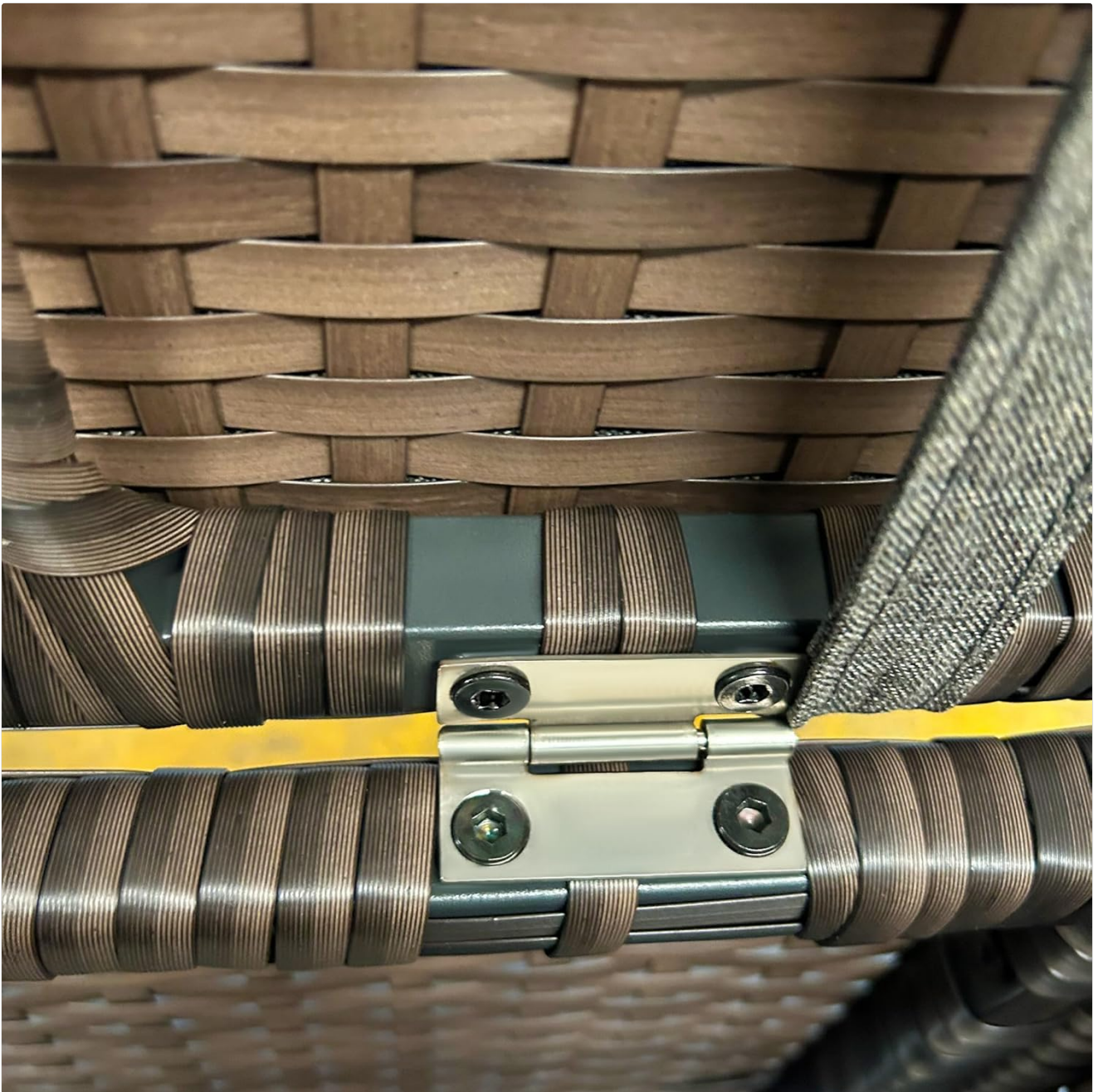
Image: A close-up of the robust hinge mechanism that allows the bench seat to open and close smoothly, providing access to the storage compartment.