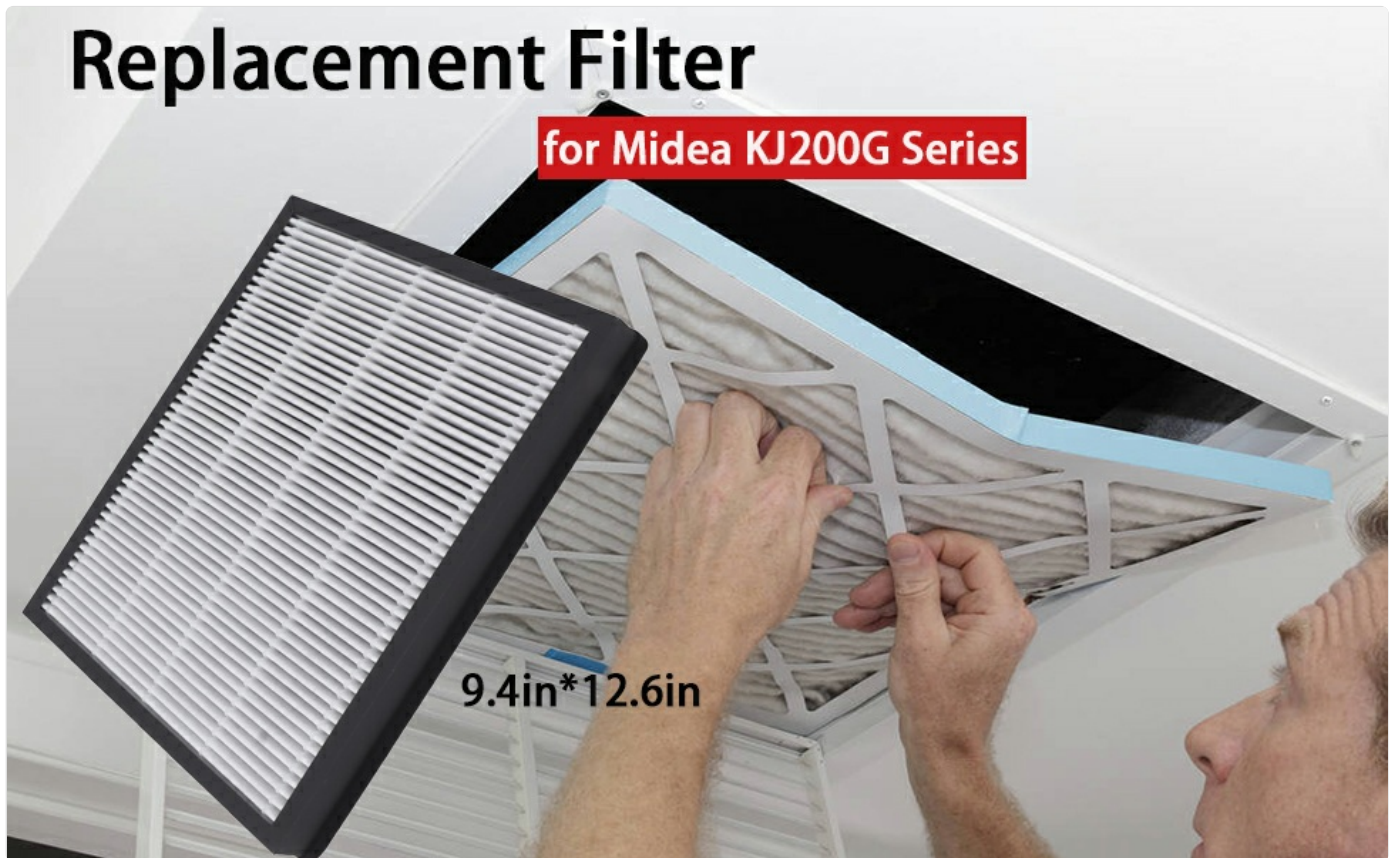
Image: A visual guide demonstrating the process of replacing an air filter in an air purifier, showing the removal of the old filter and insertion of the new one.