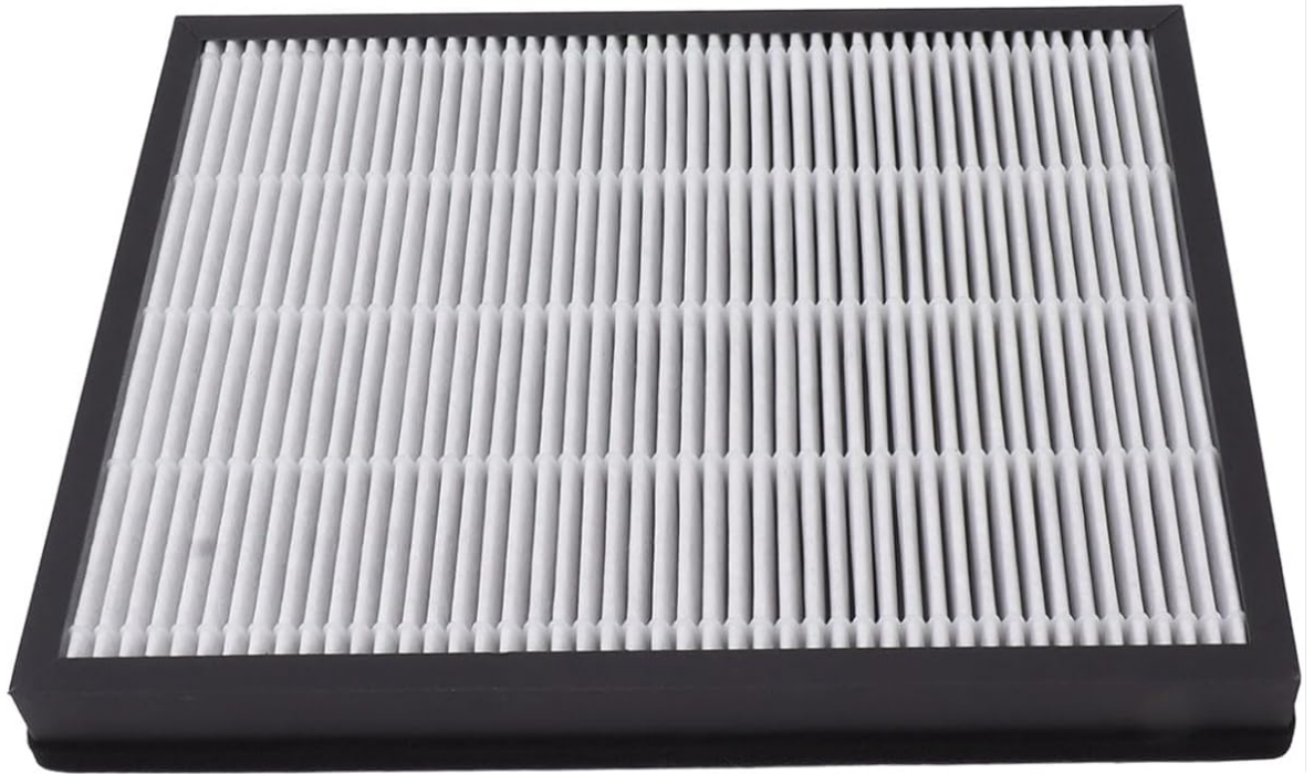
Image: The FUZHUI Replacement Air Purifier Filter shown in a typical home environment, highlighting its intended use in improving indoor air quality.

This air filter is suitable for Midea air purifier for KJ200G D41, for KJ210G C42, C46 composite filter element.