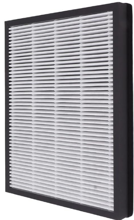
Image: A detailed view of the filter, illustrating its ability to remove large particles, common pollutants like dust, pollen, smoke, odor, and pet dander, and its high-efficiency particulate filtration.

Reduce unnecessary odors in living spaces