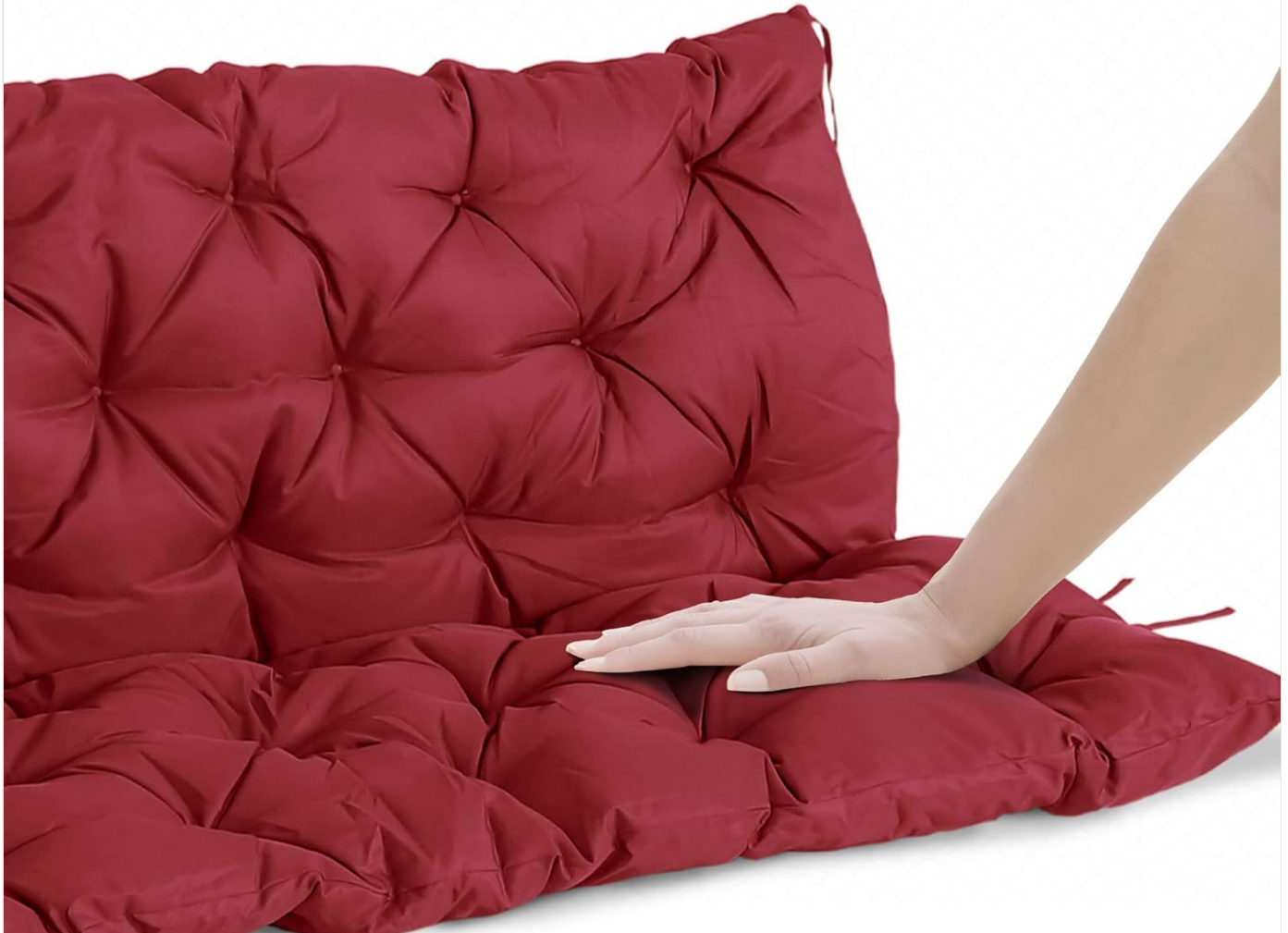
Figure 2: A hand pressing on the cushion, illustrating its overstuffed filling and high resilience for ultimate seating comfort.