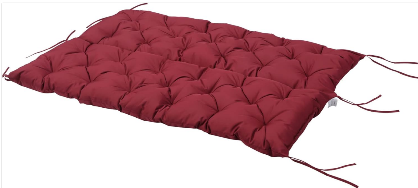
Figure 4: Detailed dimensions of the Outsunny 3-Seater Tufted Bench Cushion.