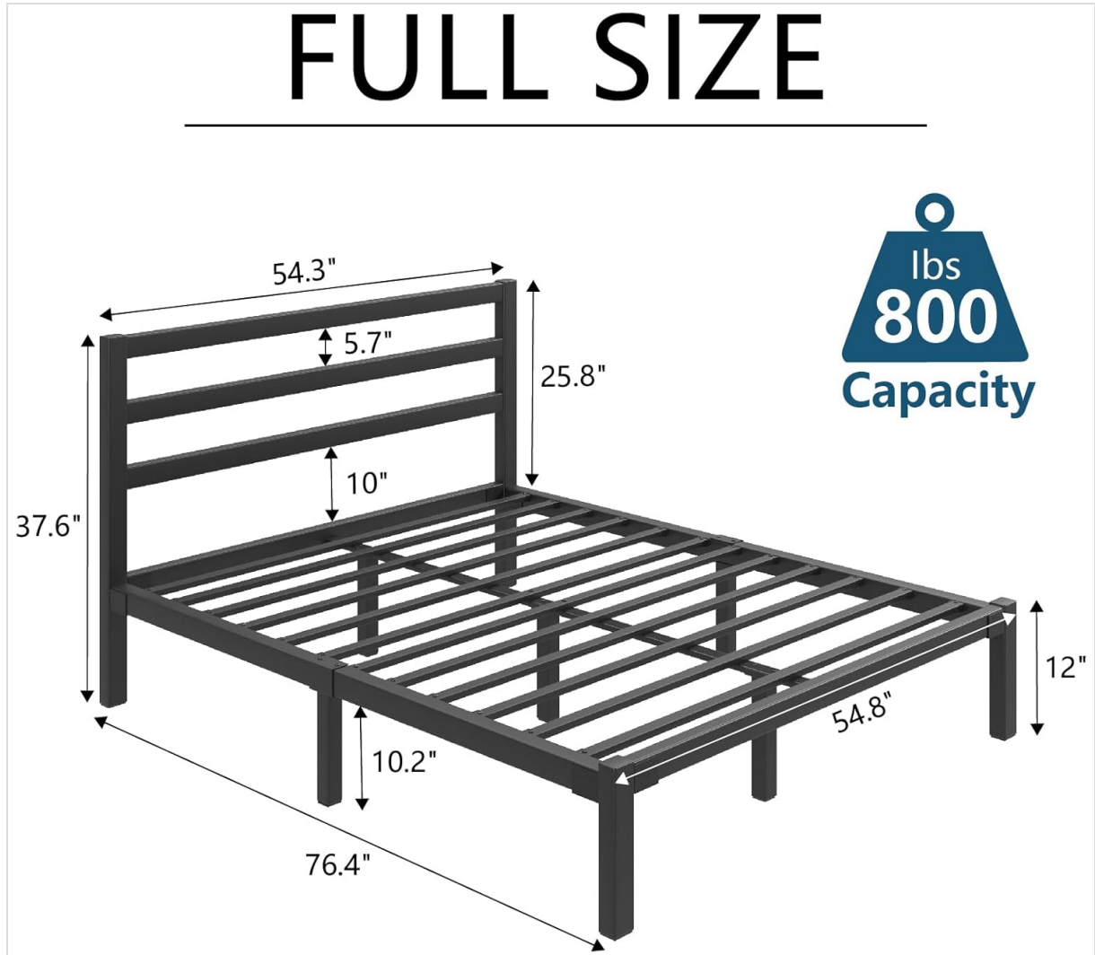
Figure 1: LoVinson Full Size Metal Platform Bed Frame Dimensions

The image below illustrates the dimensions of the Full Size bed frame.