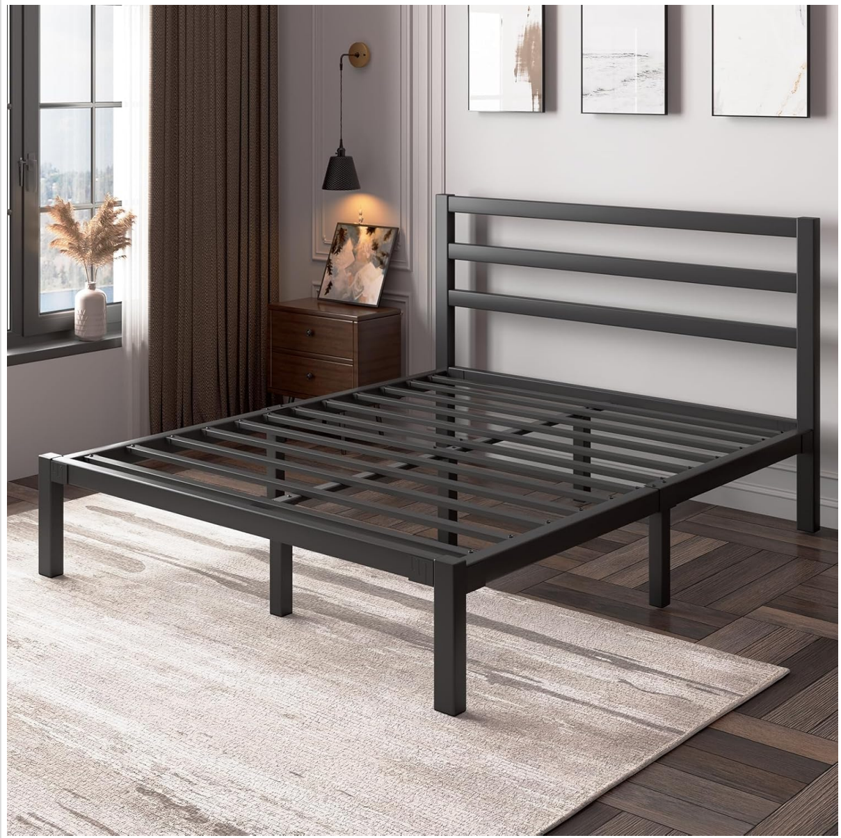
Figure 3: Assembled Frame without Mattress