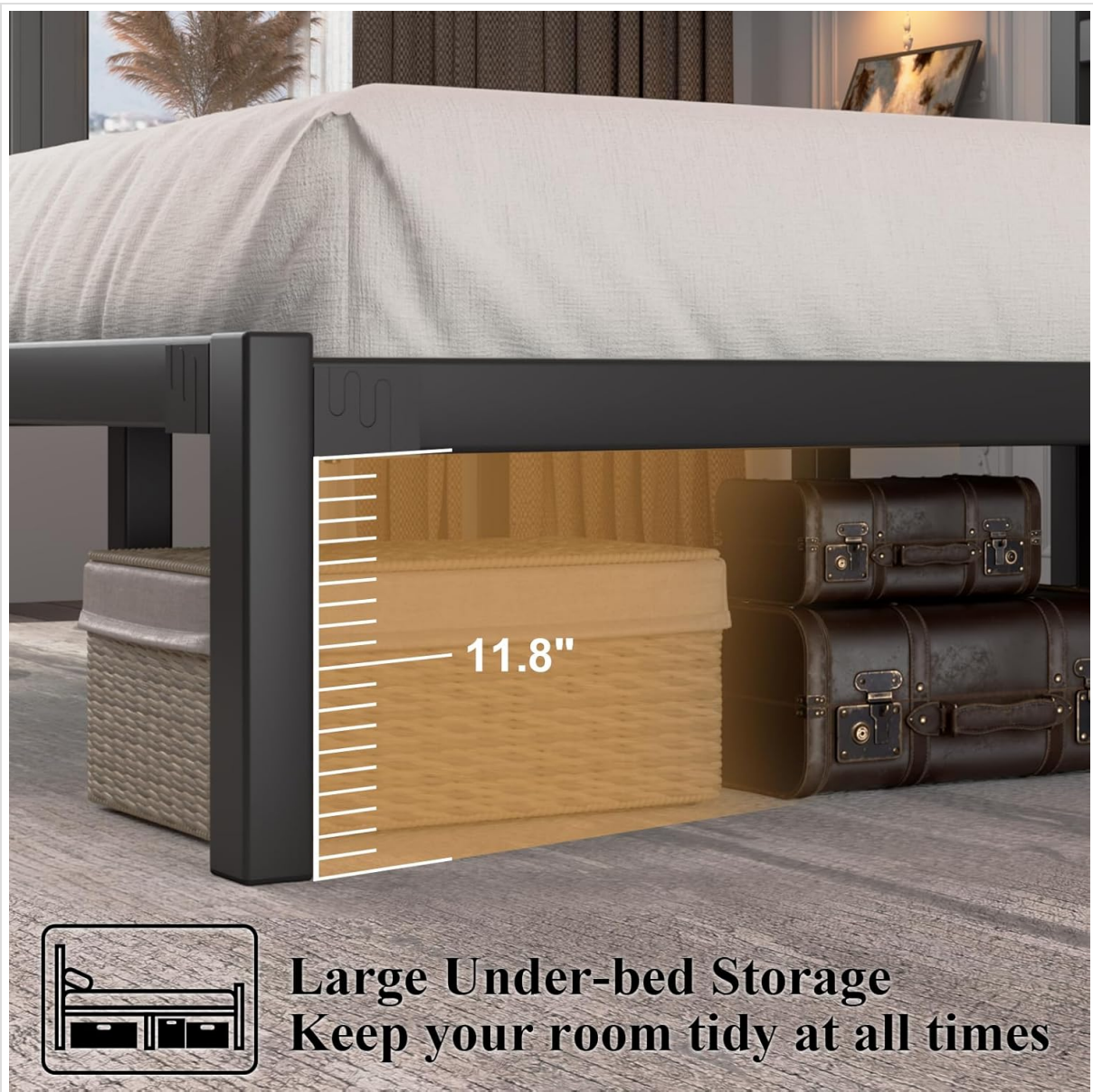
Figure 4: Under-Bed Storage Space