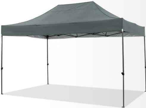
Image: Visual guide for the three main steps of canopy assembly.

Push it up until the frame is completely open.