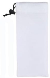
Image: All components included in the COBIZI 10x15 Pop Up Canopy package.