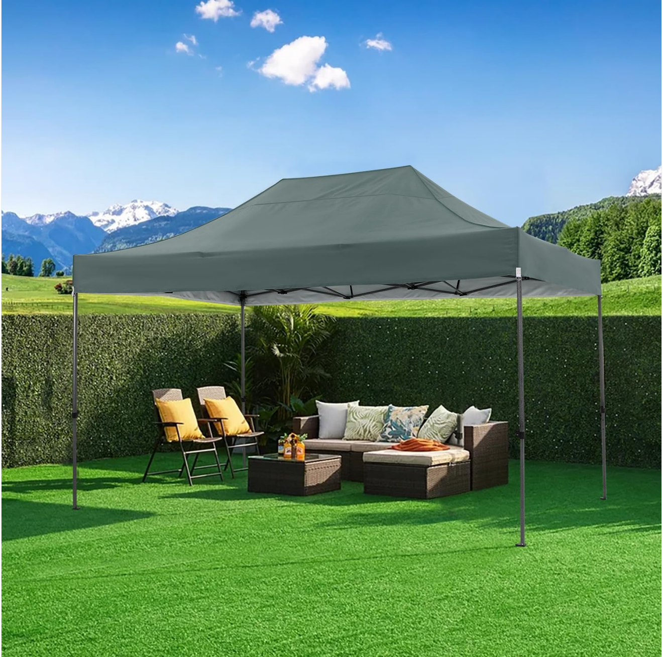
Image: The canopy providing shade in a garden setting.

Your COBIZI 10x15 Pop Up Canopy is designed for various outdoor activities, providing shade and protection from light weather conditions.