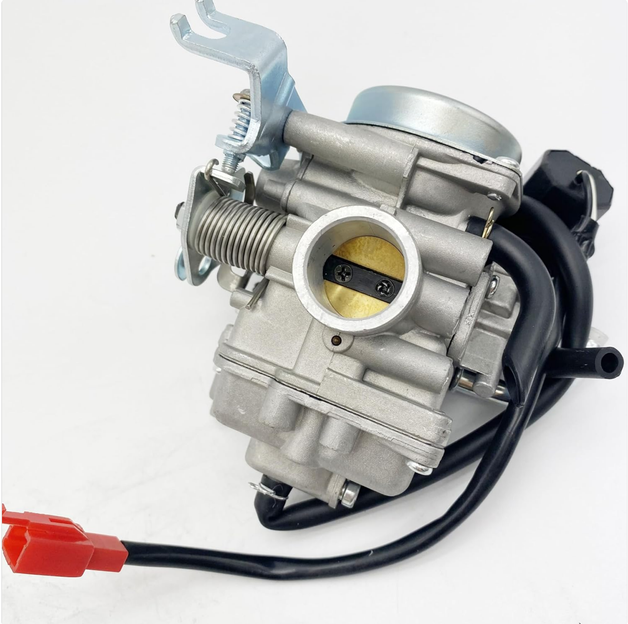
Figure 3: View of the carburetor's air intake side. The air/fuel mixture screw is typically located near the base of the carburetor, often on the engine side of the throttle plate.