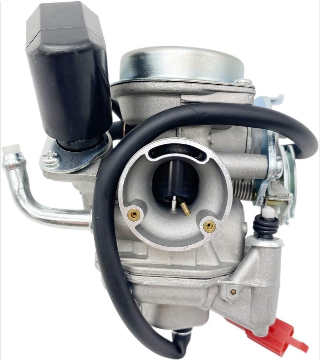
Figure 1: General view of the XILENY Carburetor. This image shows the overall assembly, including the main body, fuel inlet, and air intake, providing a visual reference for installation.