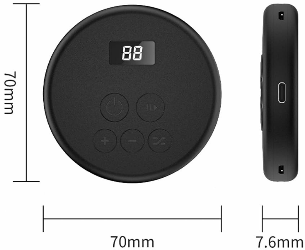
Image: Dimensions of the DollaTek Automatic Clicker main unit, showing a diameter of 70mm and a thickness of 7.6mm.