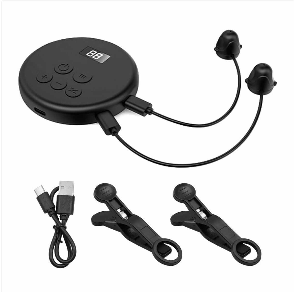
Image: The main unit of the DollaTek Automatic Clicker with two clicker heads attached, ready for use.