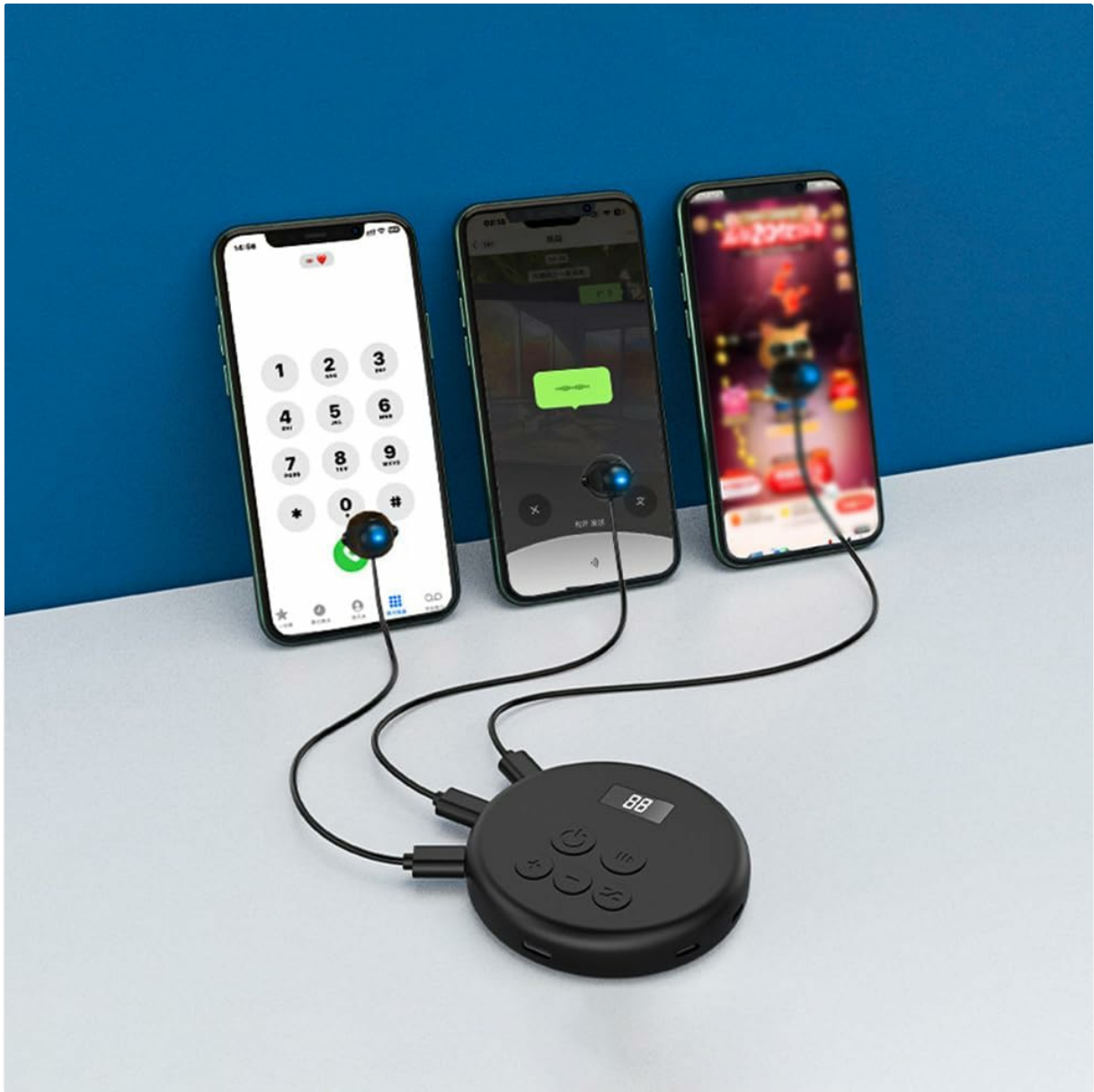
Image: The DollaTek Automatic Clicker main unit connected to three mobile phones, with clicker heads positioned on their screens, illustrating a multi-device setup.