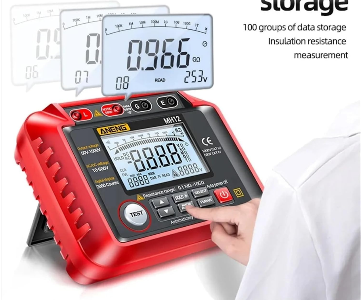
Figure 7.1: Data storage feature in use.

100 groups of data storage Insulation resistance measurement