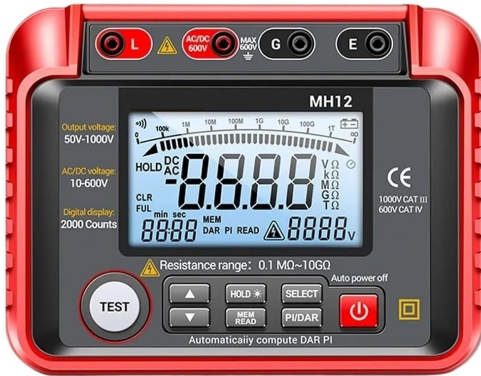
Figure 4.1: Front view of the MH12 Digital Megohmmeter.