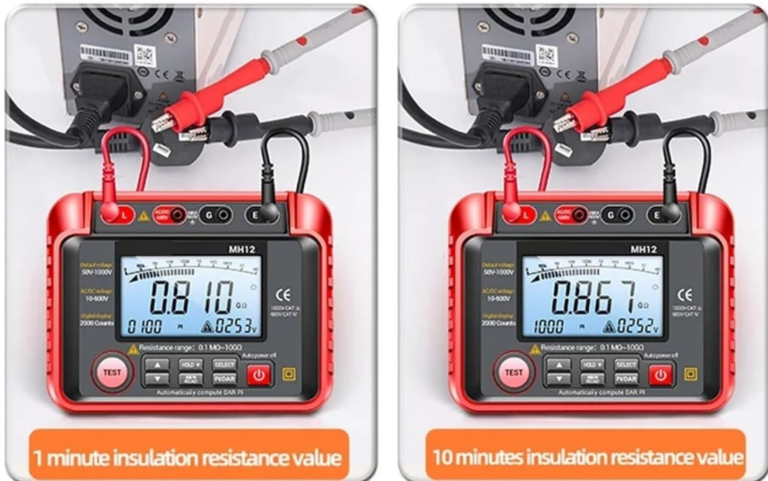
Figure 7.2: Polarization Index (PI) measurement process.