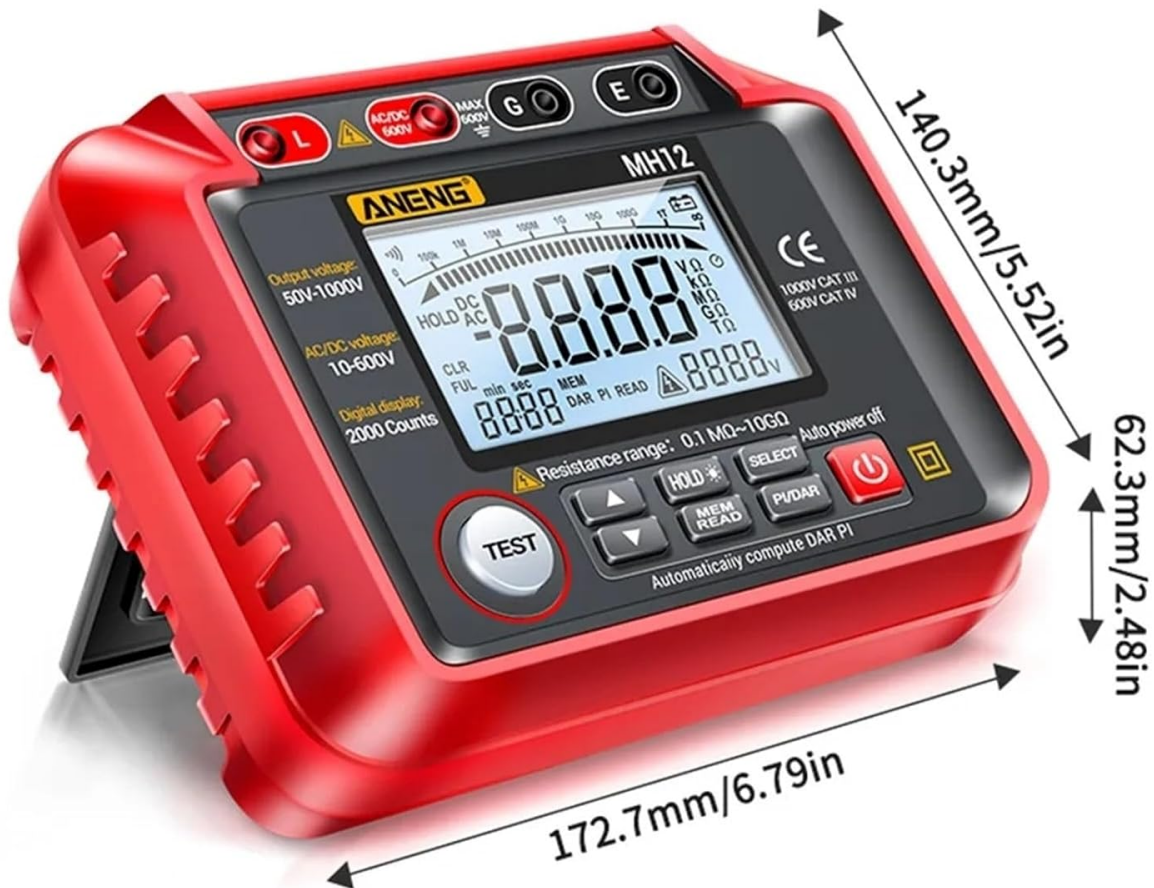
Figure 5.2: Product size measurement diagram.

High Precision Megohmmeter Insulation Resistance Tester