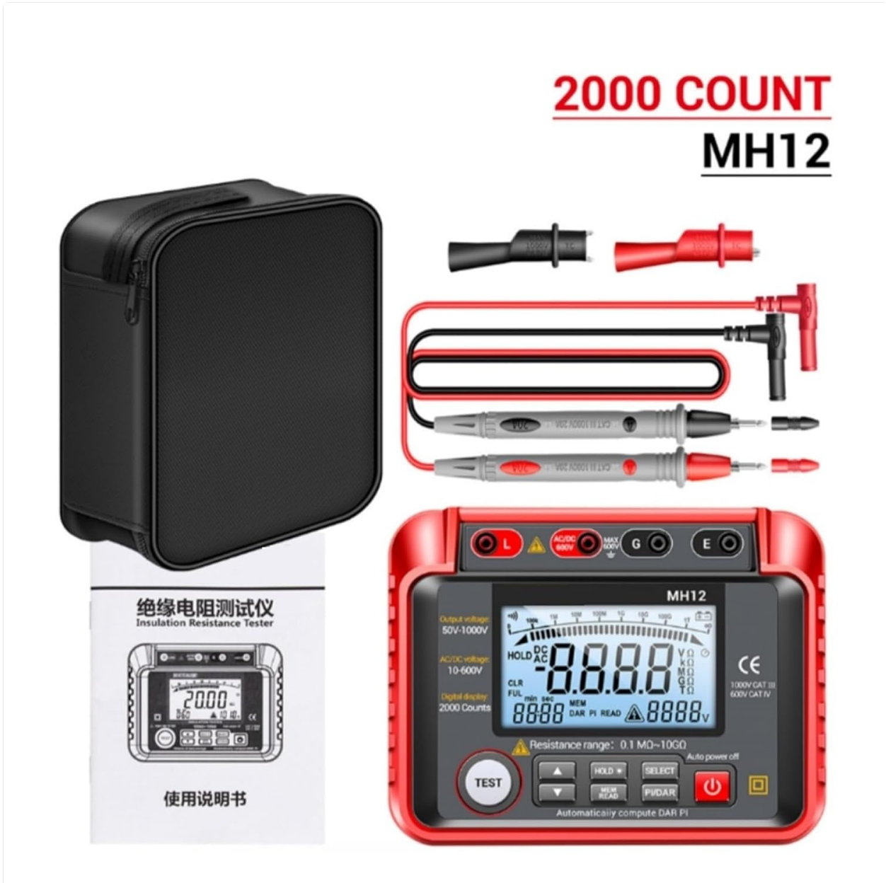
Figure 3.1: MH12 Megohmmeter and its standard accessories.