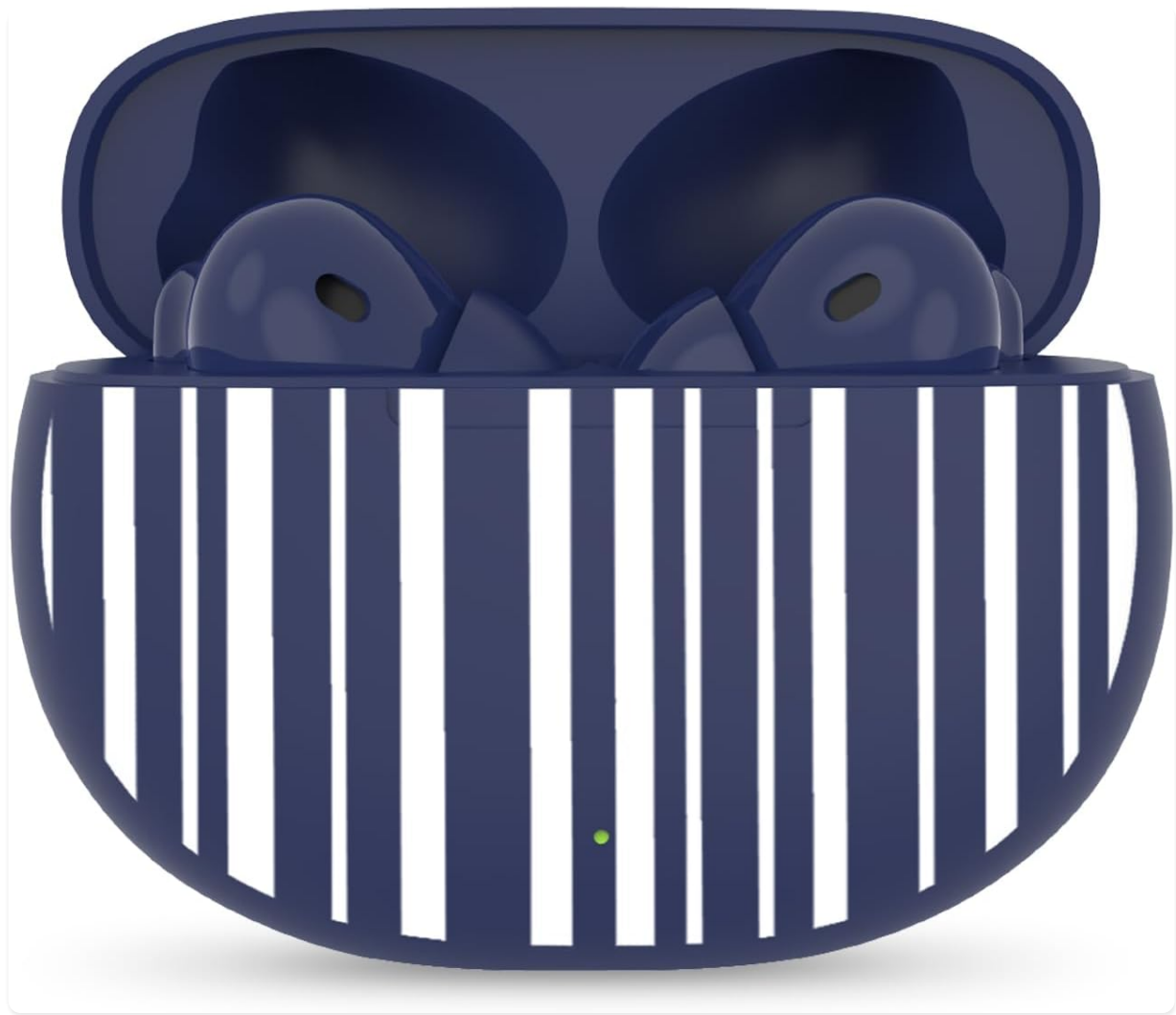
Image: Packed Party True Wireless Earbuds in their open charging case, showcasing the navy blue color and striped design on the case.