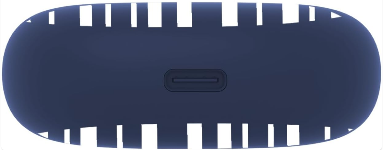
Image: A close-up view of the USB-C charging port located on the bottom of the earbud charging case.