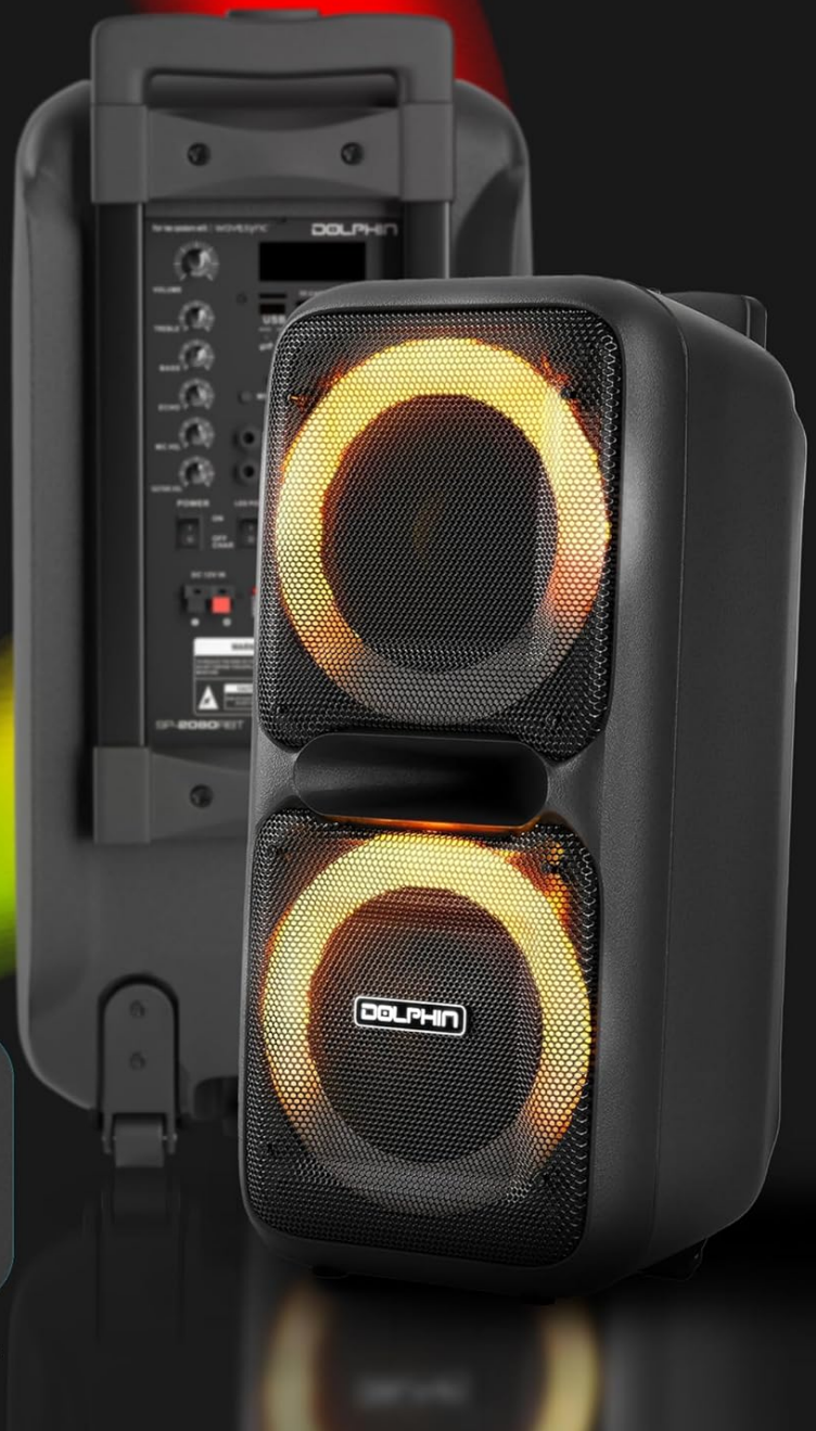
Image: The Dolphin SP-2080RBT speaker displaying its vibrant, sound-activated LED ring lights, enhancing the party atmosphere.