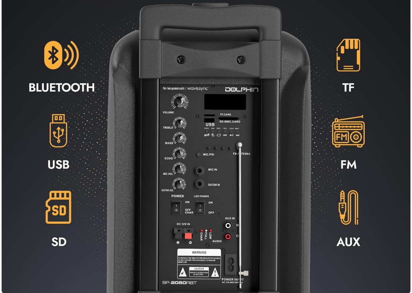
Image: The rear panel of the Dolphin SP-2080RBT, illustrating various input options including Bluetooth, USB, SD, TF, FM, and AUX.

More Audio Choices for Enhanced Music Enjoyment