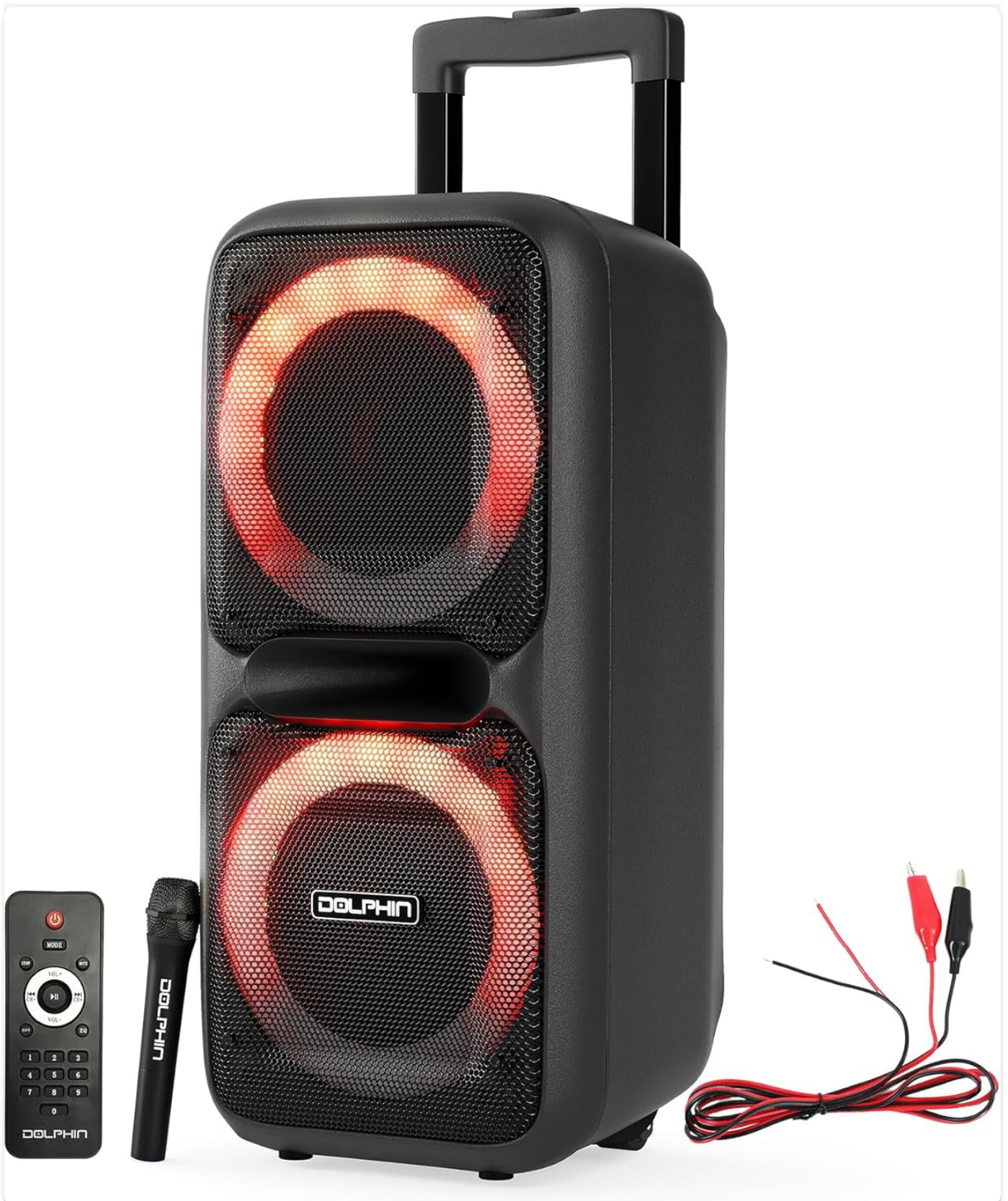
Image: The Dolphin SP-2080RBT Party Speaker, showcasing its dual 8-inch woofers with LED lights, alongside the included wireless microphone, remote control, and audio cables.