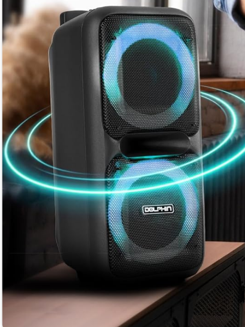
Image: The Dolphin SP-2080RBT speaker highlighting its internal battery capacity, indicating long-lasting power for events.

Enjoy prolonged periods of music playback, ideal for long events.