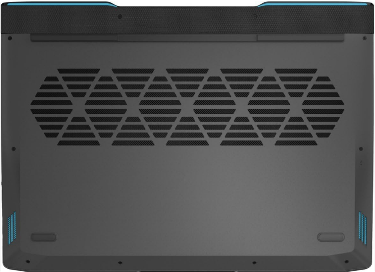
Image: The underside of the Lenovo LOQ Gaming Laptop, displaying the extensive ventilation grilles designed for efficient heat dissipation. Regular cleaning of these vents is recommended for optimal performance.