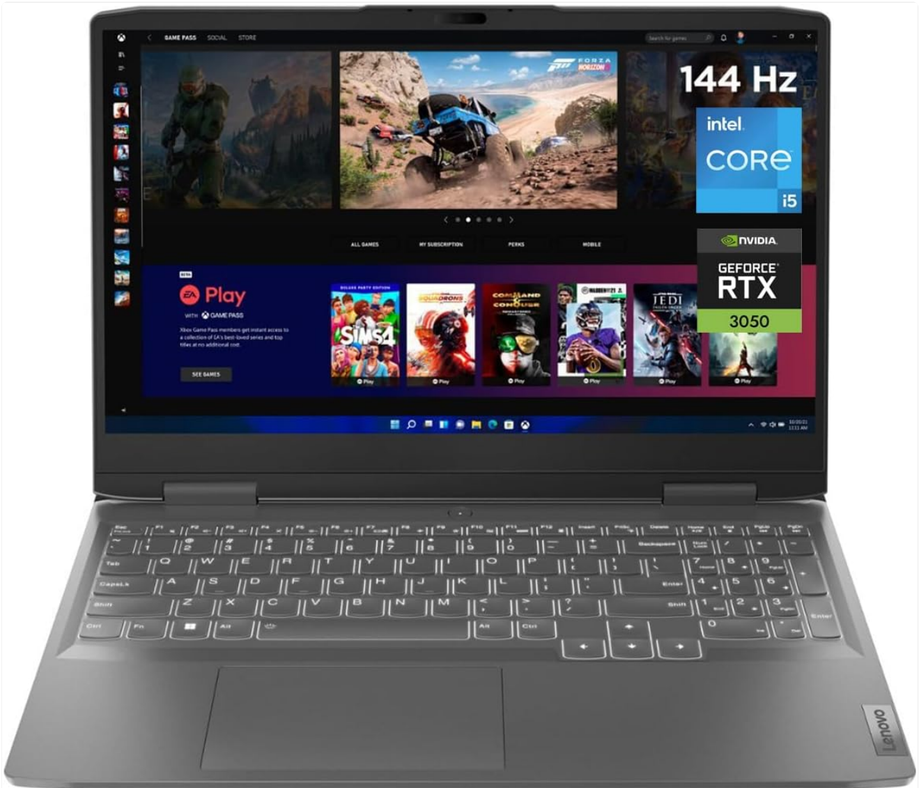
Image: A top-down view of the Lenovo LOQ Gaming Laptop, showcasing its display and keyboard layout during operation.