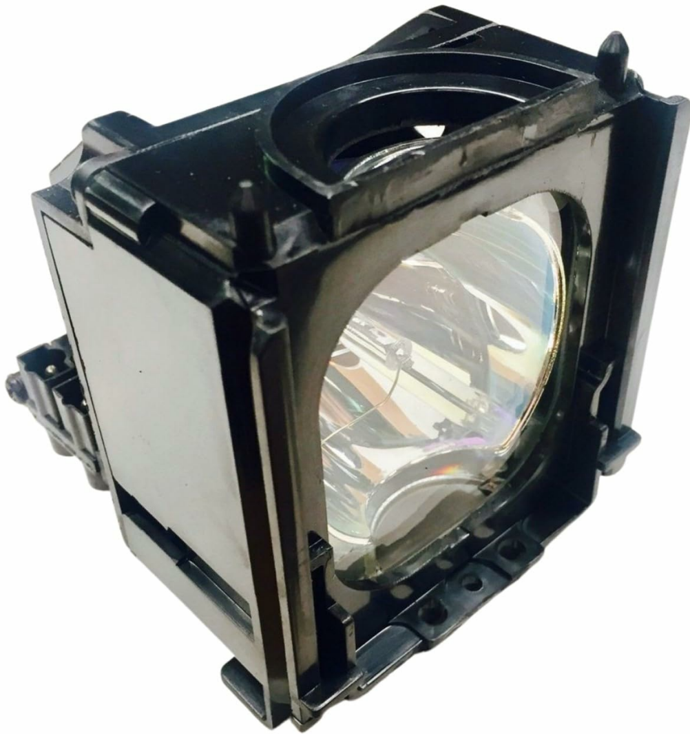
Figure 1: Jaspertronics OEM Lamp and Housing module.