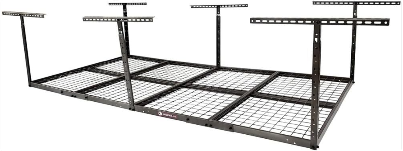
Figure 1: Fully assembled Armadillo Tough SkyRack, ready for use.