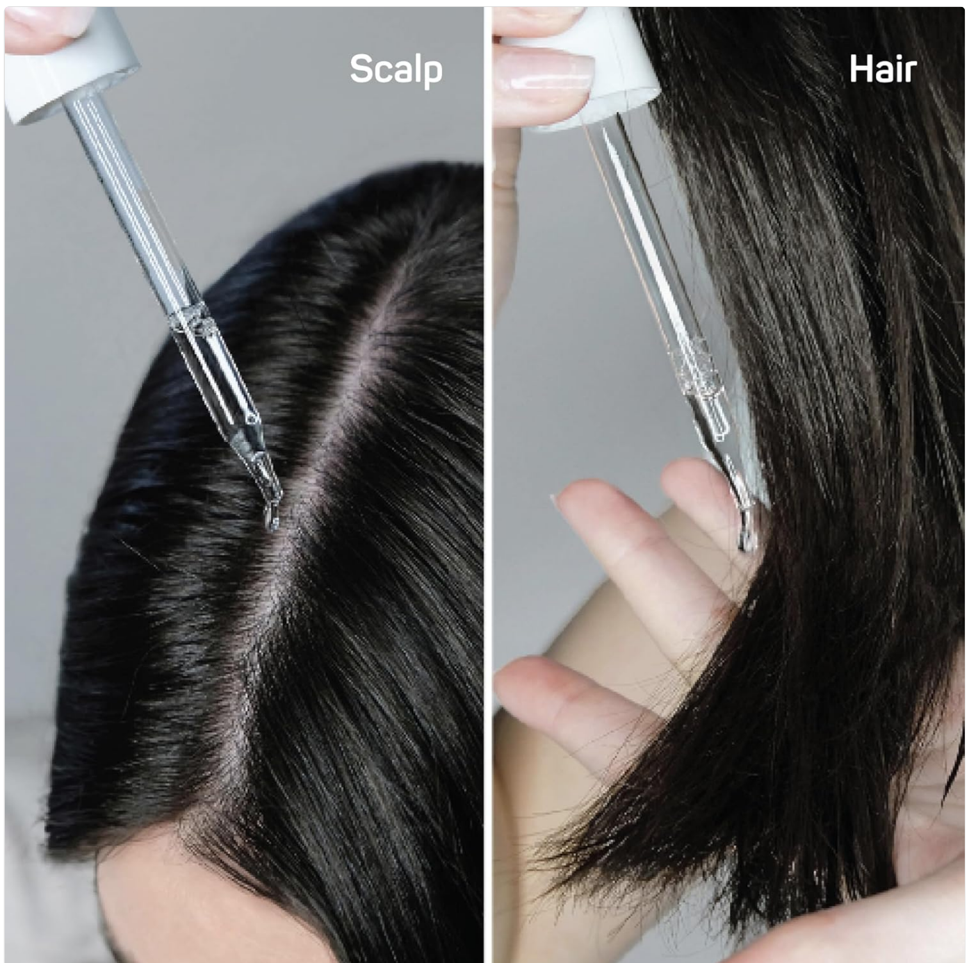
Image: A visual guide demonstrating the application of the serum directly to the scalp and also along hair strands.