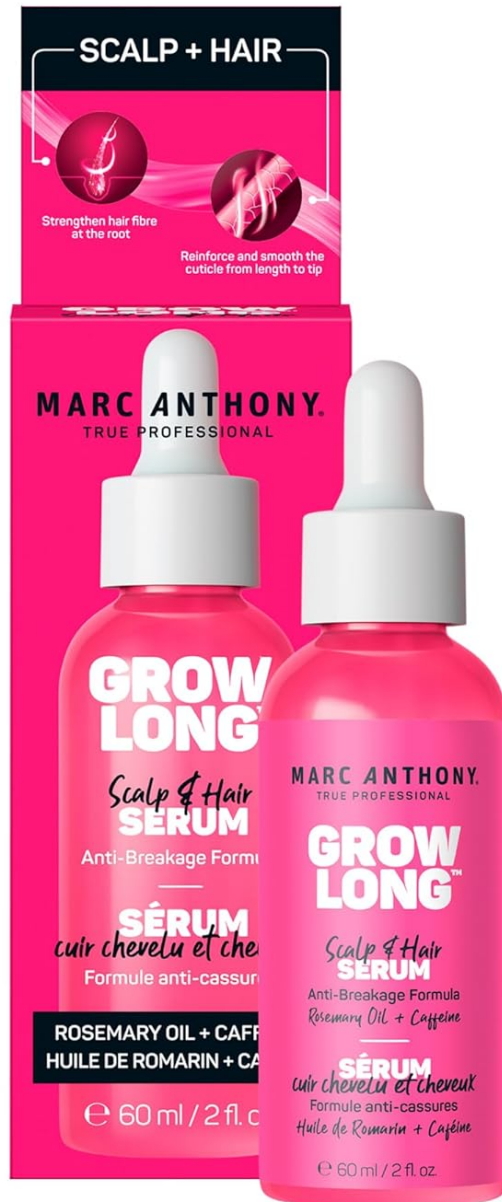
Image: Marc Anthony Grow Long Scalp & Hair Serum bottle and its retail packaging.