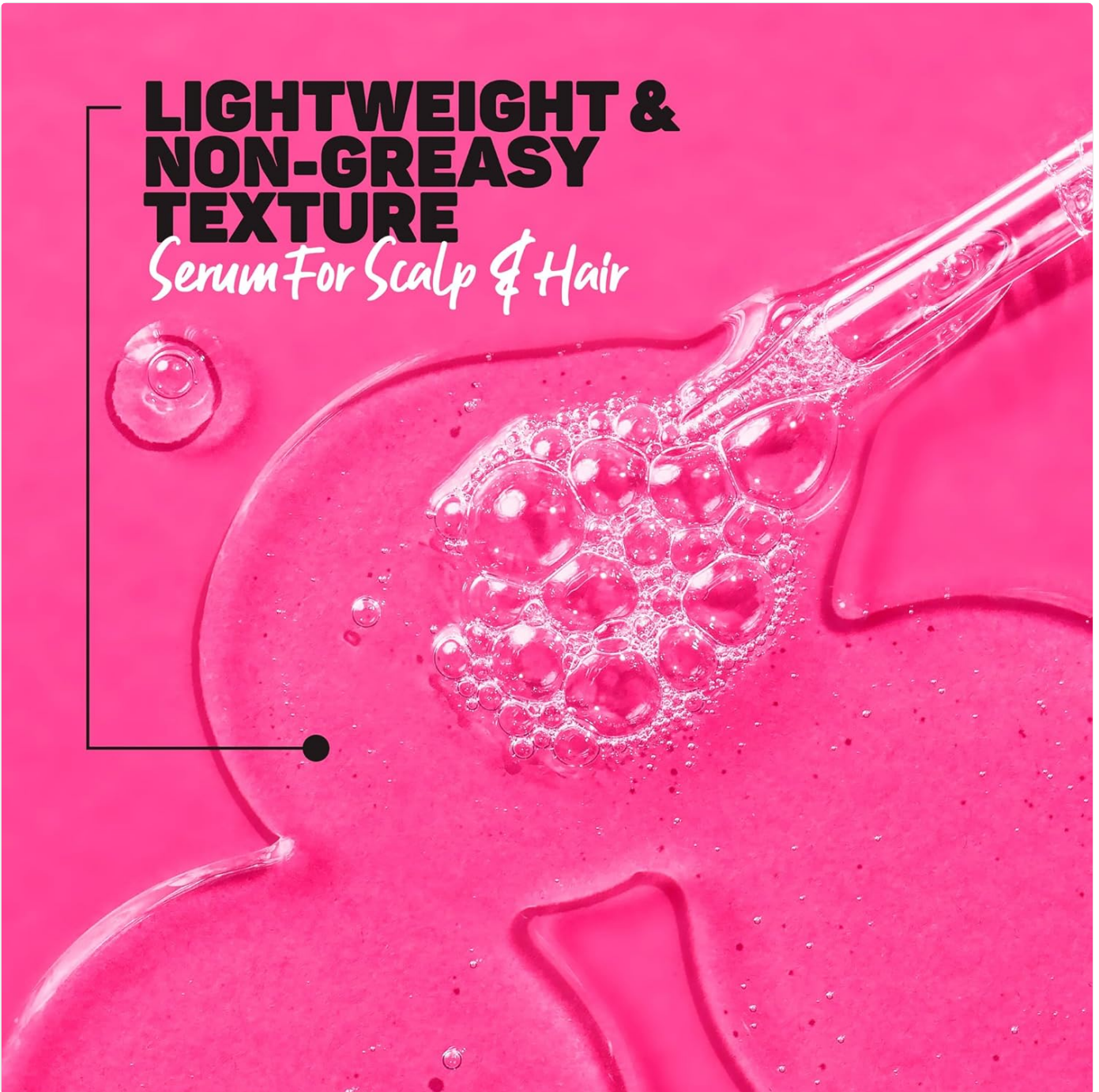
Image: A visual representation of the serum's lightweight and non-greasy texture.