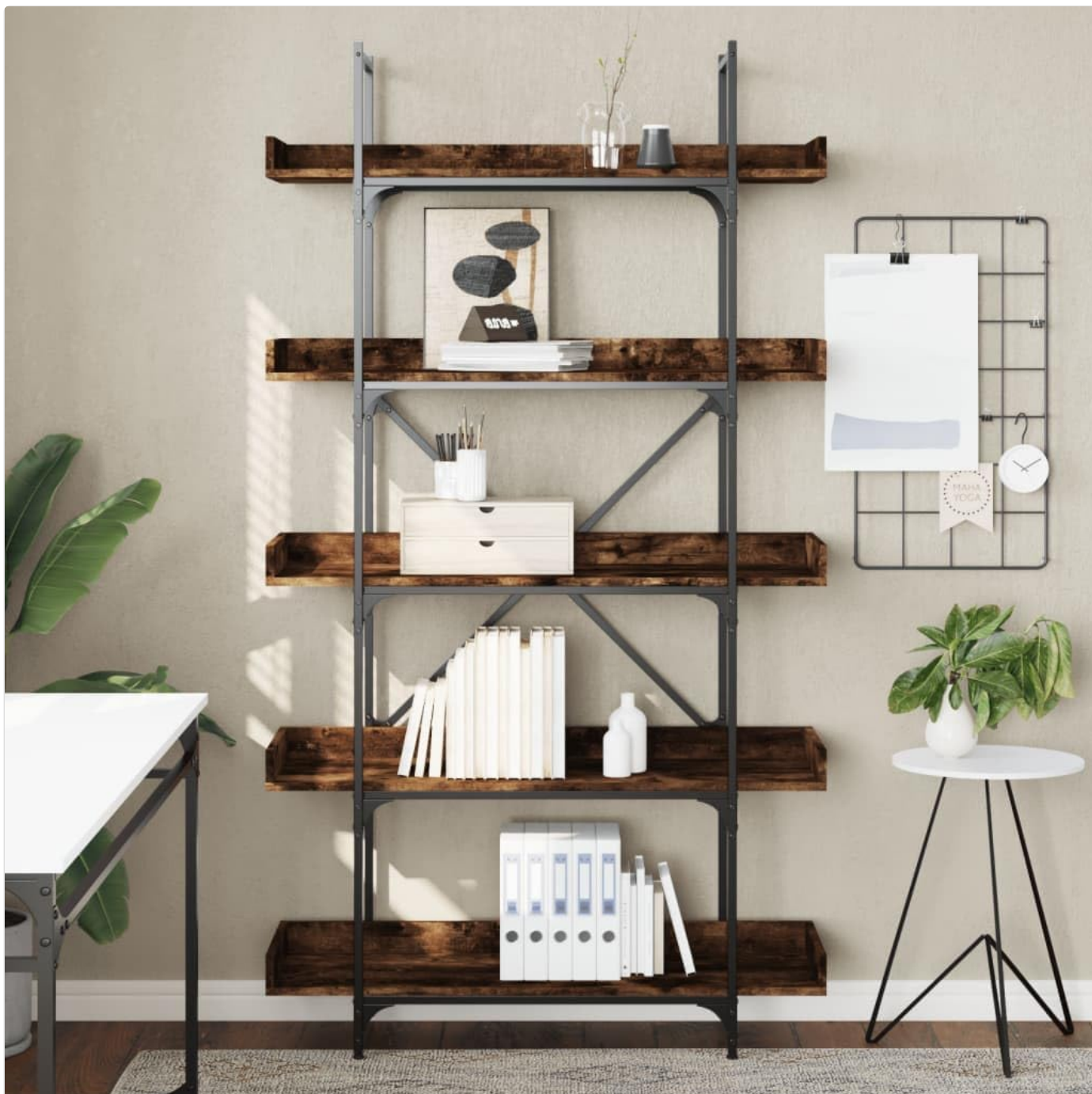
Image: Fully assembled vidaXL 5-Tier Smoked Oak Bookshelf, showcasing its design and storage capacity.