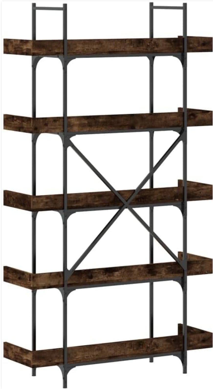
Image: Rear view of the bookshelf frame, highlighting the X-bar design for enhanced stability.