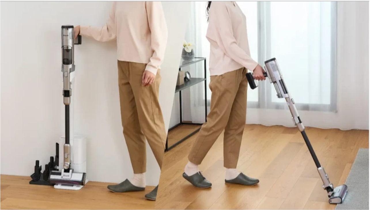
Image: Depiction of the Smart IQ PRO Floor Detect feature, illustrating how the vacuum automatically adjusts suction based on the detected floor type for optimal cleaning.

Image: Visual representation of the Smart IQ PRO Light Detect feature, showing the LED illumination of dark areas to reveal hidden dust and debris.