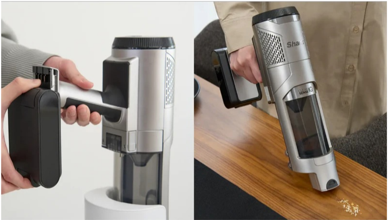
Image: A visual guide showing how to clean the brushroll and empty the dustbin of the Shark CleanSense IQ vacuum, ensuring optimal performance and hygiene.