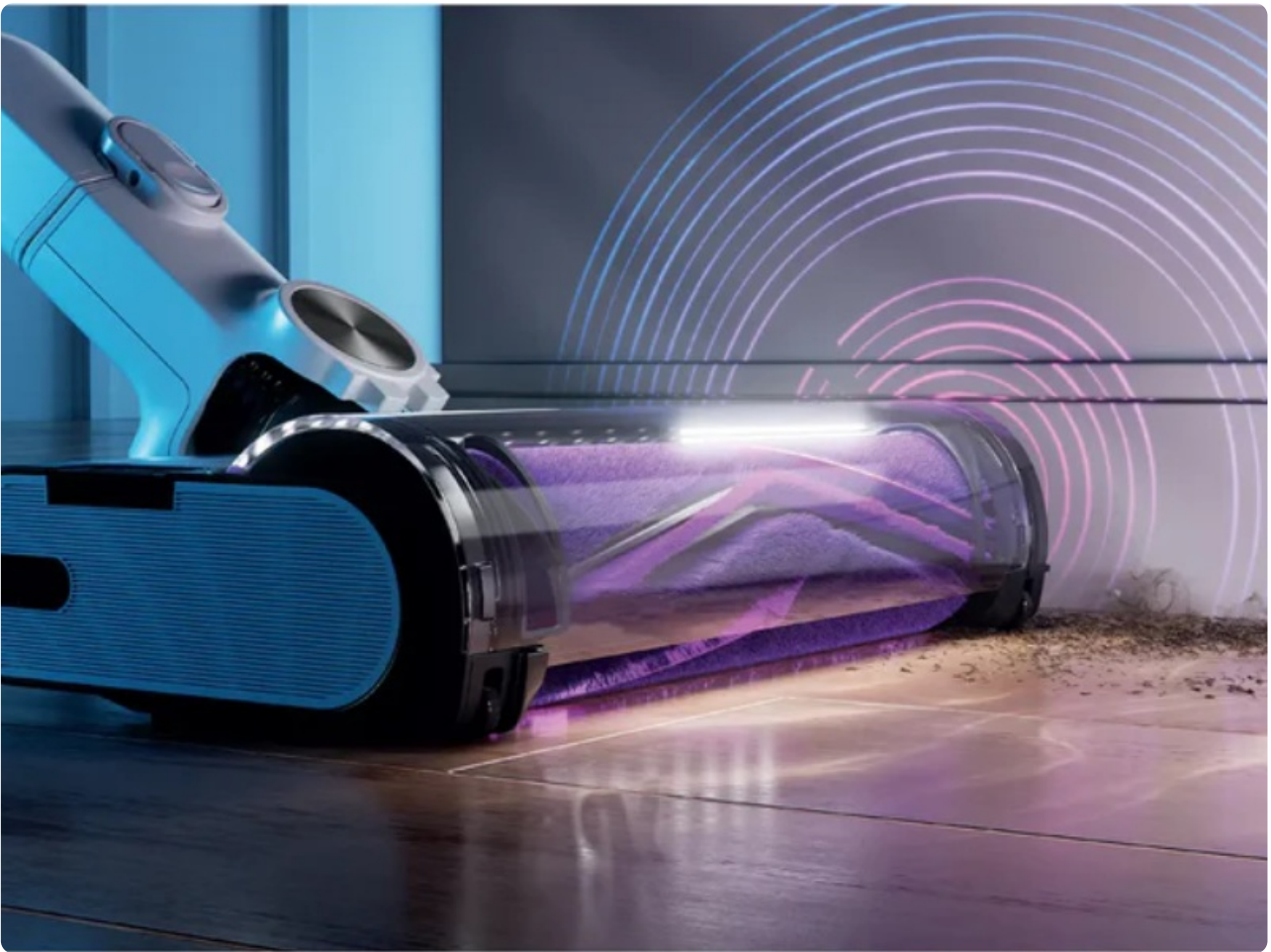
Image: Illustration of the Smart IQ PRO Edge Detect feature, demonstrating how the vacuum increases suction along edges and corners for comprehensive cleaning.