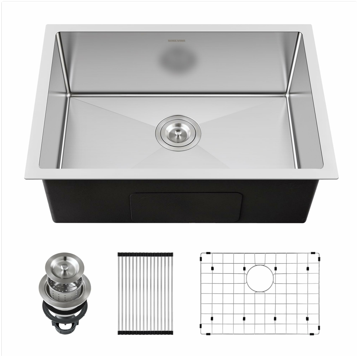
Image: SINKVINE 25-inch Undermount Stainless Steel Kitchen Sink with included accessories.