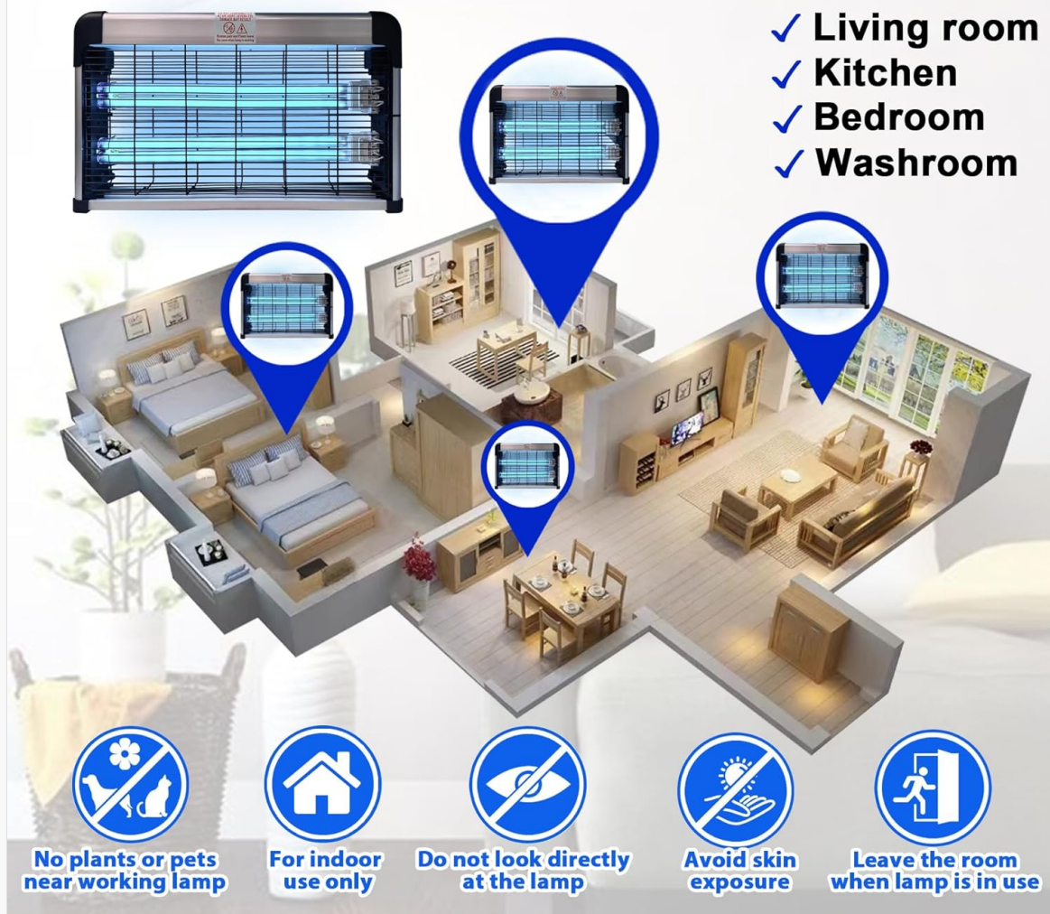
Image 2: Illustrative diagram showing optimal placement of the UV light sanitizer in different room types such as living rooms, kitchens, bedrooms, and washrooms for effective coverage.